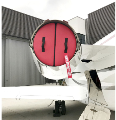
Cessna Citation 680 Exhaust Plugs, folding type

The Engine Inlet Plugs are custom fit for your Cessna Citation Latitude (680A) intakes, made with heavy-duty vinyl material, and stuffed with a single block of sculpted urethane foam. Each plug has a zipper that allows the foam to be removed and dried if necessary. Engine plugs have 'remove before flight' streamers sewn onto the face of the plugs. Most plugs are imprinted with the aircraft registration number in black for an extra charge. Storage bag NOT included. Engine plugs may be inserted after flight when the engine is still warm. Engine Inlet Plugs are commonly referred to as Cowl Plugs, Intake Plugs, Cowl Blocks, Engine Blocks, and Engine Bungs.