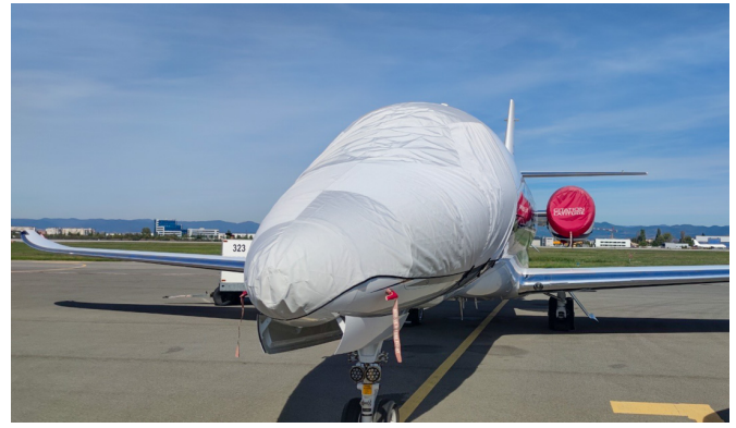
Cessna Citation Latitude (680A) Cockpit/Nose Cover, Doesn't Cover Pitot Tubes