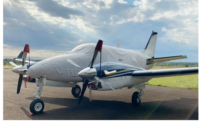
King Air C90GTi Canopy/Nose Cover