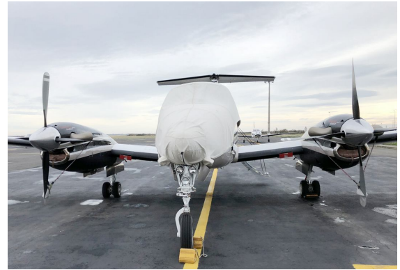
King Air 200 Canopy/Nose Cover