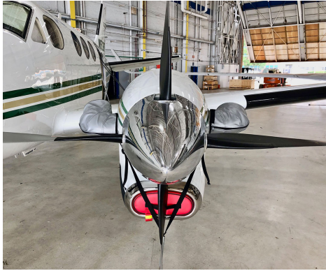
King Air C90GT Exhaust Covers, Fully Enclosed (set of 4)

This cover type is made from Silver Acrylic Sunbrella canvas and is 100% lined with a soft and smooth microfiber. Bruce's Custom Covers developed this material combination especially for aircraft protection. The outer material is medium weight and treated for water resistance, UV resistance and anti-static buildup. The inner lining is a very soft and smooth microfiber to prevent scratching. The material is very reflective, and tests show that the cabin interior temperature can be reduced to near-ambient temperature on the hottest of days. It is water, ice and snow repellent, yet breathable to allow moisture to escape from between the cover and the aircraft surface.