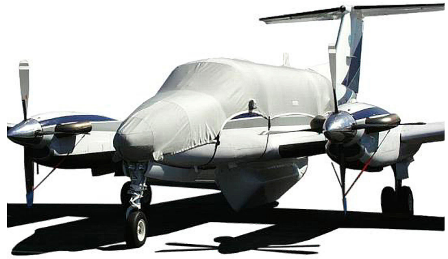
King Air Canopy/Nose Cover