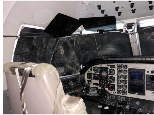
Beech King Air 90 & 100 (U-21, RU-21, T-44) Cockpit Heatshields