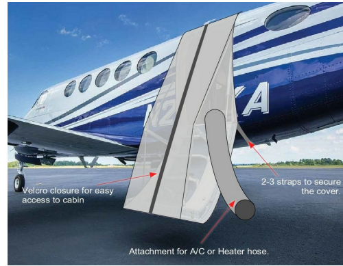
King Air Airstair Door Cover