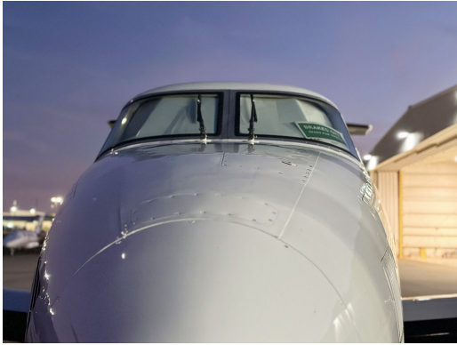
Beechcraft B200 Cockpit Heatshields

for cockpit overheating, but an external fabric cover is more effective for long-term protection.