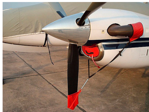
Prop Tie-down/Exhaust Covers