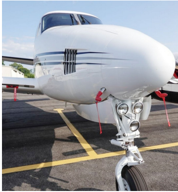
Beech King Air C90 Pitot Covers, Heat Exchanger Plugs

Engine Inlet Plugs are custom fit for your Beech King Air C90B, C90GT intakes, made with heavy-duty vinyl material, and stuffed with a single block of sculpted urethane foam. Each plug has a zipper that allows the foam to be removed and dried if necessary. Engine plugs have warning flags that are visible from the cockpit or 'remove before flight' streamers sewn onto the face of the plugs. Most plugs are imprinted with the aircraft registration number in black for an extra charge. Storage bag NOT included. Engine plugs may be inserted after flight when the engine is still warm. Engine Inlet Plugs are commonly referred to as Cowl Plugs, Intake Plugs, Cowl Blocks, Engine Blocks, and Engine Bungs.