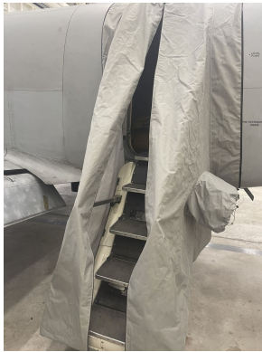
King Air Airstair Door Cover

WINTER USE MATERIAL - Made with Solution-Dyed Polyester fabric, this option is intended for seasonal use to aid in deicing, rain mitigation, or for occasional travel. The material is lighter and more compact, but more susceptible to UV damage and may have a shorter useful life if used continuously outside than the all-year use material.