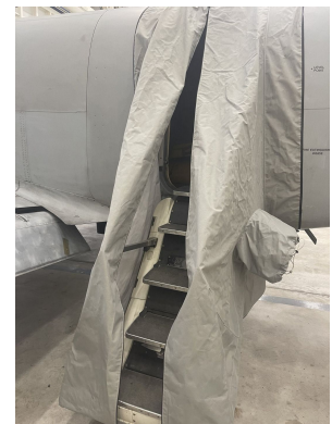
King Air Airstair Door Cover