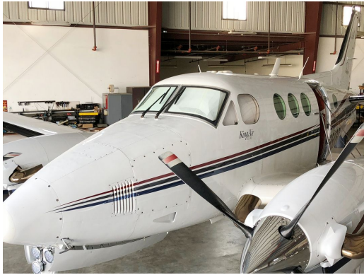
Beech King Air 90 & 100 (U-21, RU-21, T-44) Cockpit Heatshields

Cockpit Heatshields are interior sunshades for the aircraft's cockpit. The product is a unique composite of closed-cell foam with a silver mylar finish. The semi-rigid design is stiff enough to stand inside the window framing. The set folds up flat and is easily stored in the included storage sleeve. Some designs may require velcro and suction cups. A Heatshield is an excellent short-term remedy for cockpit overheating, but an external fabric cover is more effective for long-term protection.