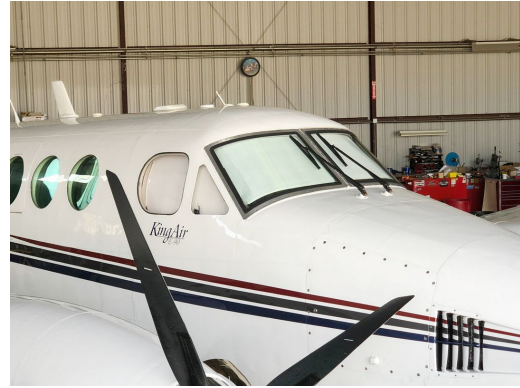
Beech King Air 90 & 100 (U-21, RU-21, T-44) Cockpit Heatshields