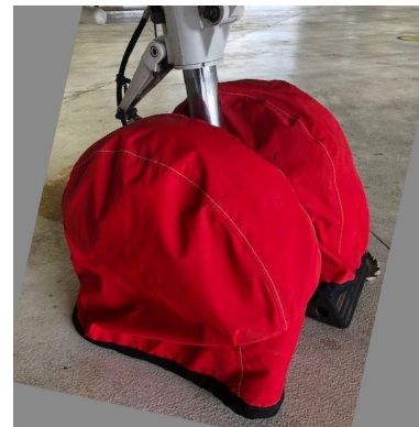
Beech King Air 300 Tire Covers (main gear)