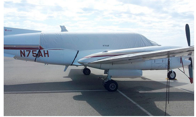
Raytheon Beech King Air Cockpit Cover, Prop Tie/Exhaust Covers, Inlet Plugs