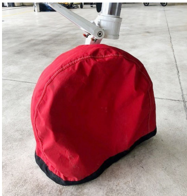
Beech King Air 300 Tire Covers (nose gear)

ALL-YEAR USE MATERIAL - Made with Silver Acrylic Sunbrella canvas, the all-year use material is the best option for sun protection and cover longevity. This heavier more durable material is intended for all weather conditions, such as rain and snow or lots of sun.