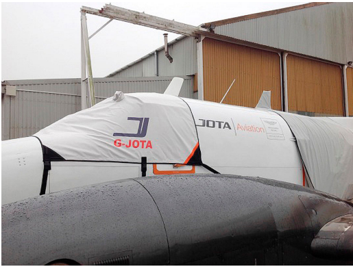
King Air Windshield/Cockpit Cover