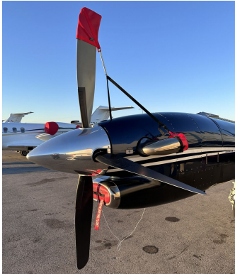
Beech King Air C90A Plug & Prop Tie Set

Engine Inlet Plugs are custom fit for your Beech King Air C90B, C90GT intakes, made with heavy-duty vinyl material, and stuffed with a single block of sculpted urethane foam. Each plug has a zipper that allows the foam to be removed and dried if necessary. Engine plugs have warning flags that are visible from the cockpit or 'remove before flight' streamers sewn onto the face of the plugs. Most plugs are imprinted with the aircraft registration number in black for an extra charge. Storage bag NOT included. Engine plugs may be inserted after flight when the engine is still warm. Engine Inlet Plugs are commonly referred to as Cowl Plugs, Intake Plugs, Cowl Blocks, Engine Blocks, and Engine Bungs.