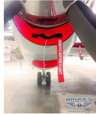
Engine and Oil Cooler Inlet Plugs