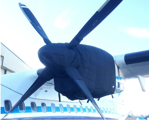
ATR-72-202 Insulated Engine & Prop Hub Covers

This cover type is made from Silver Acrylic Sunbrella canvas and is 100% lined with a soft and smooth microfiber. Bruce's Custom Covers developed this material combination especially for aircraft protection. The outer material is medium weight and treated for water resistance, UV resistance and anti-static buildup. The inner lining is a very soft and smooth microfiber to prevent scratching. The material is very reflective, and tests show that the cabin interior temperature can be reduced to near-ambient temperature on the hottest of days. It is water, ice and snow repellent, yet breathable to allow moisture to escape from between the cover and the aircraft surface.