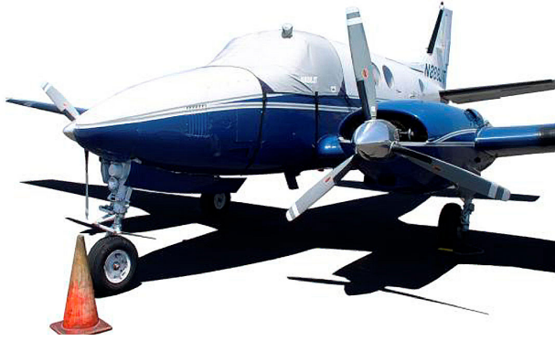
King Air Cockpit Cover, belly-strap type

The material is very reflective, and tests show that the cabin interior temperature can be reduced to near-ambient temperature on the hottest of days. It is water, ice and snow repellent, yet breathable to allow moisture to escape from between the cover and the aircraft surface.