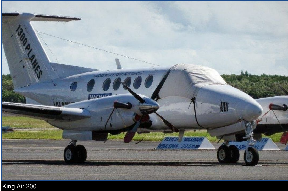
King Air 200