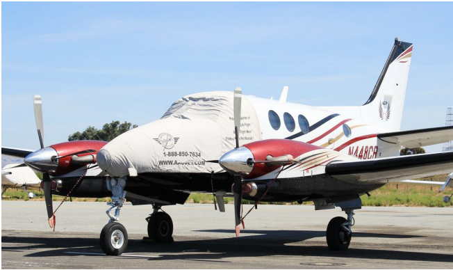
King Air Cockpit/Nose

The material is very reflective, and tests show that the cabin interior temperature can be reduced to near-ambient temperature on the hottest of days. It is water, ice and snow repellent, yet breathable to allow moisture to escape from between the cover and the aircraft surface.