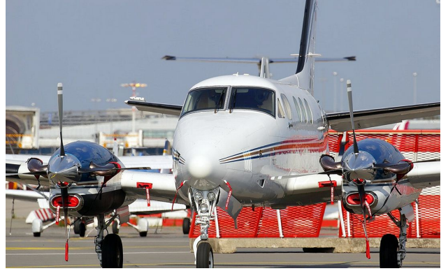
Beech King Air C90A Engine Plugs & Prop Tie/Exhaust Covers