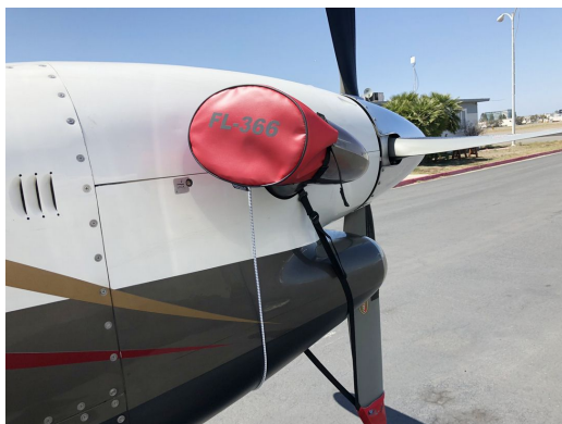
Beech King Air 350 Prop Tie-Downs/Exhaust Covers Combination

This cover type is made from Silver Acrylic Sunbrella canvas and is 100% lined with a soft and smooth microfiber. Bruce's Custom Covers developed this material combination especially for aircraft protection. The outer material is medium weight and treated for water resistance, UV resistance and anti-static buildup. The inner lining is a very soft and smooth microfiber to prevent scratching. The material is very reflective, and tests show that the cabin interior temperature can be reduced to near-ambient temperature on the hottest of days. It is water, ice and snow repellent, yet breathable to allow moisture to escape from between the cover and the aircraft surface.