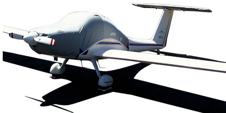
Grob 109 Canopy/Engine Cover & Horiz. Stabilizer Cover