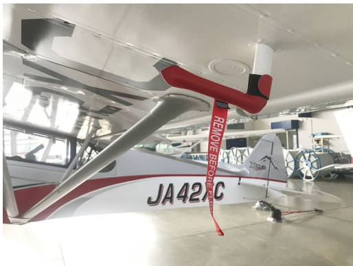
Cub Crafters X Cub CC19-180 Pitot Cover Long L-Type

Engine Inlet Plugs are custom fit for your CubCrafters CC-11, Sport Cub S2, & Carbon Cub intakes, made with heavy-duty vinyl material, and stuffed with a single block of sculpted urethane foam. Each plug has a zipper that allows the foam to be removed and dried if necessary. Engine plugs have warning flags that are visible from the cockpit or 'remove before flight' streamers sewn onto the face of the plugs. Most plugs are imprinted with the aircraft registration number in black for an extra charge. Storage bag NOT included. Engine plugs may be inserted after flight when the engine is still warm. Engine Inlet Plugs are commonly referred to as Cowl Plugs, Intake Plugs, Cowl Blocks, Engine Blocks, and Engine Bungs.