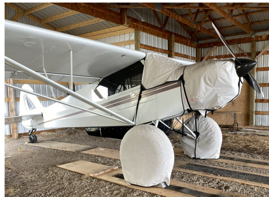
CubCrafters CC-11 Windshield, Engine & Tire Covers