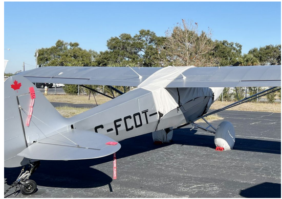
CubCrafters Carbon Cub EX-3 Canopy Cover, Tire Covers