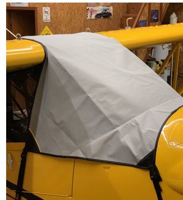
Cub Crafters Carbon Cub FX3 Windshield/Skylight Cover, travel weight