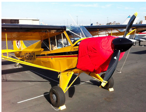
Aviat Husky Insulated Engine Cover