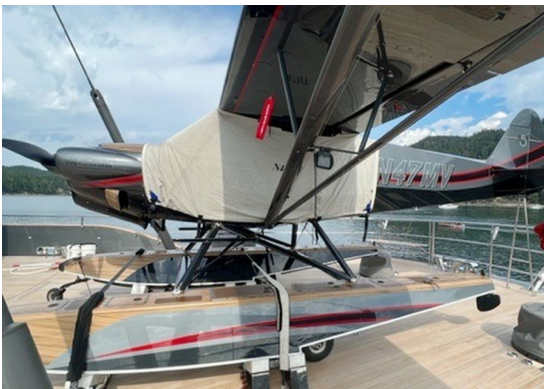
Cubcrafters CC11-160 Extended Canopy Cover

This cover type is made from Silver Acrylic Sunbrella canvas and is 100% lined with a soft and smooth microfiber. Bruce's Custom Covers developed this material combination especially for aircraft protection. The outer material is medium weight and treated for water resistance, UV resistance and anti-static buildup. The inner lining is a very soft and smooth microfiber to prevent scratching. The material is very reflective, and tests show that the cabin interior temperature can be reduced to near-ambient temperature on the hottest of days. It is water, ice and snow repellent, yet breathable to allow moisture to escape from between the cover and the aircraft surface.