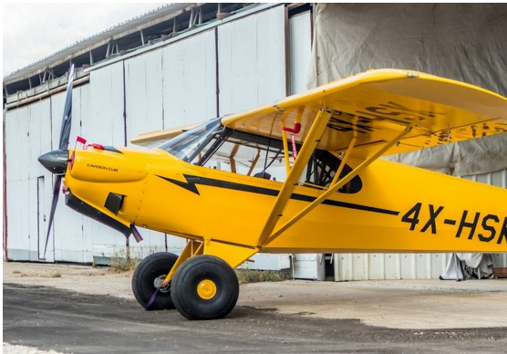
Cub Crafters Carbon Cub SS Engine Inlet Plugs & Pitot Cover

Engine Inlet Plugs are custom fit for your CubCrafters CC-11, Sport Cub S2, & Carbon Cub intakes, made with heavy-duty vinyl material, and stuffed with a single block of sculpted urethane foam. Each plug has a zipper that allows the foam to be removed and dried if necessary. Engine plugs have warning flags that are visible from the cockpit or 'remove before flight' streamers sewn onto the face of the plugs. Most plugs are imprinted with the aircraft registration number in black for an extra charge. Storage bag NOT included. Engine plugs may be inserted after flight when the engine is still warm. Engine Inlet Plugs are commonly referred to as Cowl Plugs, Intake Plugs, Cowl Blocks, Engine Blocks, and Engine Bungs.