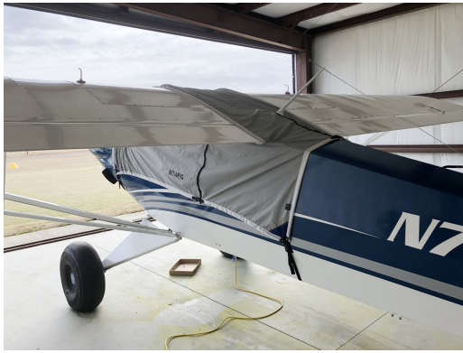
Cub Crafters Carbon Cub Travel Weight Canopy Cover