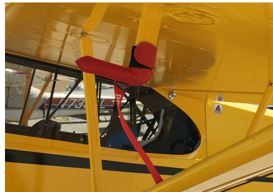
Cub Crafters CC-11 Carbon Cub Pitot Cover