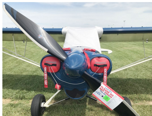
Cub Crafters EX2 Canopy Cover, Engine Plugs