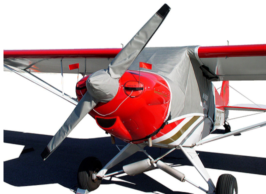
Cub Crafters Sport Cub Prop Cover & Engine Plugs

Engine Inlet Plugs are custom fit for your CubCrafters CC-11, Sport Cub S2, & Carbon Cub intakes, made with heavy-duty vinyl material, and stuffed with a single block of sculpted urethane foam. Each plug has a zipper that allows the foam to be removed and dried if necessary. Engine plugs have warning flags that are visible from the cockpit or 'remove before flight' streamers sewn onto the face of the plugs. Most plugs are imprinted with the aircraft registration number in black for an extra charge. Storage bag NOT included. Engine plugs may be inserted after flight when the engine is still warm. Engine Inlet Plugs are commonly referred to as Cowl Plugs, Intake Plugs, Cowl Blocks, Engine Blocks, and Engine Bungs.