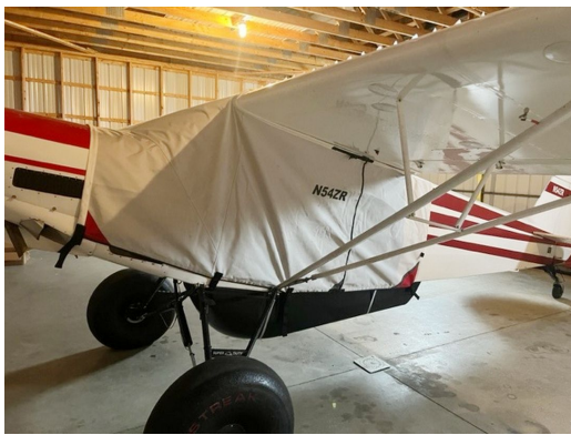
Piper PA-11 Extended Canopy Cover, Over the Top Style