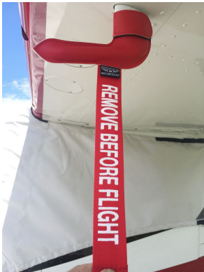
Cessna A185F Pitot Cover