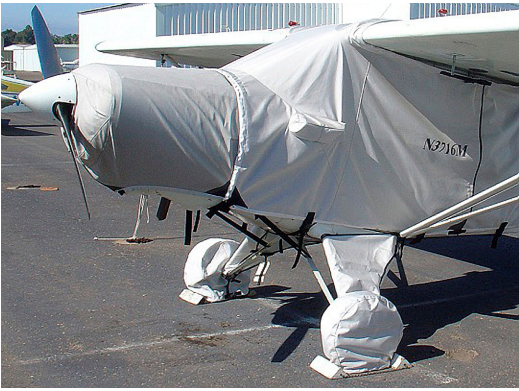
Piper PA-12 Landing Gear Covers