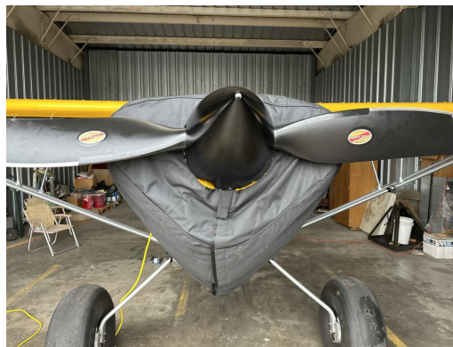
CubCrafters Insulated Engine Cove