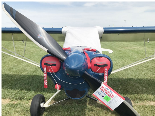
Cub Crafters EX2 Canopy Cover, Engine Plugs

Engine Inlet Plugs are custom fit for your CubCrafters CC-11, Sport Cub S2, & Carbon Cub intakes, made with heavy-duty vinyl material, and stuffed with a single block of sculpted urethane foam. Each plug has a zipper that allows the foam to be removed and dried if necessary. Engine plugs have warning flags that are visible from the cockpit or 'remove before flight' streamers sewn onto the face of the plugs. Most plugs are imprinted with the aircraft registration number in black for an extra charge. Storage bag NOT included. Engine plugs may be inserted after flight when the engine is still warm. Engine Inlet Plugs are commonly referred to as Cowl Plugs, Intake Plugs, Cowl Blocks, Engine Blocks, and Engine Bungs.