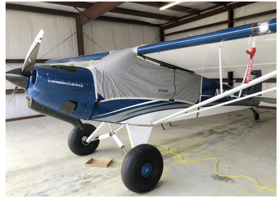
Cub Crafters Carbon Cub Travel Weight Canopy Cover