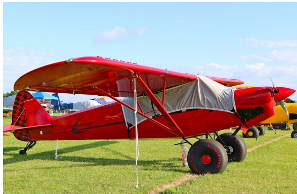
Cub Crafters CCX-2000 Travel Canopy Cover