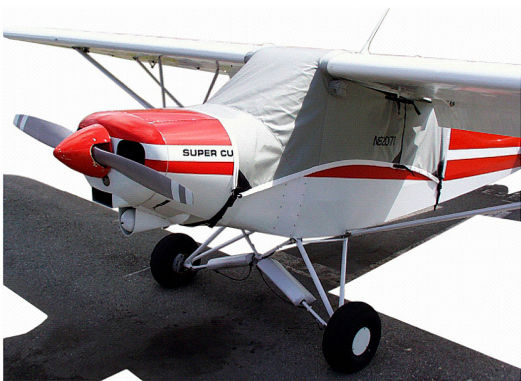
Piper PA-18 Super Cub Canopy Cover

This cover type is made from Silver Acrylic Sunbrella canvas and is 100% lined with a soft and smooth microfiber. Bruce's Custom Covers developed this material combination especially for aircraft protection. The outer material is medium weight and treated for water resistance, UV resistance and anti-static buildup. The inner lining is a very soft and smooth microfiber to prevent scratching. The material is very reflective, and tests show that the cabin interior temperature can be reduced to near-ambient temperature on the hottest of days. It is water, ice and snow repellent, yet breathable to allow moisture to escape from between the cover and the aircraft surface.