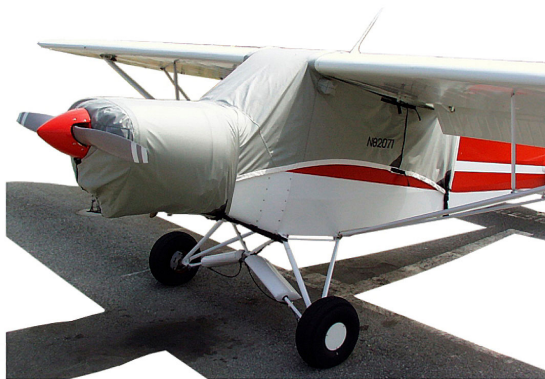
Piper PA-18 Super Cub Canopy & Engine Covers

This cover type is made from Silver Acrylic Sunbrella canvas and is 100% lined with a soft and smooth microfiber. Bruce's Custom Covers developed this material combination especially for aircraft protection. The outer material is medium weight and treated for water resistance, UV resistance and anti-static buildup. The inner lining is a very soft and smooth microfiber to prevent scratching. The material is very reflective, and tests show that the cabin interior temperature can be reduced to near-ambient temperature on the hottest of days. It is water, ice and snow repellent, yet breathable to allow moisture to escape from between the cover and the aircraft surface.