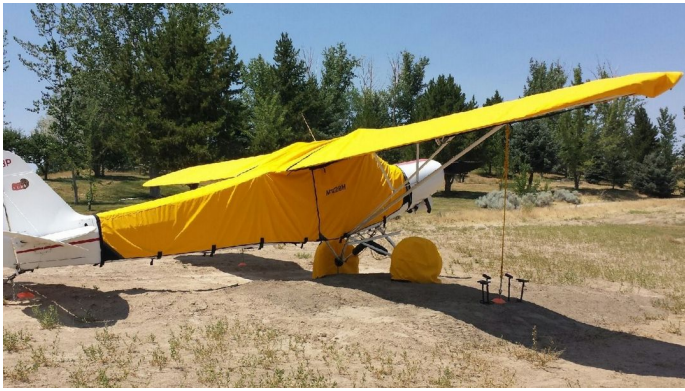
Piper PA-18 Super Cub Extended Canopy Cover, Wing & Tire Covers