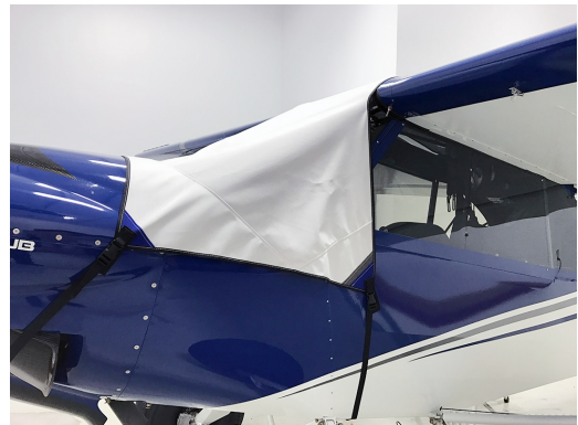
Cub Crafters CC-11 Windshield Cover