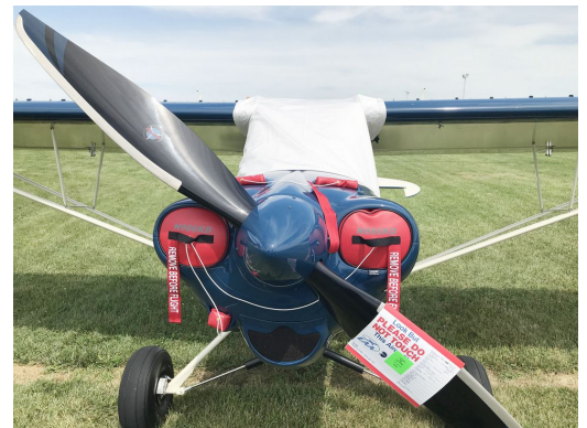
Cubcrafters CC-18 Engine Inlet Plugs