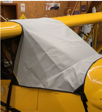
Cub Crafters Carbon Cub FX3 Windshield/Skylight Cover, travel weight