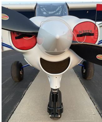
CubCrafters CC-18, 19, 20, Top Cub, CCK-1865, CC-19 X-Cub, CCX-2000, EX-3, FX-3 Engine Inlet Plugs

Engine Inlet Plugs are custom fit for your CubCrafters CC-18, 19, 20, Top Cub, CCK-1865, CC-19 X-Cub, CCX-2000, EX-3, FX-3 intakes, made with heavy-duty vinyl material, and stuffed with a single block of sculpted urethane foam. Each plug has a zipper that allows the foam to be removed and dried if necessary. Engine plugs have warning flags that are visible from the cockpit or 'remove before flight' streamers sewn onto the face of the plugs. Most plugs are imprinted with the aircraft registration number in black for an extra charge. Storage bag NOT included. Engine plugs may be inserted after flight when the engine is still warm. Engine Inlet Plugs are commonly referred to as Cowl Plugs, Intake Plugs, Cowl Blocks, Engine Blocks, and Engine Bungs.