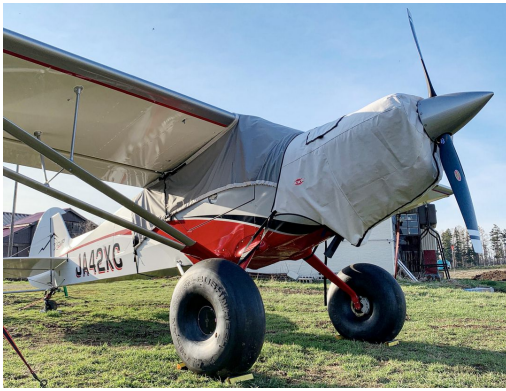
Cub Crafters CC19 X-Cub Engine Cover, Travel Weight Canopy Cover