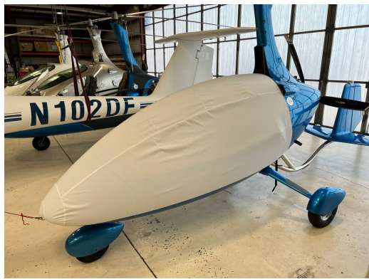
Autogyro Calidus Canopy/Nose Cover, test fit cover