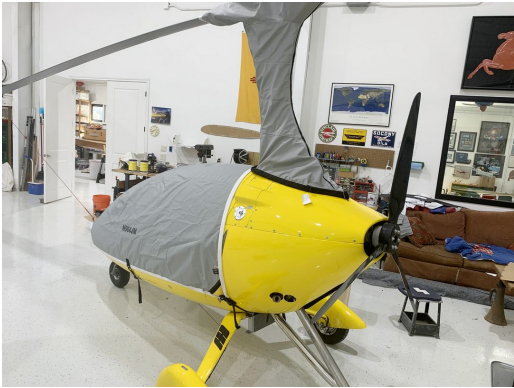
Autogyro Calidus Gyrocopter Canopy/Nose & Rotor Hub/Mast Cover

Travel Covers are made with Silver Solution-Dyed Polyester fabric and fully lined over the entire cover. The material is lightweight and more compact for easy storage in the aircraft. The polyester material is water resistant, but only intended for occasional use outside. We also have an ultra lightweight material available for fitted hangar dust covers. For daily outdoor use, the non-travel Sunbrella Cover is the best choice.