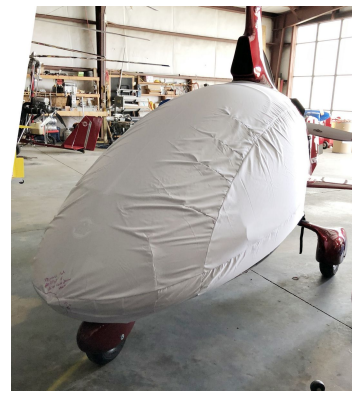
Cavalon Gyrocopter Bubble Cover, test fit cover