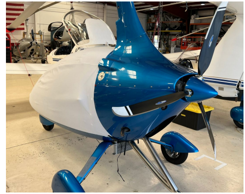
Autogyro Calidus Canopy/Nose Cover, test fit cover