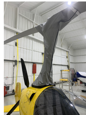
Autogyro Calidus Gyrocopter Rotor Hub/Mast Cover