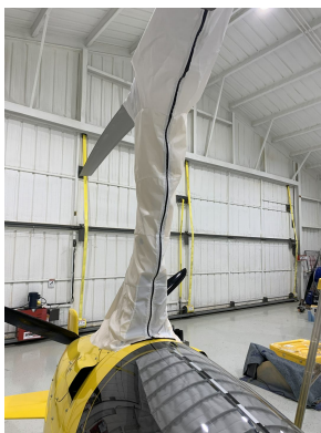
Calidus Gyrocopter Rotor Mast Cover, test fit cover

Rotor Hub Covers overlaps with the Blade Covers to ensure complete protection for the entire main rotor system. Designed like a jacket with sleeves and no collar, the rotor hub cover fastens together below each blade with Delrin buckles. The Rotor Hub Cover is normally made from Solution-Dyed Polyester.