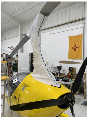
Calidus Gyrocopter Rotor Mast Cover, test fit cover

Rotor Hub Covers overlaps with the Blade Covers to ensure complete protection for the entire main rotor system. Designed like a jacket with sleeves and no collar, the rotor hub cover fastens together below each blade with Delrin buckles. The Rotor Hub Cover is normally made from Solution-Dyed Polyester.