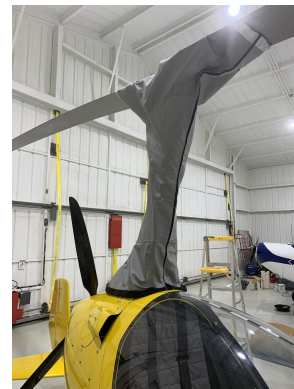
Autogyro Calidus Gyrocopter Rotor Hub/Mast Cover