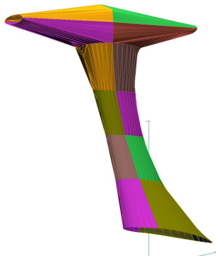
Autogyro Calidus Rotor Mast Cover, 3D model

Rotor Hub Covers overlaps with the Blade Covers to ensure complete protection for the entire main rotor system. Designed like a jacket with sleeves and no collar, the rotor hub cover fastens together below each blade with Delrin buckles. The Rotor Hub Cover is normally made from Solution-Dyed Polyester.