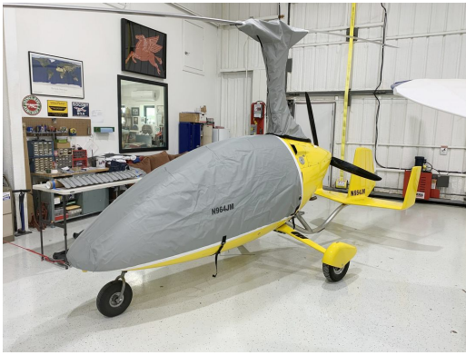
Autogyro Calidus Gyrocopter Canopy/Nose & Rotor Hub/Mast Cover