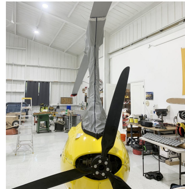
Autogyro Calidus Gyrocopter Rotor Hub/Mast Cover