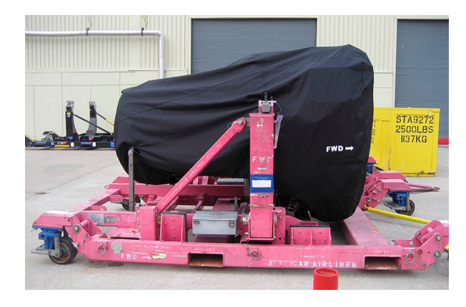
Exhaust Cone, fully enclosed