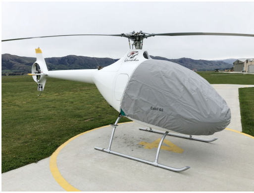
Guimbal Cabri CG2 Bubble Cover, light weight travel type