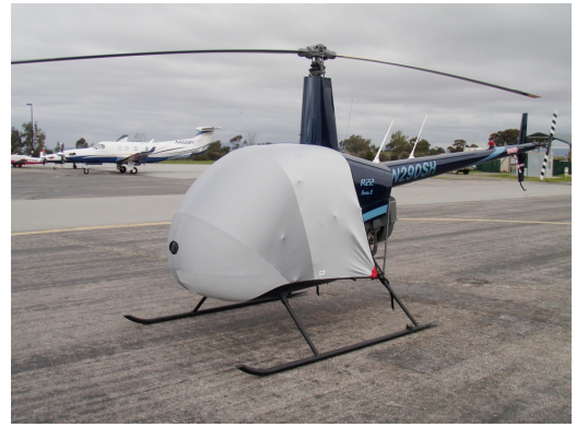
Robinson R-22 Light Weight Travel Cover