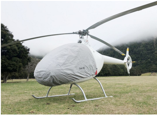
Guimbal Cabri CG2 Bubble Cover, light weight travel type