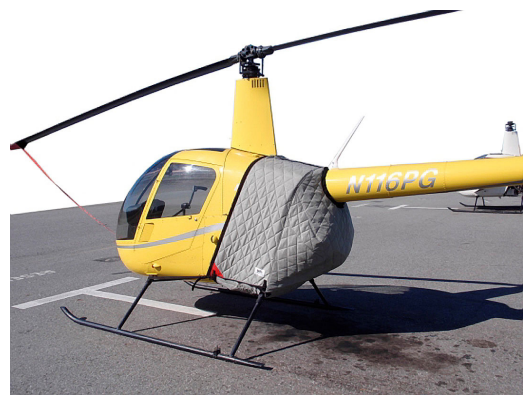
Robinson R-22 Insulated Engine Cover (also covers bottom) & Front Blade Tie-down