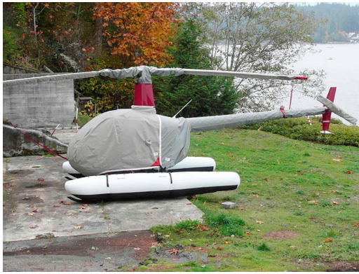
Robinson R-22 Bubble Cover (Ext. Past Rotor Hub), Engine Cover, Tailboom Cover, Blade Covers, Rotor Hub Cover, & Tail Rotor Gear Box Cover