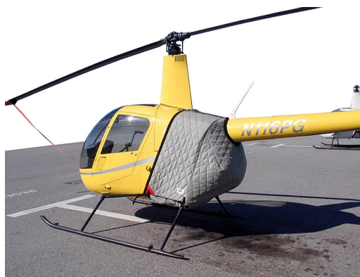
Guimbal Cabri G2 Bubble Cover, 3D model Robinson R-22 Insulated Engine Cover (also covers bottom) & Front Blade Tie-down