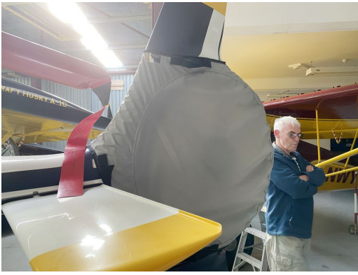
Guimbal Cabri G2 Tailfan Housing Fenestron Cover