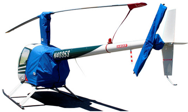
Robinson R-22 Engine, Rotor Mast & Tail Rotor Covers, with Blade Tie-down