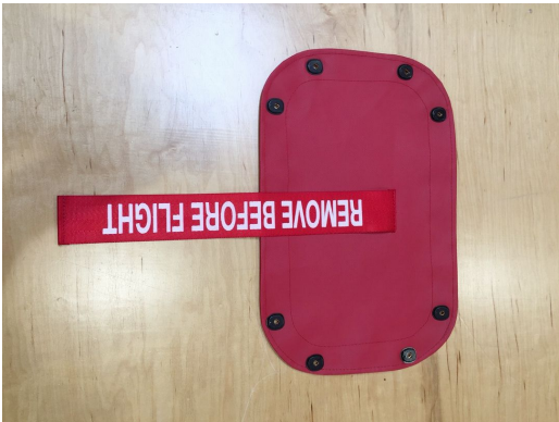
Boeing Vertol CH-47 Chinook Forward Pylon Top Inlet Screen Cover Boeing Vertol CH-47 Chinook Forward Pylon Side Inlet Snap Covers