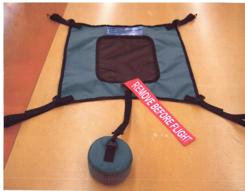
Boeing Vertol CH-47 Chinook Aft Transmission Cooling Fan Inlet/Exhaust Cover