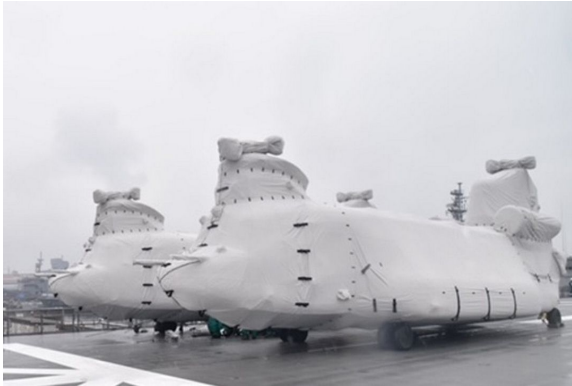
Boeing CH-47 Complete Body Cover

This cover type is made from Silver Acrylic Sunbrella canvas and is 100% lined with a soft and smooth microfiber. Bruce's Custom Covers developed this material combination especially for aircraft protection. The outer material is medium weight and treated for water resistance, UV resistance and anti-static buildup. The inner lining is a very soft and smooth microfiber to prevent scratching. The material is very reflective, and tests show that the cabin interior temperature can be reduced to near-ambient temperature on the hottest of days. It is water, ice and snow repellent, yet breathable to allow moisture to escape from between the cover and the aircraft surface.