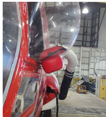
Boeing Vertol CH-47 Logger Window Plug