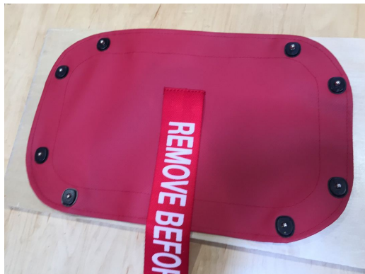
Boeing Vertol CH-47 Chinook Forward Pylon Side Inlet Snap Covers

Insulated Covers Material - A special composite material of solution-dyed polyester, 3M Thinsulate insulation, and soft nylon interior fabric. Our insulated covers are designed to complement an engine preheater and help retain heat in the engine compartment after shutdown. If you operate your aircraft in cold-weather, these covers will help prevent engine wear and tear.