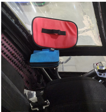
Boeing Vertol CH-47 Logger Window Plug

The Engine Inlet Plugs are custom fit for your Boeing Vertol CH-47 Chinook intakes, made with heavy-duty vinyl material, and stuffed with a single block of sculpted urethane foam. Each plug has a zipper that allows the foam to be removed and dried if necessary. Engine plugs have 'Remove Before Flight' streamers sewn onto the face of the plugs. Most plugs are imprinted with the aircraft registration number in black for an extra charge. Storage bag NOT included. Engine plugs may be inserted after flight when the engine is still warm. Engine Inlet Plugs are commonly referred to as Cowl Plugs, Intake Plugs, Cowl Blocks, Engine Blocks, and Engine Bungs.