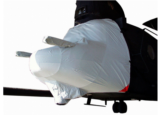
Spec. Op's CH-47: refuel boom, FLIR dome