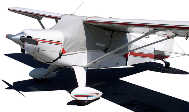
Piper Pacer Canopy Cover

This cover type is made from Silver Acrylic Sunbrella canvas and is 100% lined with a soft and smooth microfiber. Bruce's Custom Covers developed this material combination especially for aircraft protection. The outer material is medium weight and treated for water resistance, UV resistance and anti-static buildup. The inner lining is a very soft and smooth microfiber to prevent scratching. The material is very reflective, and tests show that the cabin interior temperature can be reduced to near-ambient temperature on the hottest of days. It is water, ice and snow repellent, yet breathable to allow moisture to escape from between the cover and the aircraft surface.