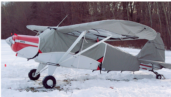
Piper Clipper Canopy Cover, Empennage & Wing Covers, Engine Plugs

WINTER USE MATERIAL - Made with Solution-Dyed Polyester fabric, this option is intended for seasonal use to aid in deicing, rain mitigation, or for occasional travel. The material is lighter and more compact, but more susceptible to UV damage and may have a shorter useful life if used continuously outside than the all-year use material.