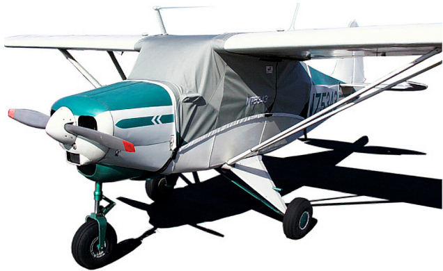
Tri-Pacer Over-the-Top Canopy Cover

lightweight and more compact for easy stowage in the aircraft. The polyester material is water resistant, but only intended for occasional use outside. We also have an ultra lightweight material available for fitted hangar dust covers. For daily outdoor use, the non-travel Sunbrella Cover is the best choice.