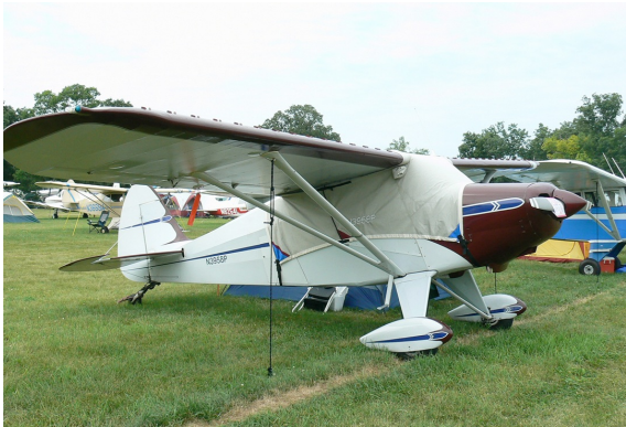
Piper Pacer Canopy Cover