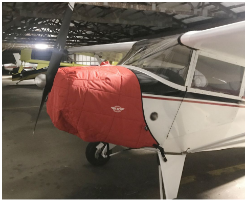
Piper PA-15 Vagabond Insulated Engine Cover