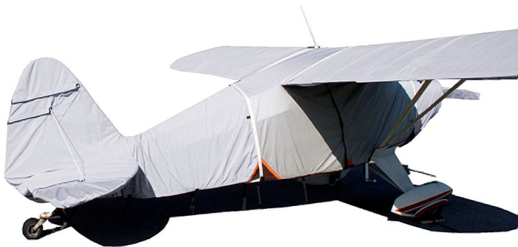
Piper Pacer Full Cover Set