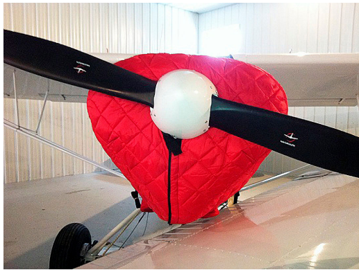
Piper PA-18 Super Cub Insulated Engine Cover

Insulated Covers Material - A special composite material of solution-dyed polyester, 3M Thinsulate insulation, and soft nylon interior fabric. Our insulated covers are designed to complement an engine preheater and help retain heat in the engine compartment after shutdown. If you operate your aircraft in cold-weather, these covers will help prevent engine wear and tear.