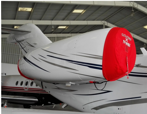
Citation X Intake/Exhaust Cover Set

The Cessna Citation X (750) Intake Covers are designed to install easily yet be completely storable. A spring steel hoop is sewn into the hem of each cover, allowing them to be installed without climbing onto the wing or using a stepladder. To store the covers the spring steel hoop folds like a band-saw blade into three nesting rings. Each cover folds into a compact circular bundle which is stored in the included duffle bag, yet they unfold quickly for use. The Tri-Fold Ring cover is made of medium weight nylon which is available in a variety of colors to match the paint trim. Each cover set comes complete with installation and folding instructions. The aircraft's registration number can be silkscreened onto the cover for an extra charge.