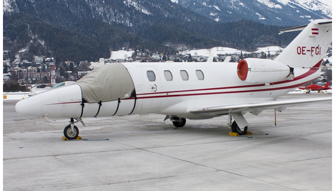
Cessna Citationjet CJ1 Cockpit Cover