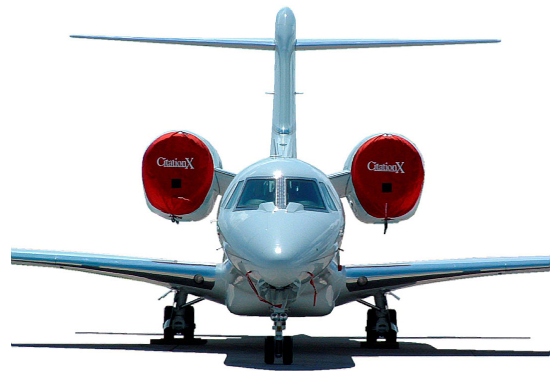
Citation X Intake Covers