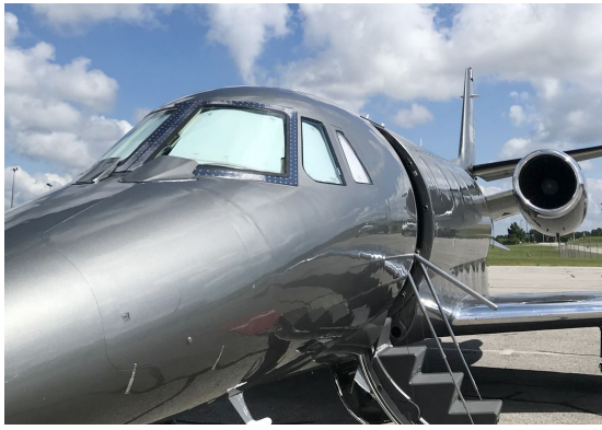
Cessna Citation 560XL Cockpit HeatShields