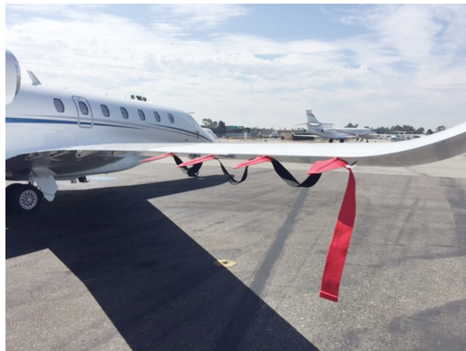
Citation X Static Wick Protectors

The Engine Exhaust Plugs are custom fit for your Cessna Citation X (750) exhaust openings, made with heavy-duty vinyl material, and stuffed with a single block of sculpted urethane foam. Each plug has a zipper that allows the foam to be removed and dried if necessary. Exhaust plugs have 'remove before flight' streamers sewn onto the face of the plugs. Most plugs are imprinted with the aircraft registration number in black for an extra charge. Exhaust plugs may be inserted soon after flight when the engine is still warm. Engine Inlet Plugs are commonly referred to as Cowl Plugs, Intake Plugs, Cowl Blocks, Engine Blocks, and Engine Bungs.