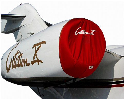
Citation X Intake Covers

The Cessna Citation X (750) Intake Covers are designed to install easily yet be completely storable. A spring steel hoop is sewn into the hem of each cover, allowing them to be installed without climbing onto the wing or using a stepladder. To store the covers the spring steel hoop folds like a band-saw blade into three nesting rings. Each cover folds into a compact circular bundle which is stored in the included duffle bag, yet they unfold quickly for use. The Tri-Fold Ring cover is made of medium weight nylon which is available in a variety of colors to match the paint trim. Each cover set comes complete with installation and folding instructions. The aircraft's registration number can be silkscreened onto the cover for an extra charge.