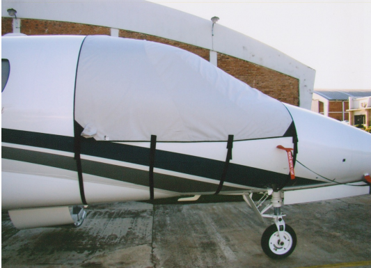
Citation XL Cockpit Cover

This cover type is made from Silver Acrylic Sunbrella canvas and is 100% lined with a soft and smooth microfiber. Bruce's Custom Covers developed this material combination especially for aircraft protection. The outer material is medium weight and treated for water resistance, UV resistance and anti-static buildup. The inner lining is a very soft and smooth microfiber to prevent scratching. The material is very reflective, and tests show that the cabin interior temperature can be reduced to near-ambient temperature on the hottest of days. It is water, ice and snow repellent, yet breathable to allow moisture to escape from between the cover and the aircraft surface.