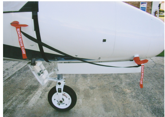
Citation XL Pitot Covers