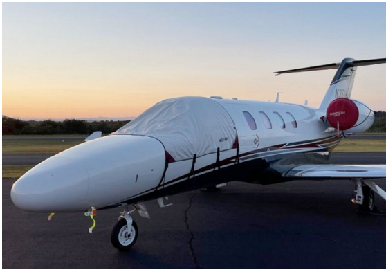
Cessna Citation Jet 525 Cockpit Cover