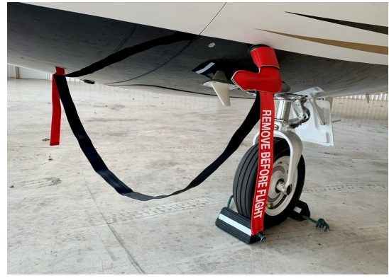
Cessna Citationjet CJ1 Pitot Cover Set