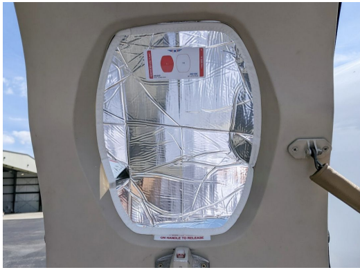
Citationjet Entrance Door Heatshield