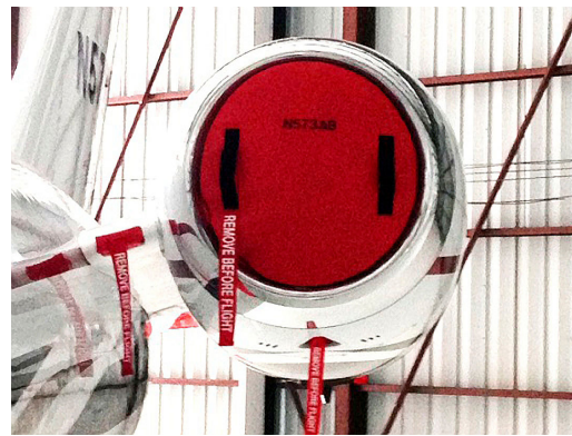
Citation CJ4 Intake Plugs pair