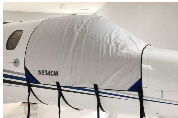
Cessna Citation M2 Cockpit Cover