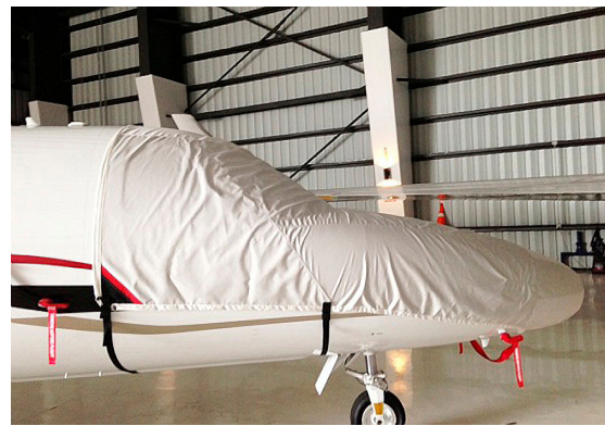
Citation CJ4 Cockpit/Nose Cover and Heat Resistant Pitot Covers set