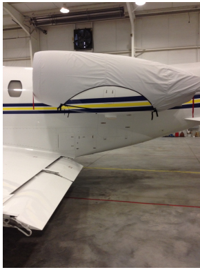
Cessna Citation 560XL Upper Nacelle/Brightwork Covers