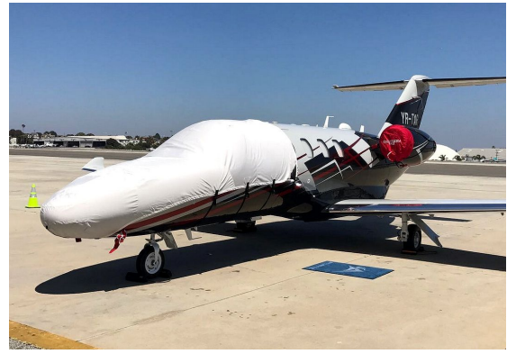
Citationjet CJ1 Cockpit/Nose Cover