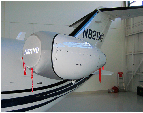
Cessna 510 Mustang Bikini Type Engine Cover