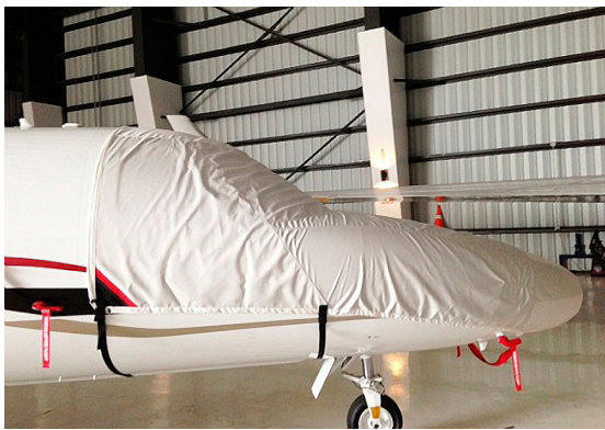
Citation CJ4 Cockpit/Nose Cover and Heat Resistant Pitot Covers set