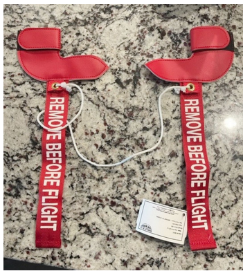
Cessna Citation Pitot Cover Set