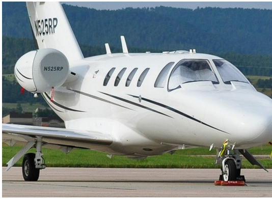
Cessna Citationjet CJ1 Bikini Type Engine Covers