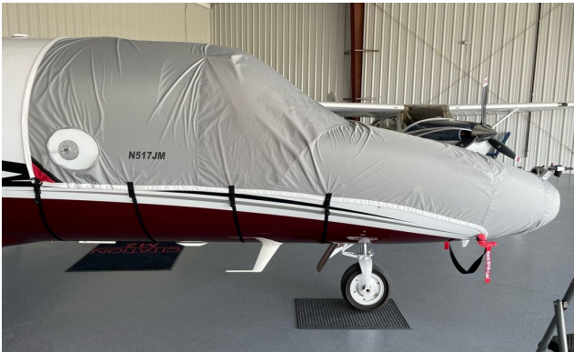
Cessna Citationjet M2 Light Weight Travel Cockpit/Nose Cover

Travel Covers are made with Silver Solution-Dyed Polyester fabric and only lined over the windshield to save weight. The material is lightweight and more compact for easy stowage in the aircraft. The polyester material is water resistant, but only intended for occasional use outside. We also have an ultra lightweight material available for fitted hangar dust covers. For daily outdoor use, the non-travel Sunbrella Cover is the best choice.