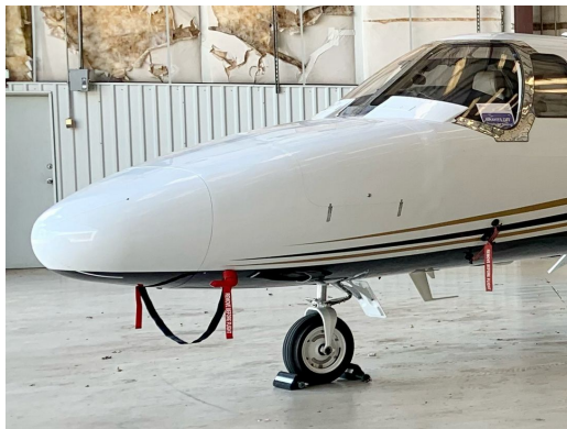
Cessna Citationjet CJ1 Pitot Cover Set