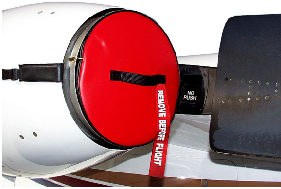
Engine Exhaust Plug