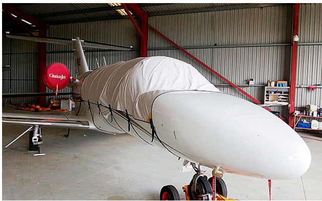
Citation CJ-1 Canopy Cover and Engine Covers

Travel Covers are made with Silver Solution-Dyed Polyester fabric and only lined over the windshield to save weight. The material is lightweight and more compact for easy stowage in the aircraft. The polyester material is water resistant, but only intended for occasional use outside. We also have an ultra lightweight material available for fitted hangar dust covers. For daily outdoor use, the non-travel Sunbrella Cover is the best choice.