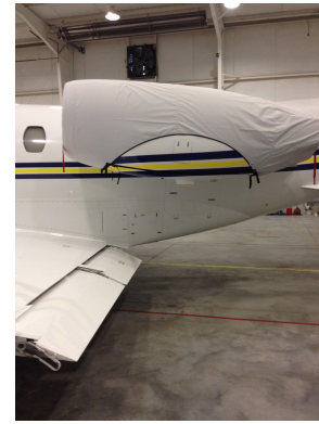
Cessna Citation 560XL Upper Nacelle/Brightwork Covers