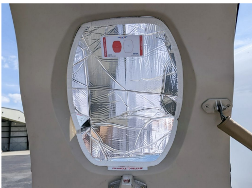
Citationjet Entrance Door Heatshield

Custom-made Heatshield Sunshades are available for almost any window in the jet. Side windows, Skylights, and Emergency Exits are all custom-made. The product is a unique composite of closed-cell foam with a silver mylar finish. The set is easily stored in the included storage sleeve. Some designs may require velcro and suction cups. Our Heatshields are offered white side out since aircraft manufacturers have issued advisories against reflective window inserts due to potential heat damage.