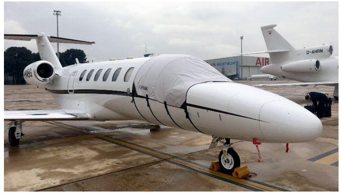
Cessna Citationjet 525A, CJ-2, & CJ2+ Cockpit Cover