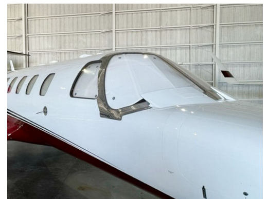
Cessna 525A Cockpit heatshields