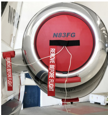
Cessna Citation Mustang 510 Engine Plugs

The Engine Inlet Plugs are custom fit for your Cessna Citationjet 525A, CJ-2, & CJ2+ intakes, made with heavy-duty vinyl material, and stuffed with a single block of sculpted urethane foam. Each plug has a zipper that allows the foam to be removed and dried if necessary. Engine plugs have 'remove before flight' streamers sewn onto the face of the plugs. Most plugs are imprinted with the aircraft registration number in black for an extra charge. Storage bag NOT included. Engine plugs may be inserted after flight when the engine is still warm. Engine Inlet Plugs are commonly referred to as Cowl Plugs, Intake Plugs, Cowl Blocks, Engine Blocks, and Engine Bunges.