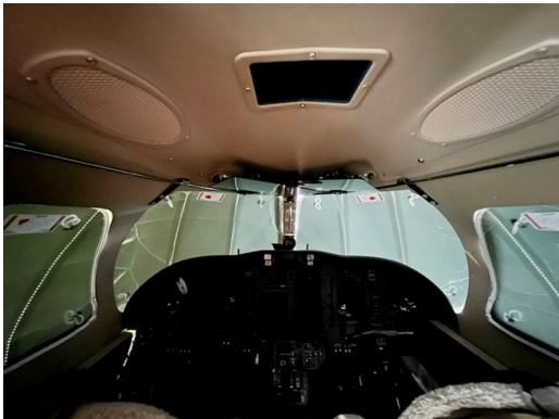
Cessna 525A Cockpit heatshields

Custom-made Heatshield Sunshades are available for almost any window in the jet. Side windows, Skylights, and Emergency Exits are all custom-made. The product is a unique composite of closed-cell foam with a silver mylar finish. The set is easily stored in the included storage sleeve. Some designs may require velcro and suction cups. Our Heatshields are offered white side out since aircraft manufacturers have issued advisories against reflective window inserts due to potential heat damage.