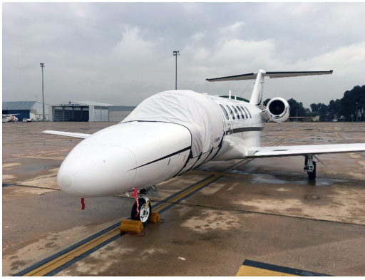
Cessna Citationjet 525A, CJ-2, & CJ2+ Cockpit Cover