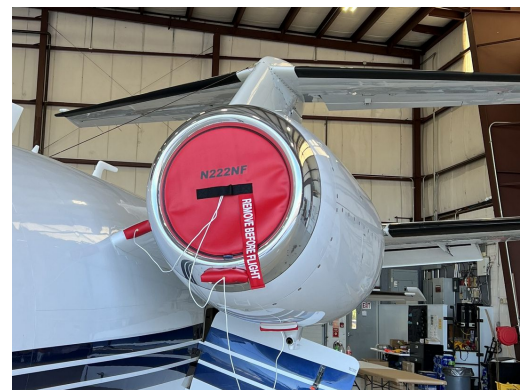
Cessna Citationjet 525A Intake Plugs Set