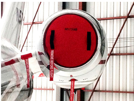
Citation CJ4 Intake Plugs pair

The Engine Inlet Plugs are custom fit for your Cessna Citationjet 525A, CJ-2, & CJ2+ intakes, made with heavy-duty vinyl material, and stuffed with a single block of sculpted urethane foam. Each plug has a zipper that allows the foam to be removed and dried if necessary. Engine plugs have 'remove before flight' streamers sewn onto the face of the plugs. Most plugs are imprinted with the aircraft registration number in black for an extra charge. Storage bag NOT included. Engine plugs may be inserted after flight when the engine is still warm. Engine Inlet Plugs are commonly referred to as Cowl Plugs, Intake Plugs, Cowl Blocks, Engine Blocks, and Engine Bungs.