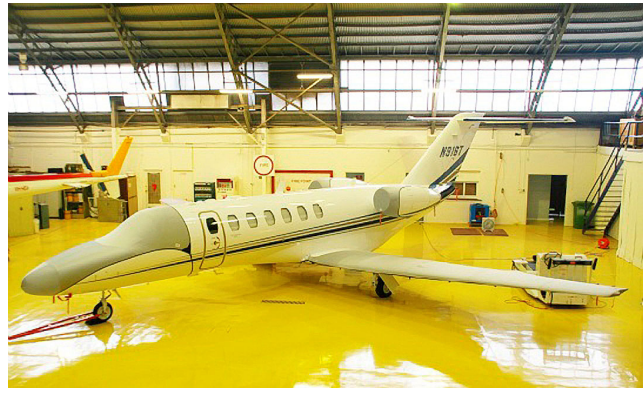
Cessna Citationjet CJ3 Cockpit/Nose, Engine & Wings Travel Covers