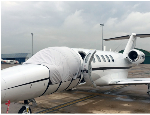
Cessna Citationjet 525A, CJ-2, & CJ2+ Cockpit Cover