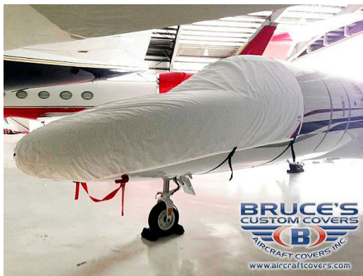
Citation CJ4 Cockpit/Nose Cover and Heat Resistant Pitot Covers set

Travel Covers are made with Silver Solution-Dyed Polyester fabric and only lined over the windshield to save weight. The material is lightweight and more compact for easy stowage in the aircraft. The polyester material is water resistant, but only intended for occasional use outside. We also have an ultra lightweight material available for fitted hangar dust covers. For daily outdoor use, the non-travel Sunbrella Cover is the best choice.