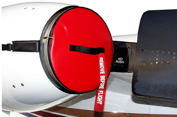
Engine Exhaust Plug

The Engine Inlet Plugs are custom fit for your Cessna Citationjet 525A, CJ-2, & CJ2+ intakes, made with heavy-duty vinyl material, and stuffed with a single block of sculpted urethane foam. Each plug has a zipper that allows the foam to be removed and dried if necessary. Engine plugs have 'remove before flight' streamers sewn onto the face of the plugs. Most plugs are imprinted with the aircraft registration number in black for an extra charge. Storage bag NOT included. Engine plugs may be inserted after flight when the engine is still warm. Engine Inlet Plugs are commonly referred to as Cowl Plugs, Intake Plugs, Cowl Blocks, Engine Blocks, and Engine Bungs.