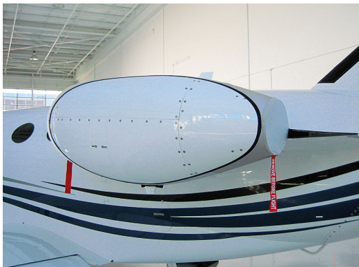
Cessna 510 Mustang Bikini Type Engine Cover

The Cessna Citationjet 525A, CJ-2, & CJ2+ Intake/Exhaust Plugs are custom fit for the intake and exhaust openings, made with heavy-duty vinyl material, and stuffed with a single block of sculpted urethane foam. Each plug has a zipper that allows the foam to be removed and dried if necessary. Engine plugs have 'remove before flight' streamers sewn onto the face of the plugs. Most plugs are imprinted with the aircraft registration number in black. Engine plugs may be inserted after flight when the engine is still warm. Engine Inlet Plugs are commonly referred to as Cowl Plugs, Intake Plugs, Cowl Blocks, Engine Blocks, and Engine Bungs.