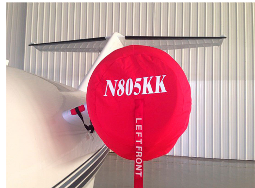
Cessna CJ1 Intake Cover and Inlet Plug