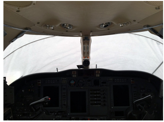
Cessna Citationjet Cockpit Cover