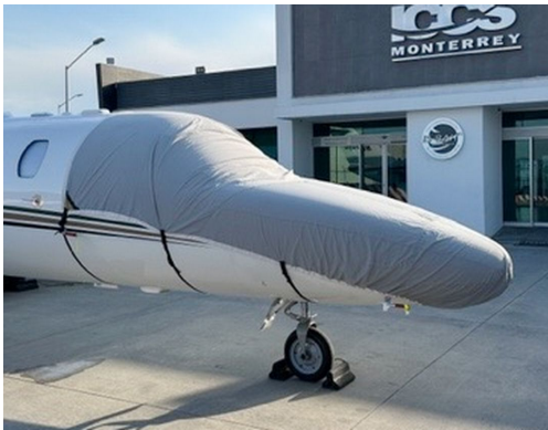
Citation CJ4 Cockpit/Nose Cover and Heat Resistant Pitot Covers set Cessna Citationjet 525B Travel Weight Cockpit/Nose Cover