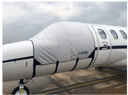
Cessna Citationjet 525A, CJ-2, & CJ2+ Cockpit Cover