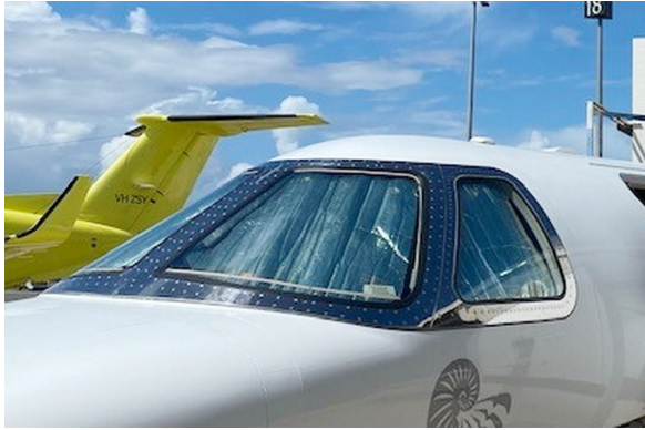
Cessna Citationjet CJ2 Cockpit HeatShields

Custom-made Heatshield Sunshades are available for almost any window in the jet. Side windows, Skylights, and Emergency Exits are all custom-made. The product is a unique composite of closed-cell foam with a silver mylar finish. The set is easily stored in the included storage sleeve. Some designs may require velcro and suction cups. Our Heatshields are offered white side out since aircraft manufacturers have issued advisories against reflective window inserts due to potential heat damage.