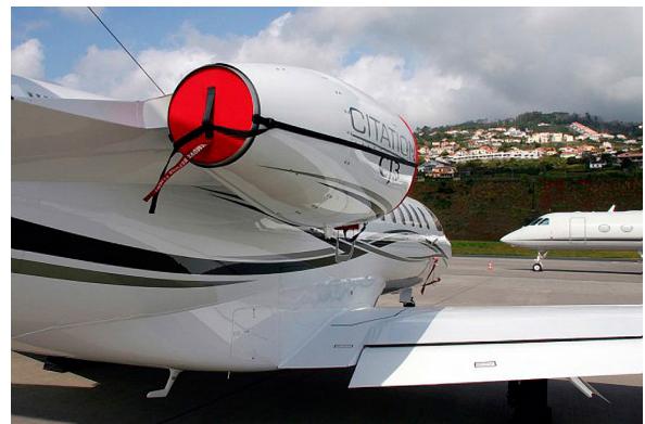
Citation CJ3 Exhaust Plug