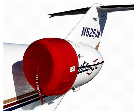
Engine Inlet Cover