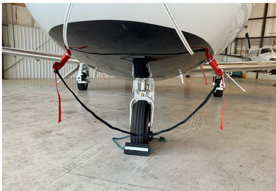
Cessna Citationjet CJ1 Pitot Cover Set

The Engine Inlet Plugs are custom fit for your Cessna Citationjet 525B, CJ-3 intakes, made with heavy-duty vinyl material, and stuffed with a single block of sculpted urethane foam. Each plug has a zipper that allows the foam to be removed and dried if necessary. Engine plugs have 'remove before flight' streamers sewn onto the face of the plugs. Most plugs are imprinted with the aircraft registration number in black for an extra charge. Storage bag NOT included. Engine plugs may be inserted after flight when the engine is still warm. Engine Inlet Plugs are commonly referred to as Cowl Plugs, Intake Plugs, Cowl Blocks, Engine Blocks, and Engine Bungs.