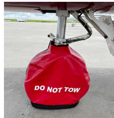
Citationjet CJ-3 Nose Gear Tire Cover