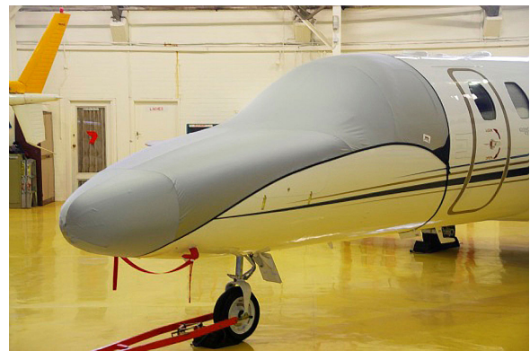
Citationjet CJ3 Cockpit/Nose Travel Cover