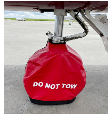
Citationjet CJ-3 Nose Gear Tire Cover