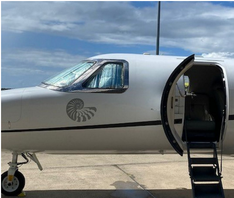
Cessna Citationjet CJ2 Cockpit HeatShields

Cockpit Heatshields are interior sunshades for the aircraft's cockpit. The product is a unique composite of closed-cell foam with a silver mylar finish. The semi-rigid design is stiff enough to stand inside the window framing. The set folds up flat and is easily stored in the included storage sleeve. Some designs may require velcro and suction cups. Our Heatshields for jets are offered white side out because some aircraft manufacturers have issued advisories against reflective window inserts due to potential heat damage. A Heatshield is an excellent short-term remedy for cockpit overheating, but an external fabric cover is more effective for long-term protection.