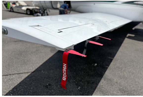
Cessna Citationjet 525C, CJ-4 Static Wick Protectors, 3 Per Wing, 1 On Tailcone Area