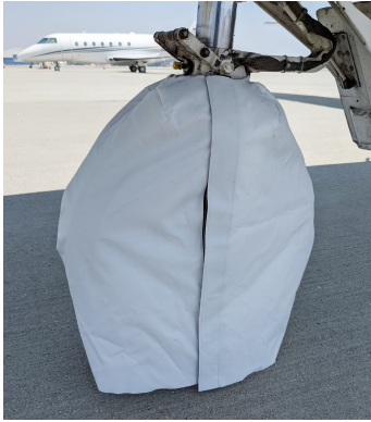
CJ1 Nose Gear Tire Cover, test fit

ALL-YEAR USE MATERIAL - Made with Silver Acrylic Sunbrella canvas, the all-year use material is the best option for sun protection and cover longevity. This heavier more durable material is intended for all weather conditions, such as rain and snow or lots of sun.