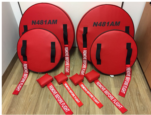
Citation CJ4 Complete Plug Set