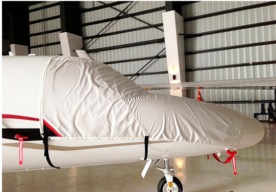
Citation CJ4 Cockpit/Nose Cover and Heat Resistant Pitot Covers set