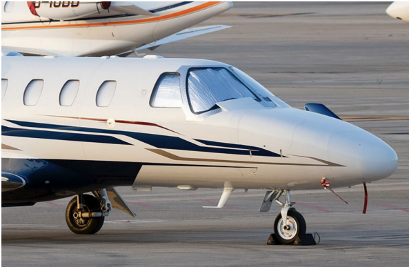
Cessna Citationjet 525, CJ-I, CJ1+, & M2 Cockpit Heatshields