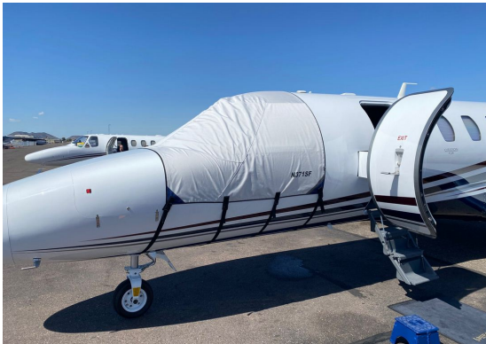
Citationjet 525C Cockpit Cover

This cover type is made from Silver Acrylic Sunbrella canvas and is 100% lined with a soft and smooth microfiber. Bruce's Custom Covers developed this material combination especially for aircraft protection. The outer material is medium weight and treated for water resistance, UV resistance and anti-static buildup. The inner lining is a very soft and smooth microfiber to prevent scratching. The material is very reflective, and tests show that the cabin interior temperature can be reduced to near-ambient temperature on the hottest of days. It is water, ice and snow repellent, yet breathable to allow moisture to escape from between the cover and the aircraft surface.