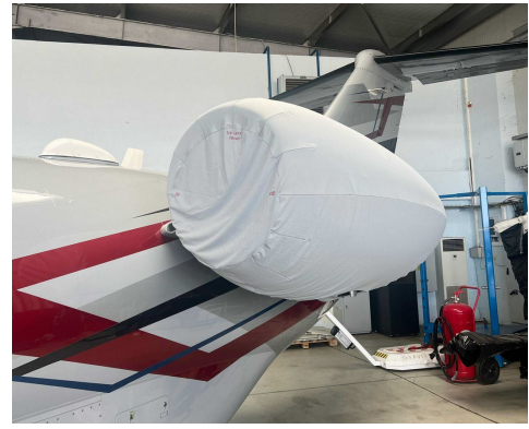
Citationjet 525C, CJ4, Complete Nacelle Cover, light weight Spandex