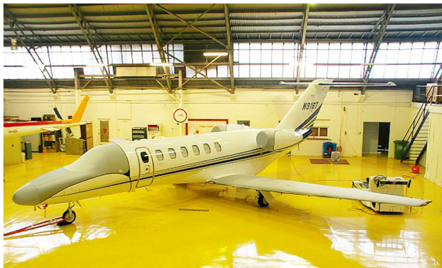
Cessna Citationjet CJ3 Cockpit/Nose, Engine & Wings Travel Covers

WINTER USE MATERIAL - Made with Solution-Dyed Polyester fabric, this option is intended for seasonal use to aid in deicing, rain mitigation, or for occasional travel. The material is lighter and more compact, but more susceptible to UV damage and may have a shorter useful life if used continuously outside than the all-year use material.