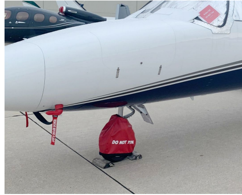
Cessna Citation Nose Tire Cover