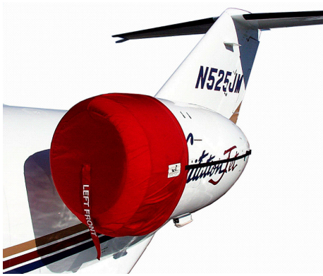
Engine Inlet Cover