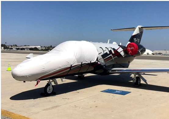
Citationjet CJ1 Cockpit/Nose Cover