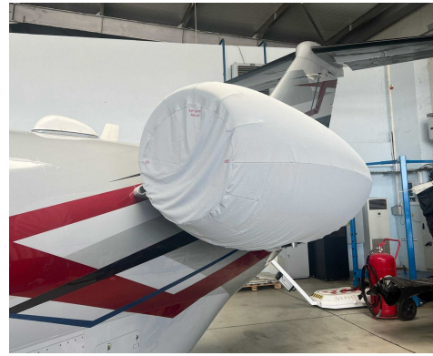
Citationjet 525C, CJ4, Complete Nacelle Cover, light weight Spandex