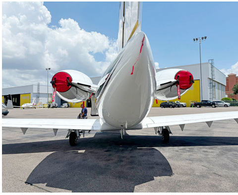
Cessna Citationjet 525C, CJ-4 Engine Inlet Covers & Exhaust Plugs