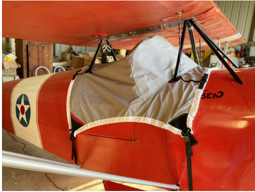
Corben Junior Ace Travel Weight Canopy Cover