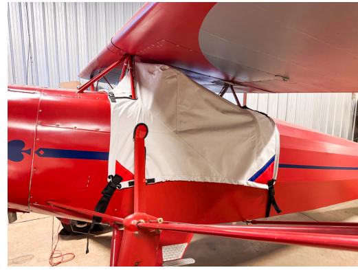
Corben Baby Ace, Junior Ace, and similar models Cockpit Cover