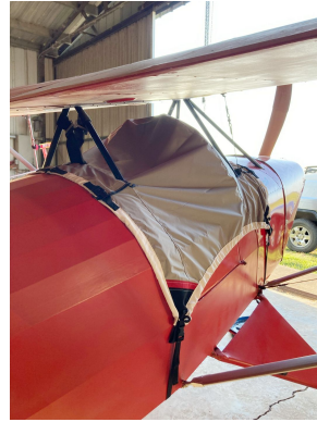
Corben Junior Ace Travel Weight Canopy Cover