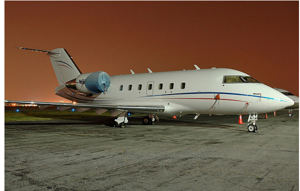
Challenger 601 Intake Covers, standard design