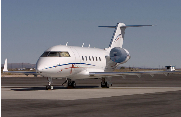
Challenger 604 Intake Covers, standard design

The Canadair Regional Jet 200, 700 Bikini Style Engine Covers are a single-piece design using a soft and smooth stretchy and fabric. The cover stretches tightly over both the intake and exhaust, installing quickly and easily. These covers are designed to be used as hangar dust covers and have a useful life of approximately one year.