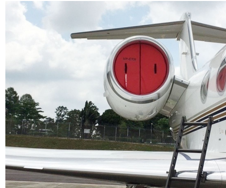
Grumman Gulfstream G450 Intake Plugs