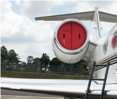
Grumman Gulfstream G450 Intake Plugs

The Engine Inlet Plugs are custom fit for your Canadair Regional Jet 200, 700 intakes, made with heavy-duty vinyl material, and stuffed with a single block of sculpted urethane foam. Each plug has a zipper that allows the foam to be removed and dried if necessary. Engine plugs have 'remove before flight' streamers sewn onto the face of the plugs. Most plugs are imprinted with the aircraft registration number in black for an extra charge. Storage bag NOT included. Engine plugs may be inserted after flight when the engine is still warm. Engine Inlet Plugs are commonly referred to as Cowl Plugs, Intake Plugs, Cowl Blocks, Engine Blocks, and Engine Bunges.