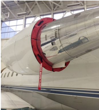
Canadair Challenger 604 Bypass Plugs

The Engine Inlet Plugs are custom fit for your Canadair Regional Jet 200, 700 intakes, made with heavy-duty vinyl material, and stuffed with a single block of sculpted urethane foam. Each plug has a zipper that allows the foam to be removed and dried if necessary. Engine plugs have 'remove before flight' streamers sewn onto the face of the plugs. Most plugs are imprinted with the aircraft registration number in black for an extra charge. Storage bag NOT included. Engine plugs may be inserted after flight when the engine is still warm. Engine Inlet Plugs are commonly referred to as Cowl Plugs, Intake Plugs, Cowl Blocks, Engine Blocks, and Engine Bungs.