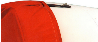
Alternate Intake Cover Design