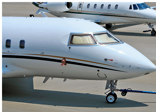
Challenger 604 Cockpit HeatShields

Cockpit Heatshields are interior sunshades for the aircraft's cockpit. The product is a unique composite of closed-cell foam with a silver mylar finish. The semi-rigid design is stiff enough to stand inside the window framing. The set folds up flat and is easily stored in the included storage sleeve. Some designs may require velcro and suction cups. Our Heatshields for jets are offered white side out because some aircraft manufacturers have issued advisories against reflective window inserts due to potential heat damage. A Heatshield is an excellent short-term remedy for cockpit overheating, but an external fabric cover is more effective for long-term protection.