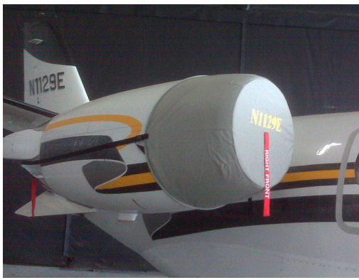
Citation XLS Engine Cover set