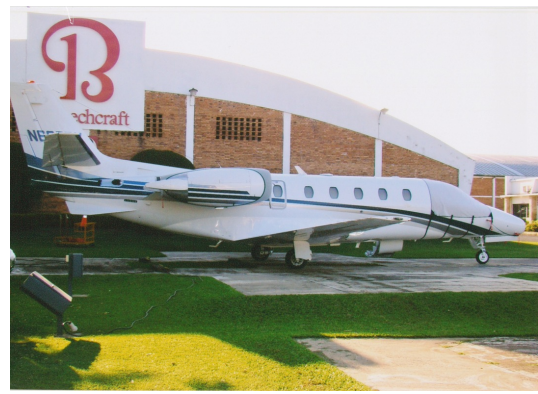
Citation XL Cockpit Cover & Bikini Type Engine Cover