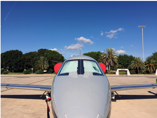
Cessna Citation XL, XLS (560XL) Cockpit Heatshields