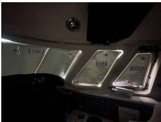
Cessna Citation 560XL Cockpit Heatshields

Cockpit Heatshields are interior sunshades for the aircraft's cockpit. The product is a unique composite of closed-cell foam with a silver mylar finish. The semi-rigid design is stiff enough to stand inside the window framing. The set folds up flat and is easily stored in the included storage sleeve. Some designs may require velcro and suction cups. Our Heatshields for jets are offered white side out because some aircraft manufacturers have issued advisories against reflective window inserts due to potential heat damage. A Heatshield is an excellent short-term remedy for cockpit overheating, but an external fabric cover is more effective for long-term protection.