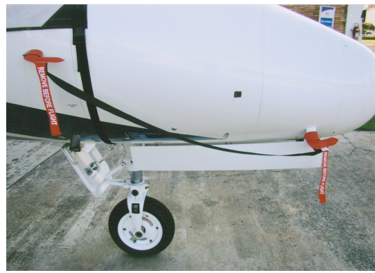
Citation XL Pitot Covers