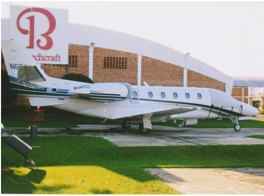
Citation XL Cockpit Cover & Bikini Type Engine Cover