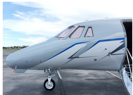
Cessna Citation XL, XLS (560XL) Cockpit Heatshields