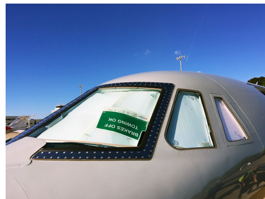
Cessna Citation XL, XLS (560XL) Cockpit Heatshields