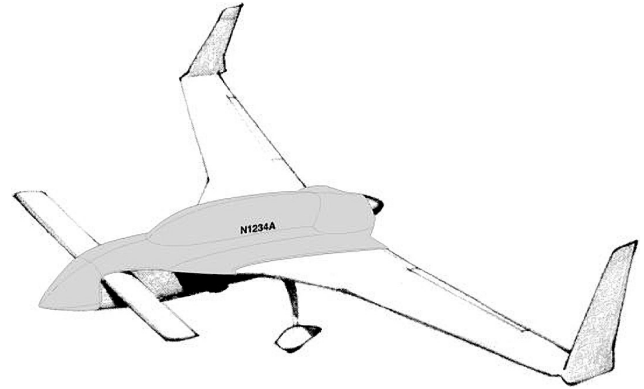
Rutan Long-EZ Canopy Cover