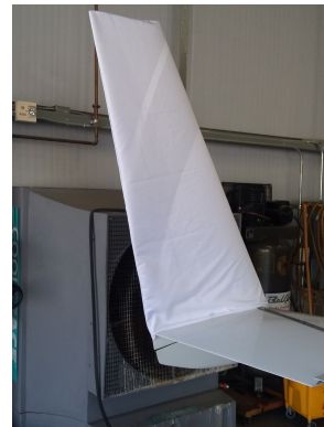
Velocity Vertical Stabilizer Covers, test fit cover