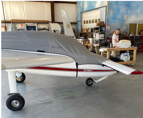
Cozy Mk IV Canopy/Nose/Engine Cover, travel weight design

Travel Covers are made with Silver Solution-Dyed Polyester fabric and only lined over the windshield to save weight. The material is lightweight and more compact for easy stowage in the aircraft. The polyester material is water resistant, but only intended for occasional use outside. We also have an ultra lightweight material available for fitted hangar dust covers. For daily outdoor use, the non-travel Sunbrella Cover is the best choice.