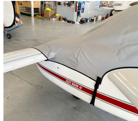
Cozy Mk IV Canopy/Nose/Engine Cover, travel weight design