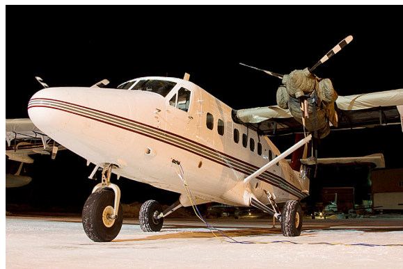
Twin Otter Wing, Horiz. Stab & Engine Covers