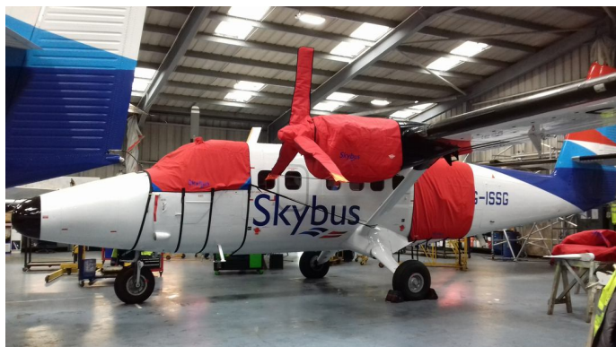
DeHavilland Twin Otter DHC6 (UV-18A) Cockpit Cover (CUSTOM COLOR)

Engine Covers will cinch around or behind the spinner, cover the entire engine cowl area including the engine air cooling and induction air inlets, and fastens together with Velcro beneath the spinner down the front of the cowling. The Engine Cover is attached with a belly strap aft of the firewall, and can Velcro to the Canopy Cover. Engine Covers are normally made from Solution-Dyed Polyester or Acrylic Sunbrella . An Insulated version of the engine cover can be made with a thicker, quilted, and water-repellent material. The Insulated Engine Cover works well in cold climates to help with engine preheating.