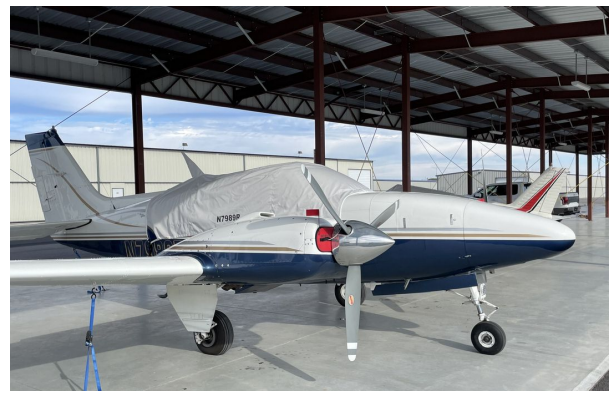
Beech Baron D55 Canopy Cover, Engine Plugs