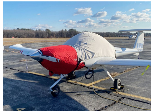
Diamond DA20-C1 Insulated Engine Cover, C1 models