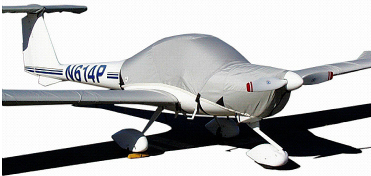
Diamond DA-20 Canopy/Engine, Wing & Horiz. Stab. Covers

This cover type is made from Silver Acrylic Sunbrella canvas and is 100% lined with a soft and smooth microfiber. Bruce's Custom Covers developed this material combination especially for aircraft protection. The outer material is medium weight and treated for water resistance, UV resistance and anti-static buildup. The inner lining is a very soft and smooth microfiber to prevent scratching. The material is very reflective, and tests show that the cabin interior temperature can be reduced to near-ambient temperature on the hottest of days. It is water, ice and snow repellent, yet breathable to allow moisture to escape from between the cover and the aircraft surface.