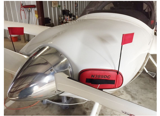
Diamond DA-20-C1 Engine Inlet Plugs