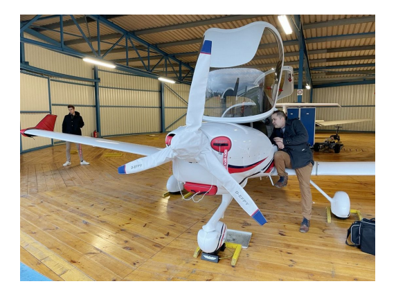
DA40 NG Engine Plugs