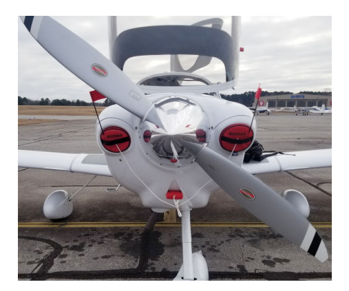
Diamond DA-40 Engine Inlet Plugs

Engine Inlet Plugs are custom fit for your Diamond DA-40 intakes, made with heavy-duty vinyl material, and stuffed with a single block of sculpted urethane foam. Each plug has a zipper that allows the foam to be removed and dried if necessary. Engine plugs have warning flags that are visible from the cockpit or 'remove before flight' streamers sewn onto the face of the plugs. Most plugs are imprinted with the aircraft registration number in black for an extra charge. Storage bag NOT included. Engine plugs may be inserted after flight when the engine is still warm. Engine Inlet Plugs are commonly referred to as Cowl Plugs, Intake Plugs, Cowl Blocks, Engine Blocks, and Engine Bungs.