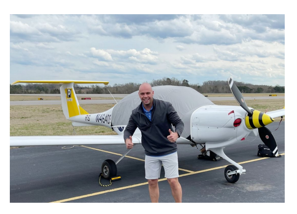
Diamond DA-40 Light Weight Travel Cover

Diamond DA40 Canopy, Insulated Engine, Wing and Stab. Covers