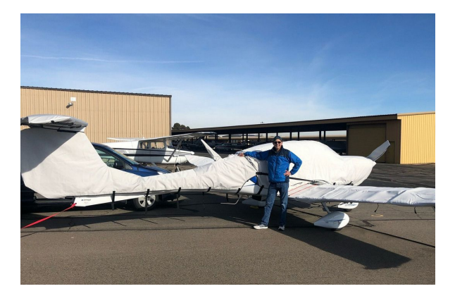
Diamond DA-40 Wing Covers All Year Use with Hail Protection

This cover type is made from Silver Acrylic Sunbrella canvas and is 100% lined with a soft and smooth microfiber. Bruce's Custom Covers developed this material combination especially for aircraft protection. The outer material is medium weight and treated for water resistance, UV resistance and anti-static buildup. The inner lining is a very soft and smooth microfiber to prevent scratching. The material is very reflective, and tests show that the cabin interior temperature can be reduced to near-ambient temperature on the hottest of days. It is water, ice and snow repellent, yet breathable to allow moisture to escape from between the cover and the aircraft surface.