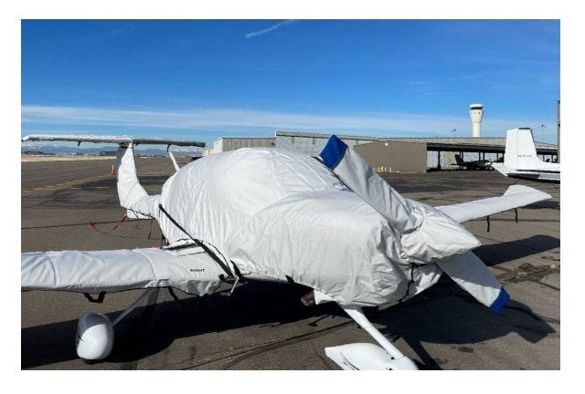
Diamond DA-40 Full Cover Set