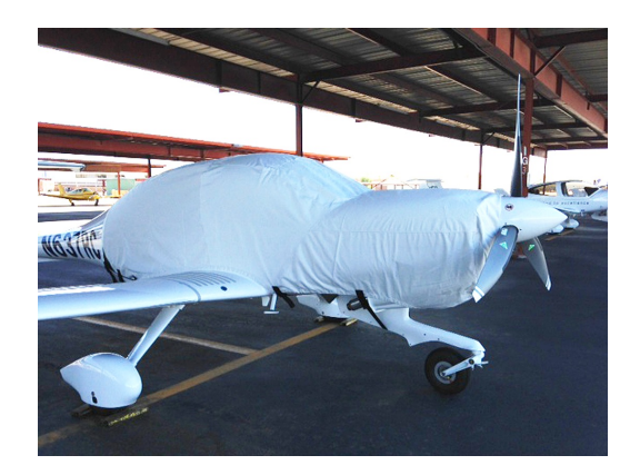
Diamond DA-40NG Extended Canopy/Engine Cover

This cover type is made from Silver Acrylic Sunbrella canvas and is 100% lined with a soft and smooth microfiber. Bruce's Custom Covers developed this material combination especially for aircraft protection. The outer material is medium weight and treated for water resistance, UV resistance and anti-static buildup. The inner lining is a very soft and smooth microfiber to prevent scratching. The material is very reflective, and tests show that the cabin interior temperature can be reduced to near-ambient temperature on the hottest of days. It is water, ice and snow repellent, yet breathable to allow moisture to escape from between the cover and the aircraft surface.