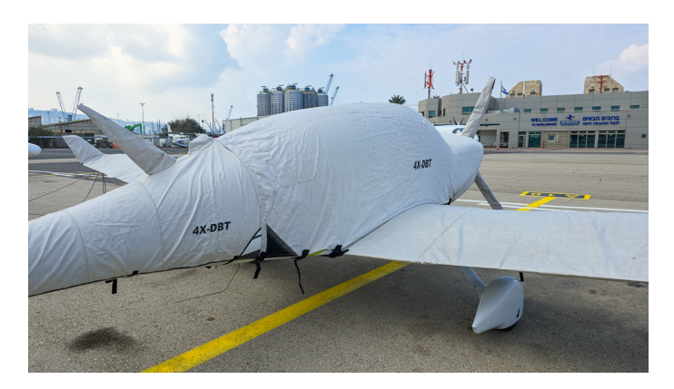
Diamond DA-40 Complete Cover Set