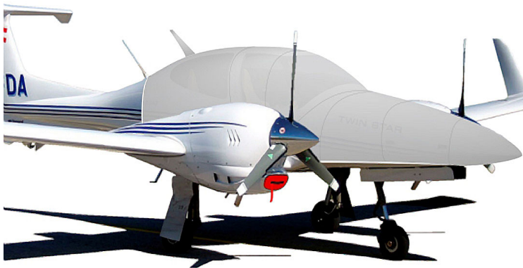
Twinstar Extended Canopy/Nose Cover & Engine Plugs (Illustration)

Engine Inlet Plugs are custom fit for your Diamond DA-42 Twin Star intakes, made with heavy-duty vinyl material, and stuffed with a single block of sculpted urethane foam. Each plug has a zipper that allows the foam to be removed and dried if necessary. Engine plugs have warning flags that are visible from the cockpit or 'remove before flight' streamers sewn onto the face of the plugs. Most plugs are imprinted with the aircraft registration number in black for an extra charge. Storage bag NOT included. Engine plugs may be inserted after flight when the engine is still warm. Engine Inlet Plugs are commonly referred to as Cowl Plugs, Intake Plugs, Cowl Blocks, Engine Blocks, and Engine Bungs.