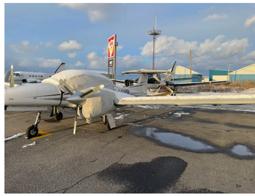
Diamond DA-42 Canopy, Wing, Engine & Horizontal Stabilizer Covers