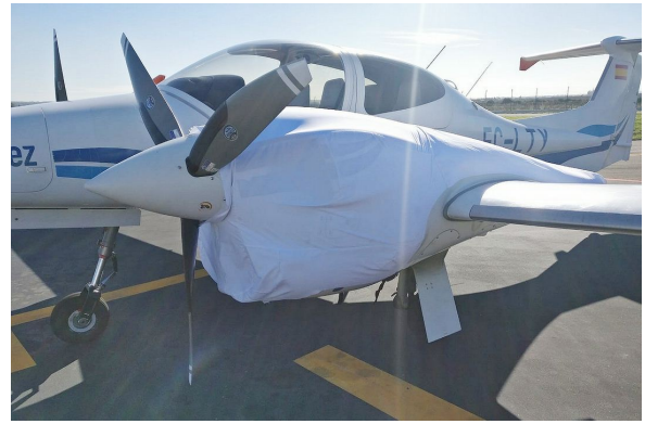
DA42 MPP Guardian (DA42-NG) Engine Cover, test fit cover