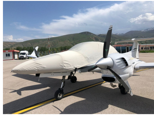
Diamond DA-42 Canopy/Nose Cover