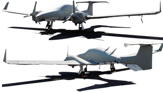
DA-42 Full Cover Set: Extended Canopy/Nose, Wing/Engine, Prop, Empennage

WINTER USE MATERIAL - Made with Solution-Dyed Polyester fabric, this option is intended for seasonal use to aid in deicing, rain mitigation, or for occasional travel. The material is lighter and more compact, but more susceptible to UV damage and may have a shorter useful life if used continuously outside than the all-year use material.