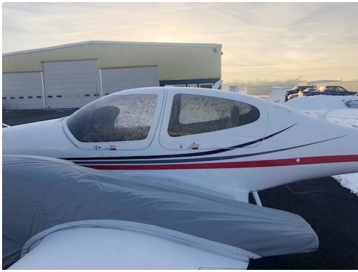
Diamond DA-42 Light Weight Travel Engine Covers