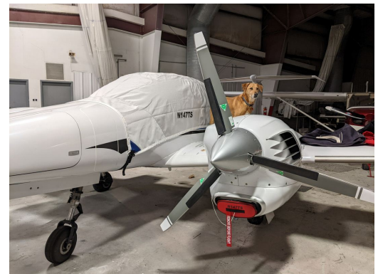
Diamond DA-42 NG Canopy Cover, Engine Plugs