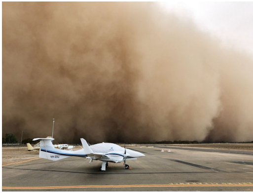
Diamond DA-42 Canopy/Nose Cover