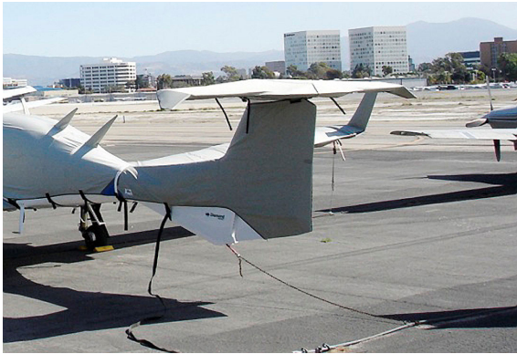
DA-42 Empennage & Horiz. Stab. Covers