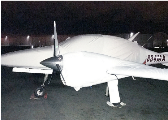
Diamond DA-42 Twin Star Wing & Engine Covers

WINTER USE MATERIAL - Made with Solution-Dyed Polyester fabric, this option is intended for seasonal use to aid in deicing, rain mitigation, or for occasional travel. The material is lighter and more compact, but more susceptible to UV damage and may have a shorter useful life if used continuously outside than the all-year use material.