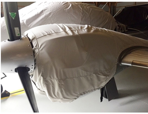
Diamond DA42-VI Canopy/Nose Cover