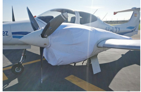
DA42 MPP Guardian (DA42-NG) Engine Cover, test fit cover