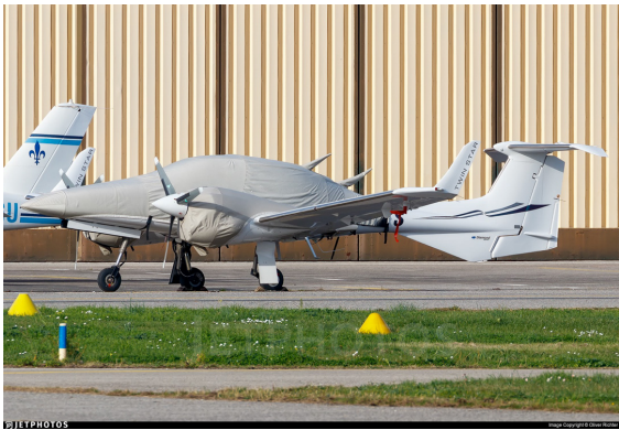
Diamond DA-42 Extended Canopy/Nose Cover, Engine Covers