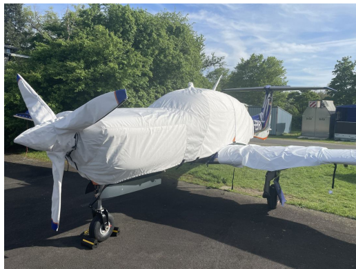
Diamond DA-50 Extended Canopy/Engine, Prop & Wing Covers (test fit)

WINTER USE MATERIAL - Made with Solution-Dyed Polyester fabric, this option is intended for seasonal use to aid in deicing, rain mitigation, or for occasional travel. The material is lighter and more compact, but more susceptible to UV damage and may have a shorter useful life if used continuously outside than the all-year use material.