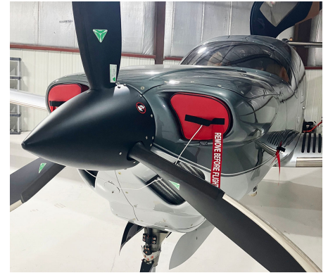
Diamond DA-50 Superstar Engine Inlet Plugs