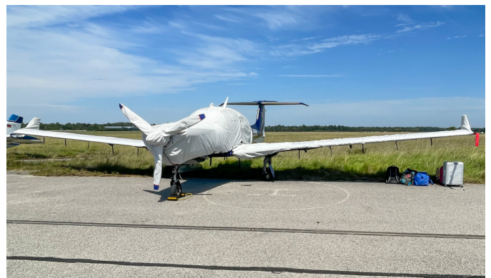
Diamond DA-50 Extended Canopy/Engine Cover, Wing & Prop Covers