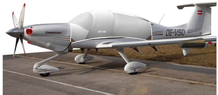
Covers, Plugs & HeatShields for Diamond DA-50