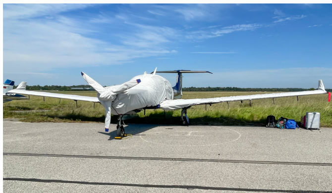
Diamond DA-50 Extended Canopy/Engine Cover, Wing & Prop Covers