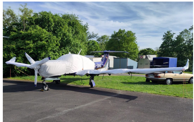
Diamond DA-50 Extended Canopy/Engine, Prop & Wing Covers (test fit)