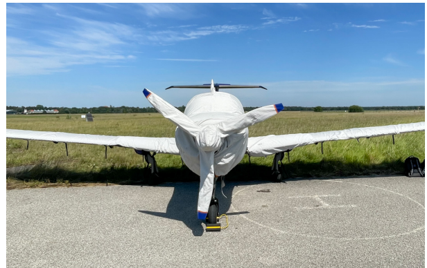
Diamond DA-50 Extended Canopy/Engine Cover, Wing & Prop Covers