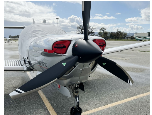
Diamond DA-50 Engine Plugs