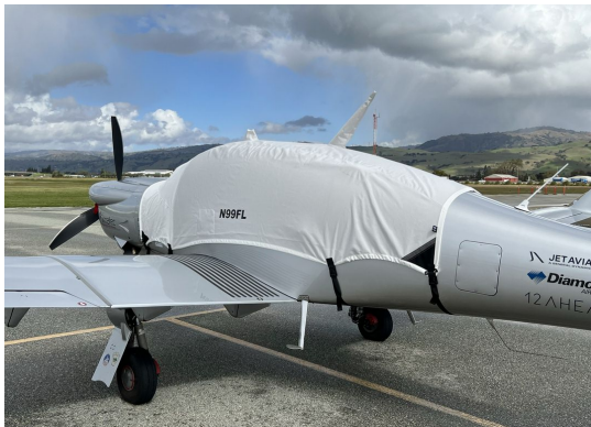
Diamond DA-50 Canopy Cover

This cover type is made from Silver Acrylic Sunbrella canvas and is 100% lined with a soft and smooth microfiber. Bruce's Custom Covers developed this material combination especially for aircraft protection. The outer material is medium weight and treated for water resistance, UV resistance and anti-static buildup. The inner lining is a very soft and smooth microfiber to prevent scratching. The material is very reflective, and tests show that the cabin interior temperature can be reduced to near-ambient temperature on the hottest of days. It is water, ice and snow repellent, yet breathable to allow moisture to escape from between the cover and the aircraft surface.