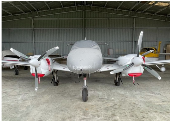
DA-62 Travel Weight Canopy/Nose Cover, Engine Plugs

Engine Inlet Plugs are custom fit for your Diamond DA-62 intakes, made with heavy-duty vinyl material, and stuffed with a single block of sculpted urethane foam. Each plug has a zipper that allows the foam to be removed and dried if necessary. Engine plugs have warning flags that are visible from the cockpit or 'remove before flight' streamers sewn onto the face of the plugs. Most plugs are imprinted with the aircraft registration number in black for an extra charge. Storage bag NOT included. Engine plugs may be inserted after flight when the engine is still warm. Engine Inlet Plugs are commonly referred to as Cowl Plugs, Intake Plugs, Cowl Blocks, Engine Blocks, and Engine Bungs.