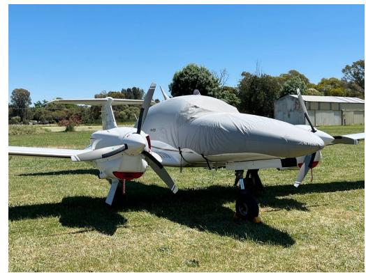
Diamond DA-62 Travel Weight Canopy/Nose Cover