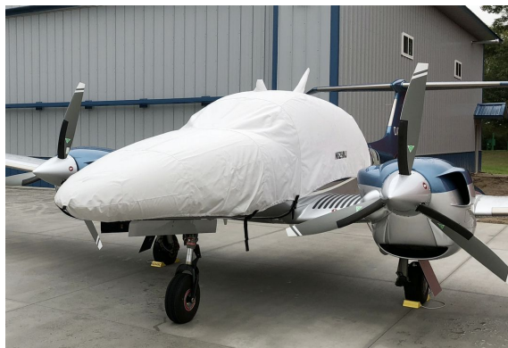
Diamond DA-62 Canopy/Nose Cover