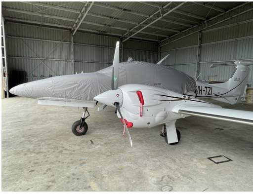
DA-62 Travel Weight Canopy/Nose Cover, Engine Plugs