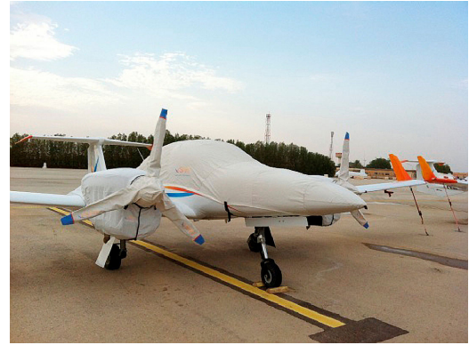
Diamond DA-42NG Canopy/Nose, Engine & Prop Covers