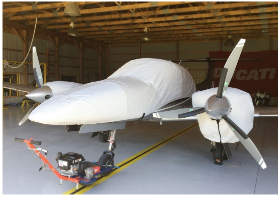
Diamond DA-42-VI Canopy/Nose & Engine Covers