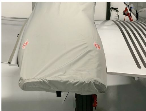
Diamond DA-62 Travel Weight Canopy & Engine Covers