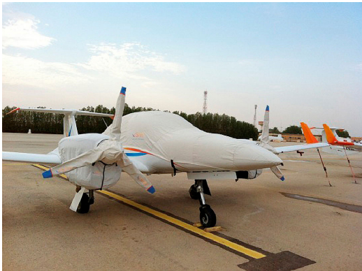
Diamond DA-42NG Canopy/Nose, Engine & Prop Covers