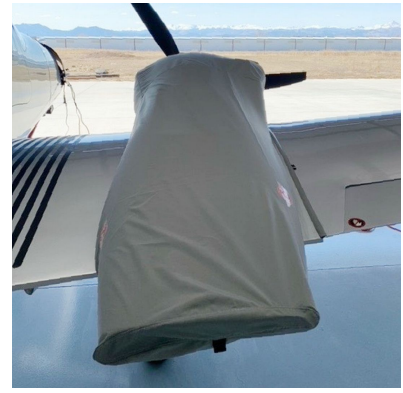
Diamond DA-62 Travel Weight Engine Covers