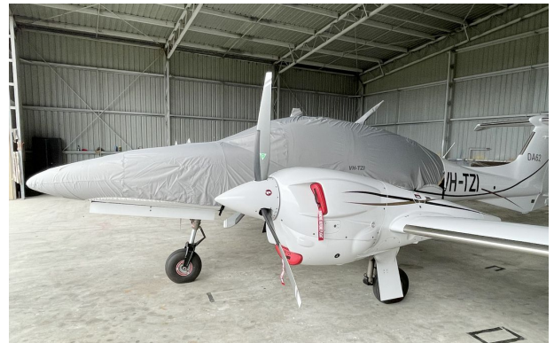
Diamond DA-62 Canopy/Nose Cover, Engine Plugs