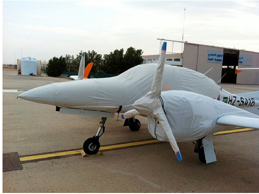
Diamond DA-42NG Canopy/Nose, Engine & Prop Covers