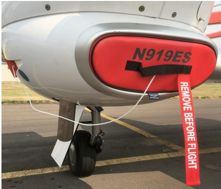
Diamond Da-42 Engine Inlet Plugs Set of 4