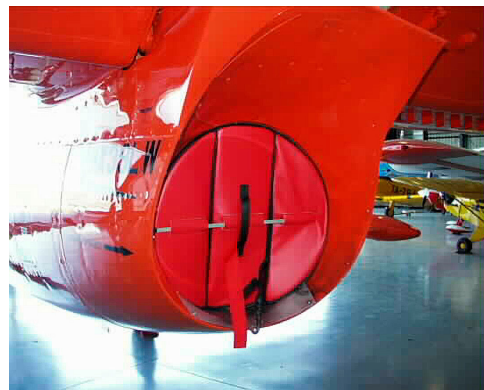
Exhaust Plug, folding type