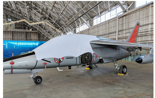
Dornier Alpha Jet Canopy Cover, test fit cover