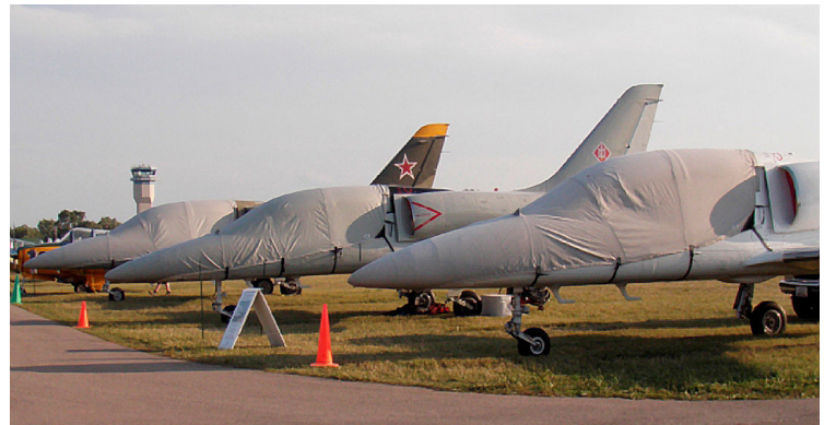
L-39 Canopy/Nose Covers & Plugs