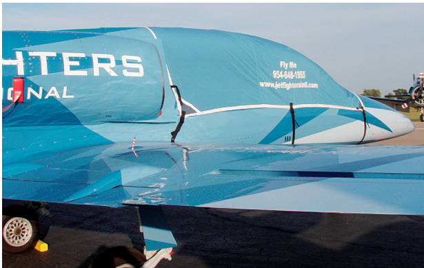
L-39 Canopy Cover & Plugs

This cover type is made from Silver Acrylic Sunbrella canvas and is 100% lined with a soft and smooth microfiber. Bruce's Custom Covers developed this material combination especially for aircraft protection. The outer material is medium weight and treated for water resistance, UV resistance and anti-static buildup. The inner lining is a very soft and smooth microfiber to prevent scratching. The material is very reflective, and tests show that the cabin interior temperature can be reduced to near-ambient temperature on the hottest of days. It is water, ice and snow repellent, yet breathable to allow moisture to escape from between the cover and the aircraft surface.