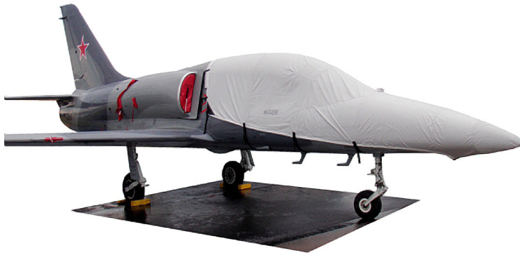
L-39 Canopy/Nose Cover & Plugs

This cover type is made from Silver Acrylic Sunbrella canvas and is 100% lined with a soft and smooth microfiber. Bruce's Custom Covers developed this material combination especially for aircraft protection. The outer material is medium weight and treated for water resistance, UV resistance and anti-static buildup. The inner lining is a very soft and smooth microfiber to prevent scratching. The material is very reflective, and tests show that the cabin interior temperature can be reduced to near-ambient temperature on the hottest of days. It is water, ice and snow repellent, yet breathable to allow moisture to escape from between the cover and the aircraft surface.