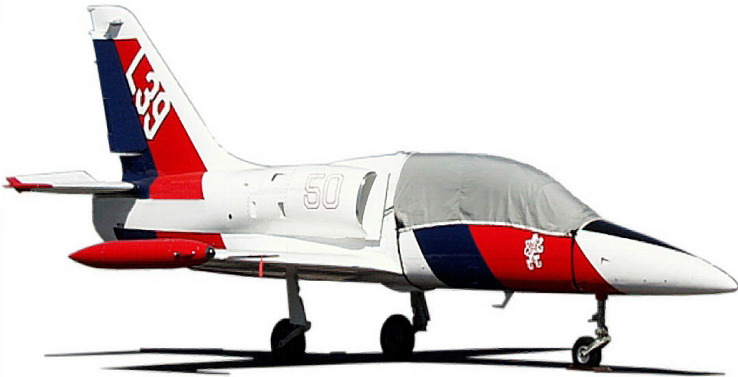
Canopy Cover for Aero L-39 Albatros