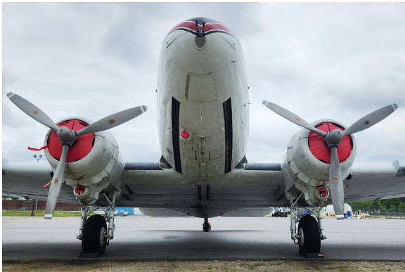
Douglas DC-3 Engine Inlet Plugs

Engine Inlet Plugs are custom fit for your Douglas DC-3 intakes, made with heavy-duty vinyl material, and stuffed with a single block of sculpted urethane foam. Each plug has a zipper that allows the foam to be removed and dried if necessary. Engine plugs have warning flags that are visible from the cockpit or 'remove before flight' streamers sewn onto the face of the plugs. Most plugs are imprinted with the aircraft registration number in black for an extra charge. Storage bag NOT included. Engine plugs may be inserted after flight when the engine is still warm. Engine Inlet Plugs are commonly referred to as Cowl Plugs, Intake Plugs, Cowl Blocks, Engine Blocks, and Engine Bungs.