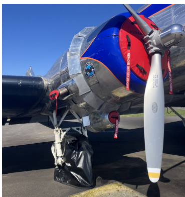
DC-3 Engine Plugs, Tire Covers