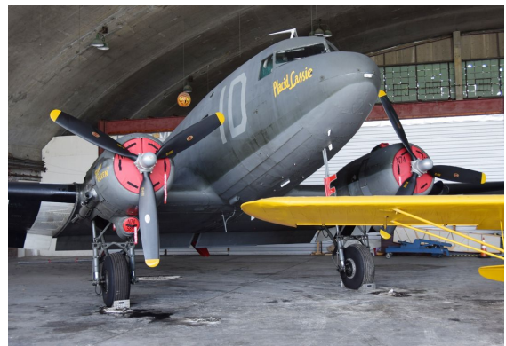
Douglas DC-3 Engine & Oil Cooler Plugs