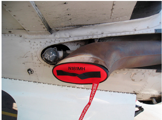
Beech 18 Exhaust Plugs