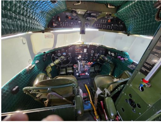
DC-3C Cockpit Heatshields

Cockpit Heatshields are interior sunshades for the aircraft's cockpit. The product is a unique composite of closed-cell foam with a silver mylar finish. The semi-rigid design is stiff enough to stand inside the window framing. The set folds up flat and is easily stored in the included storage sleeve. Some designs may require velcro and suction cups. A Heatshield is an excellent short-term remedy for cockpit overheating, but an external fabric cover is more effective for long-term protection.