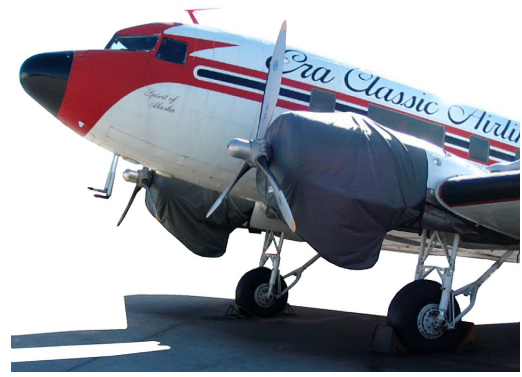
Engine Covers are available in either standard or insulated designs.