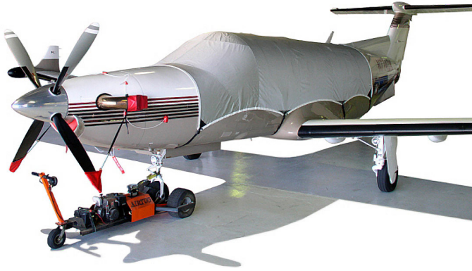
PC-12 Canopy Cover, Engine Plugs, Prop Tie/Exhaust Covers

Engine Inlet Plugs are custom fit for your Beech Denali 220 intakes, made with heavy-duty vinyl material, and stuffed with a single block of sculpted urethane foam. Each plug has a zipper that allows the foam to be removed and dried if necessary. Engine plugs have warning flags that are visible from the cockpit or 'remove before flight' streamers sewn onto the face of the plugs. Most plugs are imprinted with the aircraft registration number in black for an extra charge. Storage bag NOT included. Engine plugs may be inserted after flight when the engine is still warm. Engine Inlet Plugs are commonly referred to as Cowl Plugs, Intake Plugs, Cowl Blocks, Engine Blocks, and Engine Bungs.