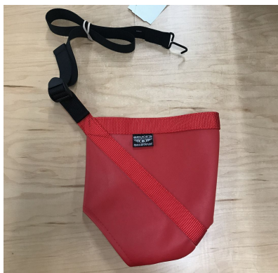
Prop Tie-Down, Various Models (secures with a hook to engine nacelle)

This cover type is made from Silver Acrylic Sunbrella canvas and is 100% lined with a soft and smooth microfiber. Bruce's Custom Covers developed this material combination especially for aircraft protection. The outer material is medium weight and treated for water resistance, UV resistance and anti-static buildup. The inner lining is a very soft and smooth microfiber to prevent scratching. The material is very reflective, and tests show that the cabin interior temperature can be reduced to near-ambient temperature on the hottest of days. It is water, ice and snow repellent, yet breathable to allow moisture to escape from between the cover and the aircraft surface.