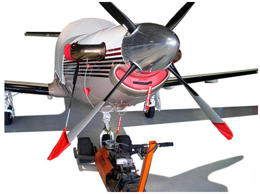
Pilatus PC-12 LARGE ENGINE INLET PLUG, SMALL PLUGS SET, Prop Tie/Exhaust Covers