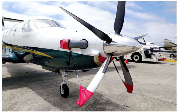
Main Intake Plug and Prop-Tie/Exhaust Covers. (Sold Separately)