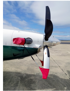
Prop Tie-Down, Various Models (secures with a hook to engine nacelle) Pilatus PC-12 Prop Tie-Down/Exhaust Cover Set, 5 Blade