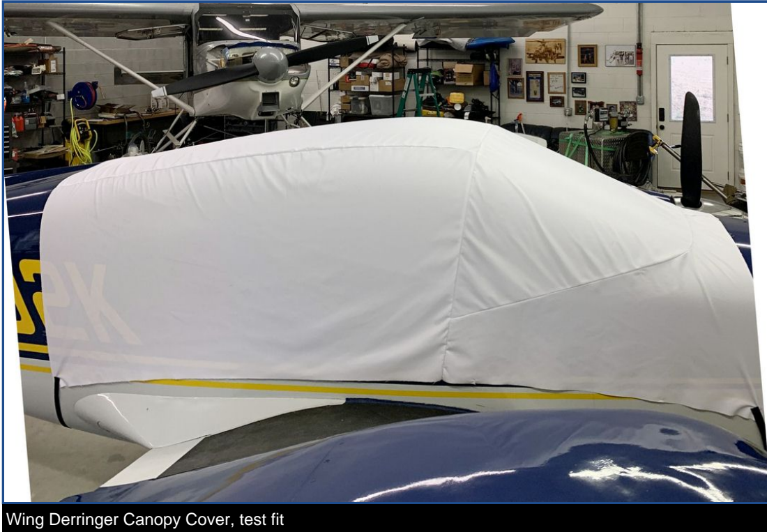
Wing Derringer Canopy Cover, test fit