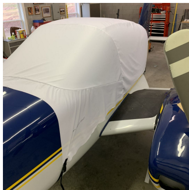
Wing Derringer Canopy Cover, test fit

This cover type is made from Silver Acrylic Sunbrella canvas and is 100% lined with a soft and smooth microfiber. Bruce's Custom Covers developed this material combination especially for aircraft protection. The outer material is medium weight and treated for water resistance, UV resistance and anti-static buildup. The inner lining is a very soft and smooth microfiber to prevent scratching. The material is very reflective, and tests show that the cabin interior temperature can be reduced to near-ambient temperature on the hottest of days. It is water, ice and snow repellent, yet breathable to allow moisture to escape from between the cover and the aircraft surface.