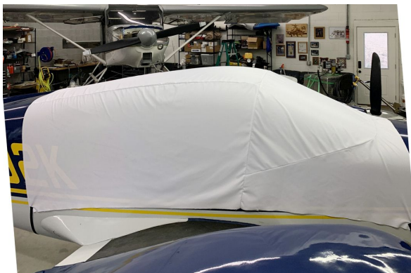
Wing Derringer Canopy Cover, test fit