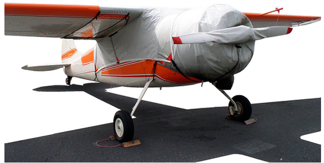
Cessna 195 Over-Top Canopy, Engine & Prop Covers