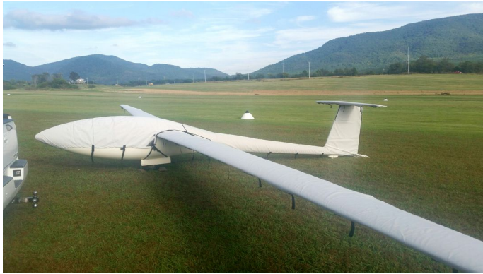
Glaser Dirks DG-300 Complete Cover Set