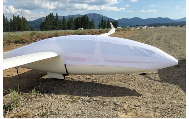
DG-1000 Canopy/Nose Cover, test fit cover