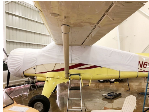
De Havilland Beaver Canopy/Engine Cover, test fit cover