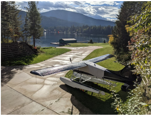
Beaver DHC2 MK1 Canopy/Engine Cover

This cover type is made from Silver Acrylic Sunbrella canvas and is 100% lined with a soft and smooth microfiber. Bruce's Custom Covers developed this material combination especially for aircraft protection. The outer material is medium weight and treated for water resistance, UV resistance and anti-static buildup. The inner lining is a very soft and smooth microfiber to prevent scratching. The material is very reflective, and tests show that the cabin interior temperature can be reduced to near-ambient temperature on the hottest of days. It is water, ice and snow repellent, yet breathable to allow moisture to escape from between the cover and the aircraft surface.