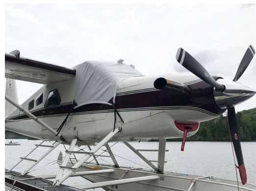
DeHavilland Turbo Beaver Cockpit Cover and Inlet Plug