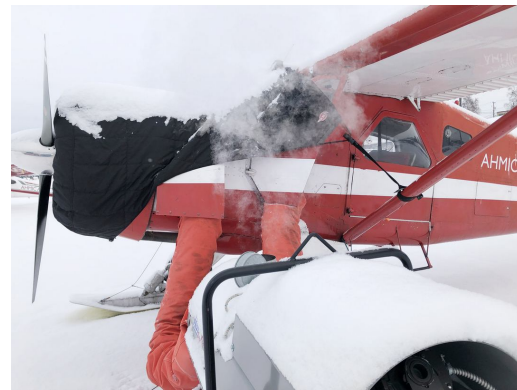
DeHavilland DH-2 Beaver Insulated Engine Cover