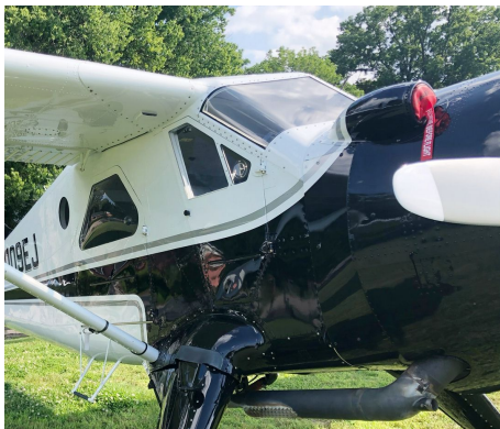
DeHavilland DH-2 Upper Cowling Air Scoop Plug

Engine Inlet Plugs are custom fit for your DeHavilland Beaver DHC-2, U-6A, U-6B intakes, made with heavy-duty vinyl material, and stuffed with a single block of sculpted urethane foam. Each plug has a zipper that allows the foam to be removed and dried if necessary. Engine plugs have warning flags that are visible from the cockpit or 'remove before flight' streamers sewn onto the face of the plugs. Most plugs are imprinted with the aircraft registration number in black for an extra charge. Storage bag NOT included. Engine plugs may be inserted after flight when the engine is still warm. Engine Inlet Plugs are commonly referred to as Cowl Plugs, Intake Plugs, Cowl Blocks, Engine Blocks, and Engine Bungs.