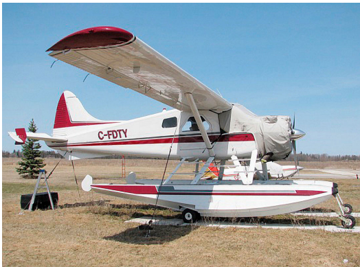
Beaver Windshield/Engine Cover

Travel Covers are made with Silver Solution-Dyed Polyester fabric and only lined over the windshield to save weight. The material is lightweight and more compact for easy stowage in the aircraft. The polyester material is water resistant, but only intended for occasional use outside. We also have an ultra lightweight material available for fitted hangar dust covers. For daily outdoor use, the non-travel Sunbrella Cover is the best choice.