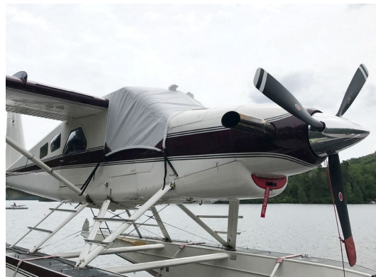
DeHavilland Turbo Beaver Cockpit Cover and Inlet Plug