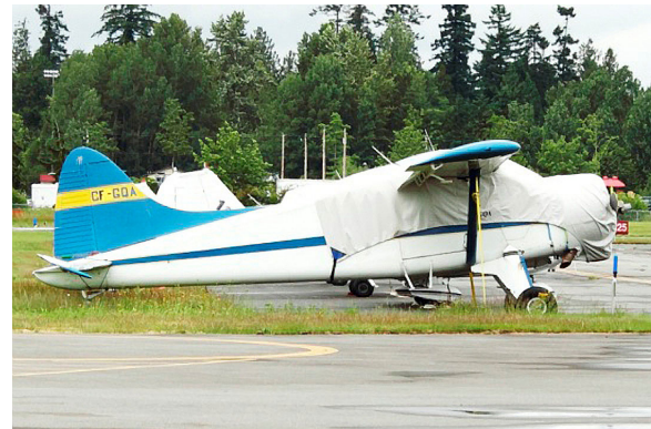
Beaver Canopy/Engine Cover