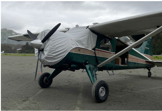
DeHavilland DH-2 Beaver Cockpit/Engine Cover

This cover type is made from Silver Acrylic Sunbrella canvas and is 100% lined with a soft and smooth microfiber. Bruce's Custom Covers developed this material combination especially for aircraft protection. The outer material is medium weight and treated for water resistance, UV resistance and anti-static buildup. The inner lining is a very soft and smooth microfiber to prevent scratching. The material is very reflective, and tests show that the cabin interior temperature can be reduced to near-ambient temperature on the hottest of days. It is water, ice and snow repellent, yet breathable to allow moisture to escape from between the cover and the aircraft surface.