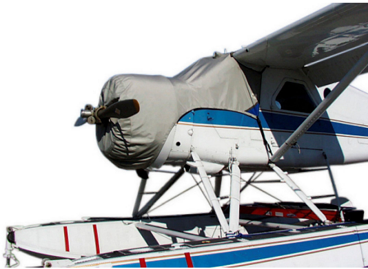
Beaver Windshield/Engine Cover

Travel Covers are made with Silver Solution-Dyed Polyester fabric and only lined over the windshield to save weight. The material is lightweight and more compact for easy stowage in the aircraft. The polyester material is water resistant, but only intended for occasional use outside. We also have an ultra lightweight material available for fitted hangar dust covers. For daily outdoor use, the non-travel Sunbrella Cover is the best choice.