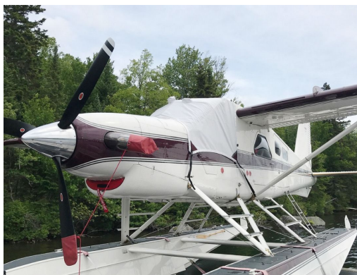
DeHavilland Turbo Beaver Cockpit Cover and Inlet Plug

Engine Inlet Plugs are custom fit for your DeHavilland Beaver DHC-2, U-6A, U-6B intakes, made with heavy-duty vinyl material, and stuffed with a single block of sculpted urethane foam. Each plug has a zipper that allows the foam to be removed and dried if necessary. Engine plugs have warning flags that are visible from the cockpit or 'remove before flight' streamers sewn onto the face of the plugs. Most plugs are imprinted with the aircraft registration number in black for an extra charge. Storage bag NOT included. Engine plugs may be inserted after flight when the engine is still warm. Engine Inlet Plugs are commonly referred to as Cowl Plugs, Intake Plugs, Cowl Blocks, Engine Blocks, and Engine Bungs.