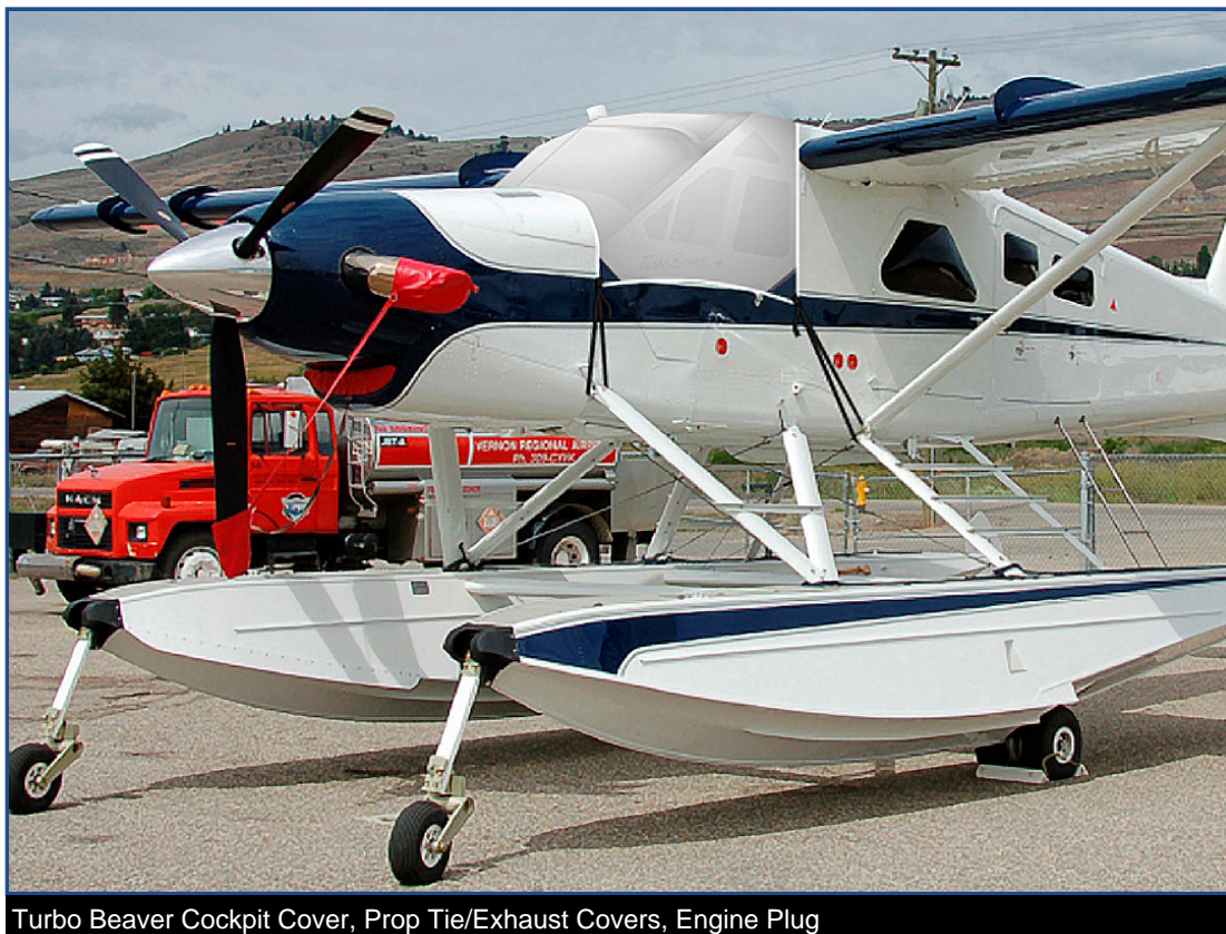
Turbo Beaver Cockpit Cover, Prop Tie/Exhaust Covers, Engine Plug