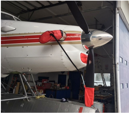
DeHavilland Turbin Otter Intake plugs, Prop Tie/Exhaust Covers

The material is very reflective, and tests show that the cabin interior temperature can be reduced to near-ambient temperature on the hottest of days. It is water, ice and snow repellent, yet breathable to allow moisture to escape from between the cover and the aircraft surface.