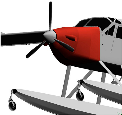
Turbo Beaver Insulated Engine Cover, 3D model