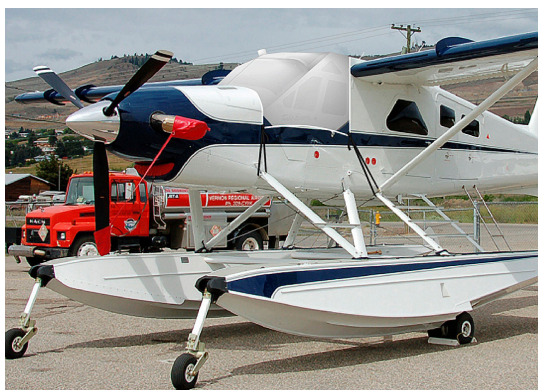
Turbo Beaver Cockpit Cover, Prop Tie/Exhaust Covers, Engine Plug