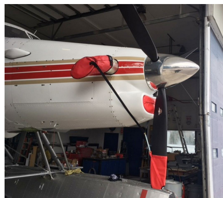
DeHavilland Turbin Otter Intake plugs, Prop Tie/Exhaust Covers