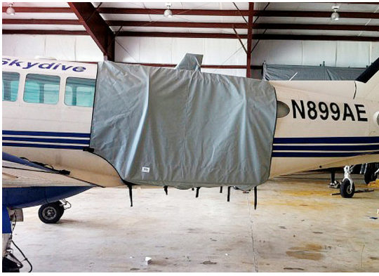
750XL Jump Door Cover