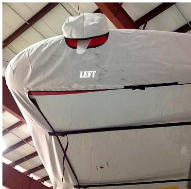
De Havilland Twin Otter Wing Cover wing tip detail

WINTER USE MATERIAL - Made with Solution-Dyed Polyester fabric, this option is intended for seasonal use to aid in deicing, rain mitigation, or for occasional travel. The material is lighter and more compact, but more susceptible to UV damage and may have a shorter useful life if used continuously outside than the all-year use material.