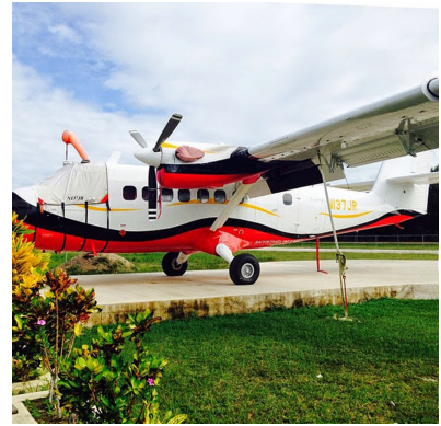
Twin Otter Cockpit Cover & Engine Plugs