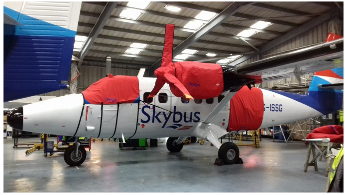
DeHavilland Twin Otter DHC6 (UV-18A) Cockpit Cover (CUSTOM COLOR)