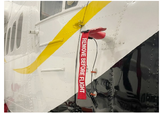
DeHavilland DH-6 Pitot Cover with Static Port Plugs