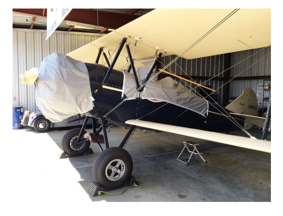
Travel Air 4000 Canopy and Engine Covers, light weight travel Travel Air 4000 Canopy and Engine Covers, light weight travel type