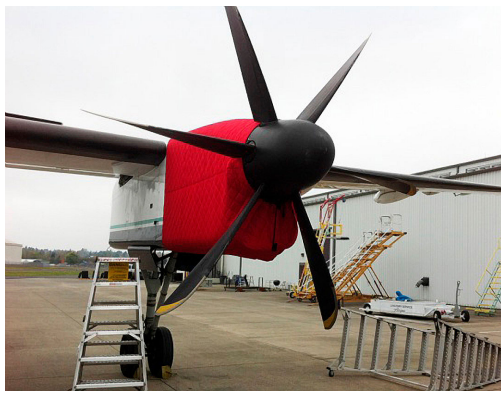
Dash 8-Q400 Insulated Engine Cover