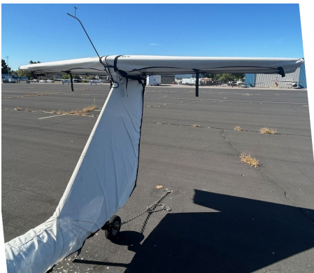
Diamond HK-36 Dimona Horizontal Stabilizer Cover

WINTER USE MATERIAL - Made with Solution-Dyed Polyester fabric, this option is intended for seasonal use to aid in deicing, rain mitigation, or for occasional travel. The material is lighter and more compact, but more susceptible to UV damage and may have a shorter useful life if used continuously outside than the all-year use material.