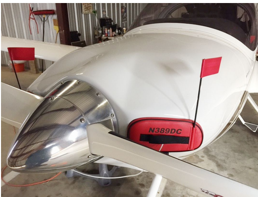
Diamond DA-20-C1 Engine Inlet Plugs

This cover type is made from Silver Acrylic Sunbrella canvas and is 100% lined with a soft and smooth microfiber. Bruce's Custom Covers developed this material combination especially for aircraft protection. The outer material is medium weight and treated for water resistance, UV resistance and anti-static buildup. The inner lining is a very soft and smooth microfiber to prevent scratching. The material is very reflective, and tests show that the cabin interior temperature can be reduced to near-ambient temperature on the hottest of days. It is water, ice and snow repellent, yet breathable to allow moisture to escape from between the cover and the aircraft surface.