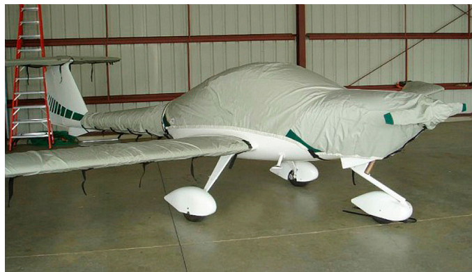
DA-20 Canopy/Engine, Prop/Spinner, Wing, Tailboom, Horiz. Stab. Covers