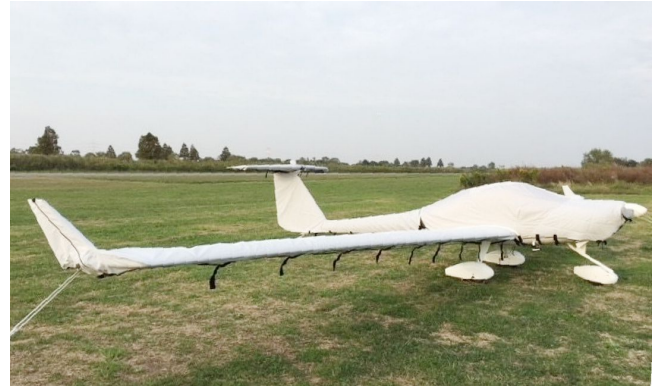
Diamond Super Dimona Cover Set