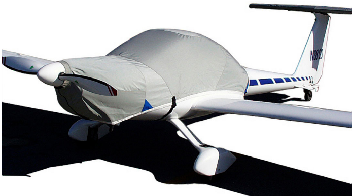
Diamond DA-20 Canopy/Engine Cover

The Diamond HK-36, Super Dimona & Extreme Canopy/Engine Cover is a one-piece cover (100% lined with microfiber) that is a combination of the Canopy Cover and Engine Cover. This cover will enclose the engine cowl and will extend aft to cover all of the windows. This cover type is made from Silver Acrylic Sunbrella canvas and is 100% lined with a soft and smooth microfiber. Bruce's Custom Covers developed this material combination especially for aircraft protection. The outer material is medium weight and treated for water resistance, UV resistance and anti-static buildup. The inner lining is a very soft and smooth microfiber to prevent scratching. The material is very reflective, and tests show that the cabin interior temperature can be reduced to near-ambient temperature on the hottest of days. It is water, ice and snow repellent, yet breathable to allow moisture to escape from between the cover and the aircraft surface.