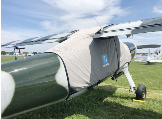
Dornier DO-27 Canopy Cover

This cover type is made from Silver Acrylic Sunbrella canvas and is 100% lined with a soft and smooth microfiber. Bruce's Custom Covers developed this material combination especially for aircraft protection. The outer material is medium weight and treated for water resistance, UV resistance and anti-static buildup. The inner lining is a very soft and smooth microfiber to prevent scratching. The material is very reflective, and tests show that the cabin interior temperature can be reduced to near-ambient temperature on the hottest of days. It is water, ice and snow repellent, yet breathable to allow moisture to escape from between the cover and the aircraft surface.