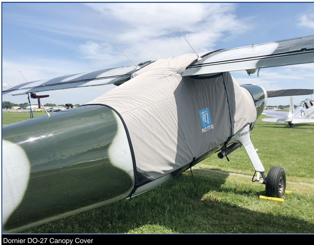
Dornier DO-27 Canopy Cover