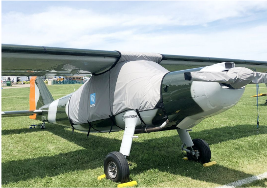
Dornier DO-27 Canopy Cover, Prop Cover