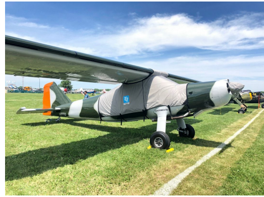
Dornier DO-27 Canopy Cover, Prop Cover