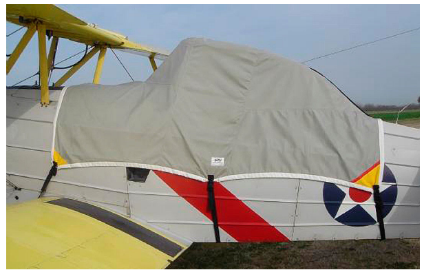
Grumman Ag Cat Canopy Cover