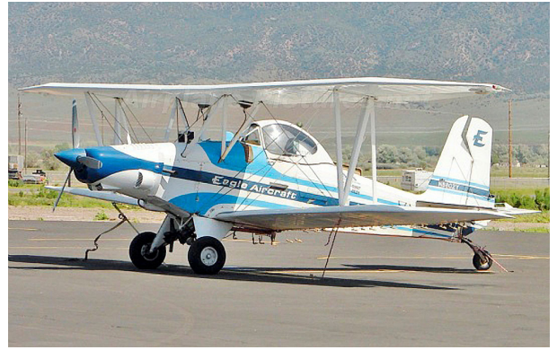
Covers for the Eagle DW-1