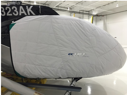
EC-130 Insulated Bubble Cover