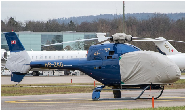
Eurocopter EC-120 Bubble, Rotor Mast & Tailfan Covers

Insulated Covers Material - A special composite material of solution-dyed polyester, 3M Thinsulate insulation, and soft nylon interior fabric. Our insulated covers are designed to complement an engine preheater and help retain heat in the engine compartment after shutdown. If you operate your aircraft in cold-weather, these covers will help prevent engine wear and tear.