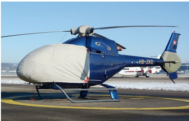
Eurocopter EC-120 Bubble, Rotor Mast & Tailfan Covers