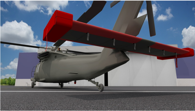
Padded Horizontal Stab Covers, Wingtip Pads (illustration)

Designed to prevent damage to the aircraft extremities in crowded hangars, these products are made of bright red Naugahyde and thickly padded with a sandwich of closed cell foam.