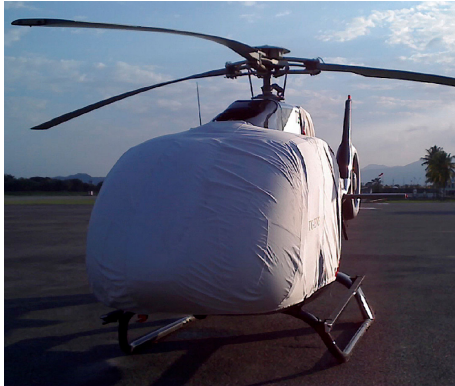
Bubble Cover and Intake/Exhaust Cover

This cover type is made from Silver Acrylic Sunbrella canvas and is 100% lined with a soft and smooth microfiber. Bruce's Custom Covers developed this material combination especially for aircraft protection. The outer material is medium weight and treated for water resistance, UV resistance and anti-static buildup. The inner lining is a very soft and smooth microfiber to prevent scratching. The material is very reflective, and tests show that the cabin interior temperature can be reduced to near-ambient temperature on the hottest of days. It is water, ice and snow repellent, yet breathable to allow moisture to escape from between the cover and the aircraft surface.