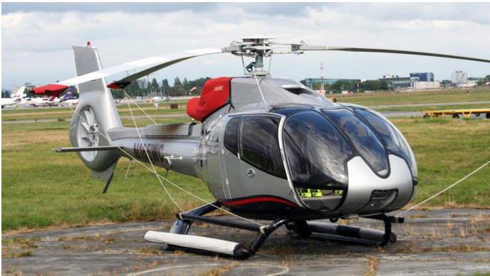
Intake/Exhaust Cover, Rotor Hub Cover (w/ skirt) & Blade Tie Downs