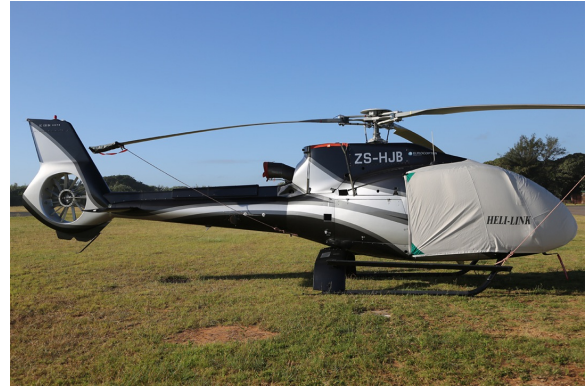
EC-130 Bubble Cover