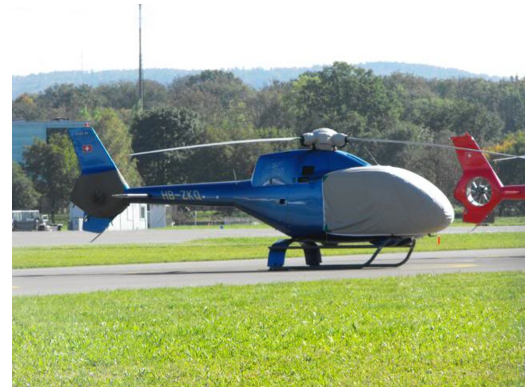
EC-130 Bubble, Tailfan, and Rotor Hub Cover