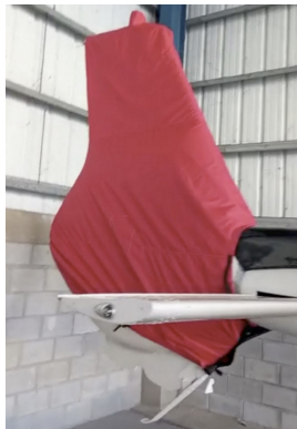
Eurocopter EC-130 Tailfan/Upper Vert Stab Housing Cover

The Tailboom Cover details vary by model, but generally the helicopter tail boom cover encloses the tail boom from the "bottleneck" to the aft end. They usually also cover the horizontal stabilizers, and are custom made to allow for antennae, lights, and other protrusions. They attach with straps underneath the tail boom. Covers for the vertical and horizontal stabilizers are also available separately. Specific information for each model is available on request.