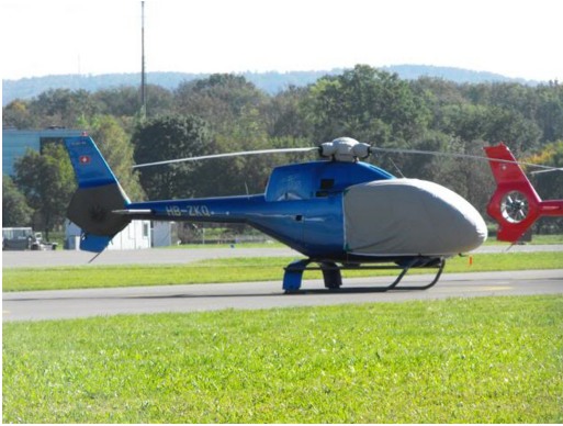
EC-130 Bubble, Tailfan, and Rotor Hub Cover

This cover type is made from Silver Acrylic Sunbrella canvas and is 100% lined with a soft and smooth microfiber. Bruce's Custom Covers developed this material combination especially for aircraft protection. The outer material is medium weight and treated for water resistance, UV resistance and anti-static buildup. The inner lining is a very soft and smooth microfiber to prevent scratching. The material is very reflective, and tests show that the cabin interior temperature can be reduced to near-ambient temperature on the hottest of days. It is water, ice and snow repellent, yet breathable to allow moisture to escape from between the cover and the aircraft surface.