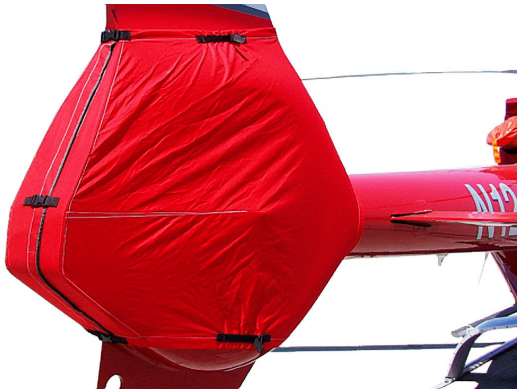
Eurocopter EC-120 Tailfan Cover

The Tailboom Cover details vary by model, but generally the helicopter tail boom cover encloses the tail boom from the "bottleneck" to the aft end. They usually also cover the horizontal stabilizers, and are custom made to allow for antennae, lights, and other protrusions. They attach with straps underneath the tail boom. Covers for the vertical and horizontal stabilizers are also available separately. Specific information for each model is available on request.