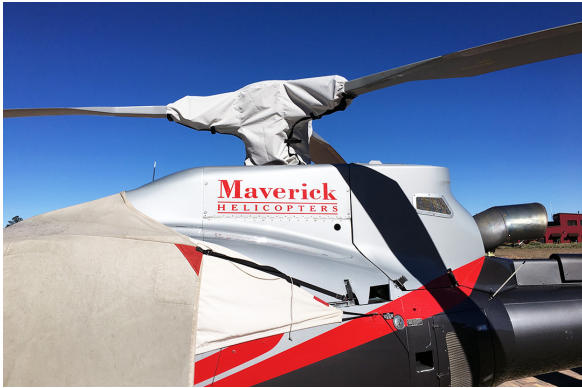
Eurocopter EC-130 Main Rotor Hub Cover

tight at the blade root with straps and quick-release plastic buckles. The Cold Weather Blade Covers are fitted with full-length zippers and optional deice “boots” designed to accept a preheater hose; a small opening at the tip of the cover allows for some air circulation and drainage in freezing weather. Some part numbers have features for an extra charge.