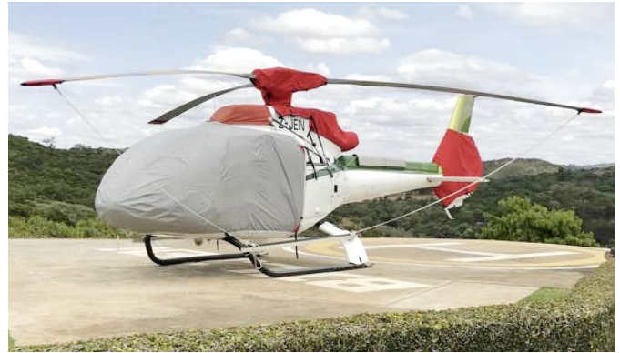
EC130 Bubble, Intake, Exhaust, Rotor Hub & Tailfan Covers