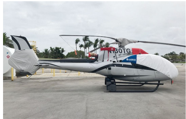
AIRBUS H130 T2, Intake, Exhaust & Tailfan Covers