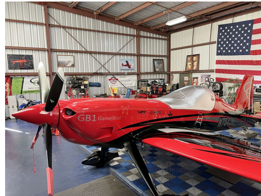
Gamebird GB-1 Solar Cap (single place), CUSTOM COVERS & IMPRINTING AVAILABLE!