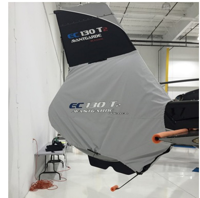
EC-130 Tailfan Cover