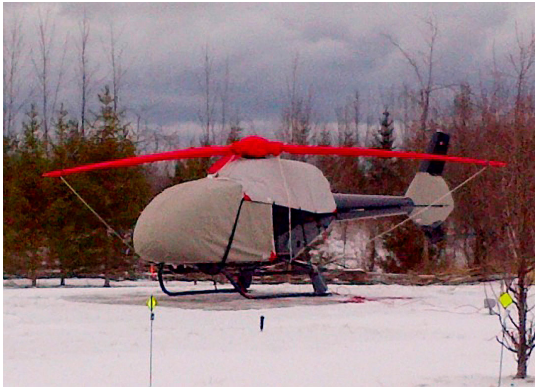
EC-130 Bubble, Engine, Rotor Hub, Blade & Tailfan Covers

tight at the blade root with straps and quick-release plastic buckles. The Cold Weather Blade Covers are fitted with full-length zippers and optional deice “boots” designed to accept a preheater hose; a small opening at the tip of the cover allows for some air circulation and drainage in freezing weather. Some part numbers have features for an extra charge.