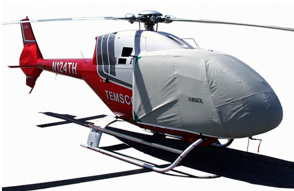
Eurocopter EC-120 Bubble Cover & Tailfan Cover