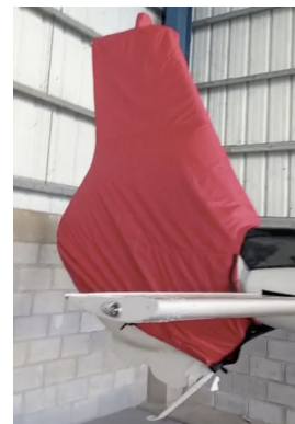
Eurocopter EC-130 Tailfan/Upper Vert Stab Housing Cover