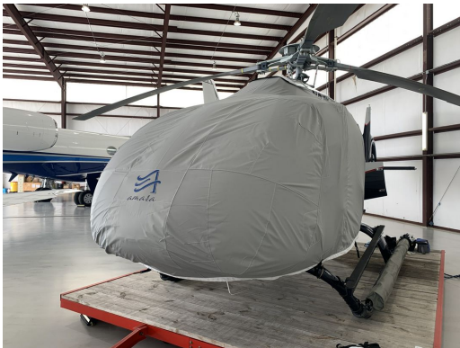
Airbus H-130 Bubble Cover, Travel Weight

This cover type is made from Silver Acrylic Sunbrella canvas and is 100% lined with a soft and smooth microfiber. Bruce's Custom Covers developed this material combination especially for aircraft protection. The outer material is medium weight and treated for water resistance, UV resistance and anti-static buildup. The inner lining is a very soft and smooth microfiber to prevent scratching. The material is very reflective, and tests show that the cabin interior temperature can be reduced to near-ambient temperature on the hottest of days. It is water, ice and snow repellent, yet breathable to allow moisture to escape from between the cover and the aircraft surface.