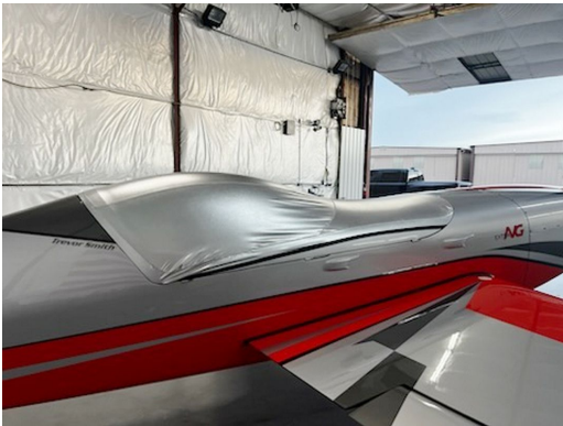
Extra NG Models Canopy Cover

This cover type is made from Silver Acrylic Sunbrella canvas and is 100% lined with a soft and smooth microfiber. Bruce's Custom Covers developed this material combination especially for aircraft protection. The outer material is medium weight and treated for water resistance, UV resistance and anti-static buildup. The inner lining is a very soft and smooth microfiber to prevent scratching. The material is very reflective, and tests show that the cabin interior temperature can be reduced to near-ambient temperature on the hottest of days. It is water, ice and snow repellent, yet breathable to allow moisture to escape from between the cover and the aircraft surface.