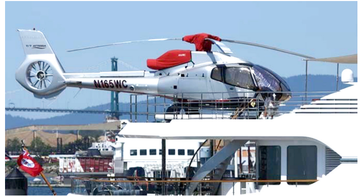
Intake/Exhaust Cover & Rotor Hub Cover (w/ skirt)