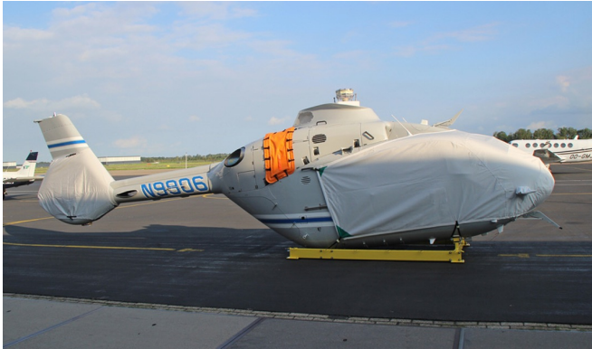
Eurocopter EC-135 Bubble & Tailfan Covers

This cover type is made from Silver Acrylic Sunbrella canvas and is 100% lined with a soft and smooth microfiber. Bruce's Custom Covers developed this material combination especially for aircraft protection. The outer material is medium weight and treated for water resistance, UV resistance and anti-static buildup. The inner lining is a very soft and smooth microfiber to prevent scratching. The material is very reflective, and tests show that the cabin interior temperature can be reduced to near-ambient temperature on the hottest of days. It is water, ice and snow repellent, yet breathable to allow moisture to escape from between the cover and the aircraft surface.