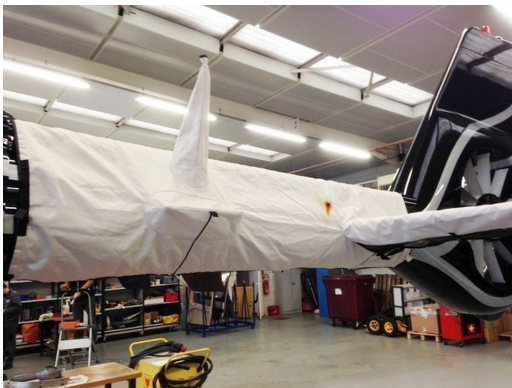
Airbus EC-135 Tailboom/Stabilizer Cover

The Tailboom Cover details vary by model, but generally the helicopter tail boom cover encloses the tail boom from the "bottleneck" to the aft end. They usually also cover the horizontal stabilizers, and are custom made to allow for antennae, lights, and other protrusions. They attach with straps underneath the tail boom. Covers for the vertical and horizontal stabilizers are also available separately. Specific information for each model is available on request.