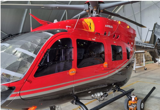
Airbus Helicopter H145D3 Intake Plugs

The Engine Inlet Plugs are custom fit for your Eurocopter EC-145, UH-145, BK-117 D-2 intakes, made with heavy-duty vinyl material, and stuffed with a single block of sculpted urethane foam. Each plug has a zipper that allows the foam to be removed and dried if necessary. Engine plugs have 'Remove Before Flight' streamers sewn onto the face of the plugs. Most plugs are imprinted with the aircraft registration number in black for an extra charge. Storage bag NOT included. Engine plugs may be inserted after flight when the engine is still warm. Engine Inlet Plugs are commonly referred to as Cowl Plugs, Intake Plugs, Cowl Blocks, Engine Blocks, and Engine Bungs.