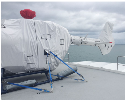
Eurocopter EC-145 D2 Main Body Cover, Tailboom/Fenestron Cover