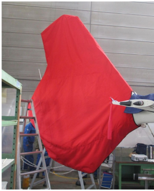
Airbus EC145 Tailfan Housing Fenestron Cover