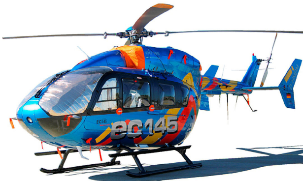
EC-145 Cabin Heatshield Set

Heatshields are interior sunshades for an aircraft's windows or canopy glass. The product is a unique composite of closed-cell foam with a silver mylar finish. The semi-rigid design is stiff enough to stand along the inside of the windshield using sun visors or window framing. It folds up flat and easily stores in the included storage sleeve. Some designs may require velcro and suction cups. A Heatshield is an excellent short-term remedy for cockpit overheating.