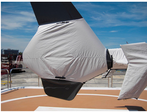
EC-135 Tailfan Cover and Tailboom Stabilizer Cover