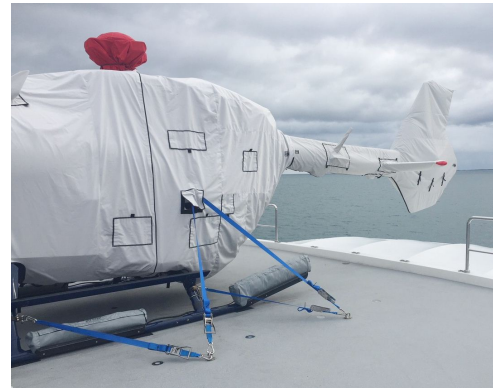
Eurocopter EC-145 D2 Main Body Cover, Tailboom/Fenestron Cover