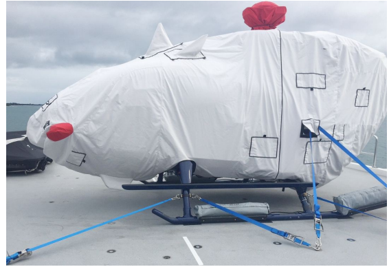
Eurocopter EC-145 D2 Main Body Cover