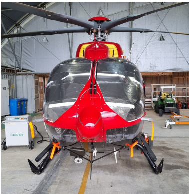
Airbus Helicopter H145D3 Windshield Heatshields, Engine Plugs