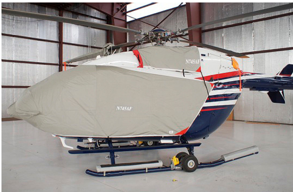
EC-135 Windshield/Skylights Cover, pinches in door jambs Bubble Cover w/ nose mounted radome, Upper Deck Plugs/Cover