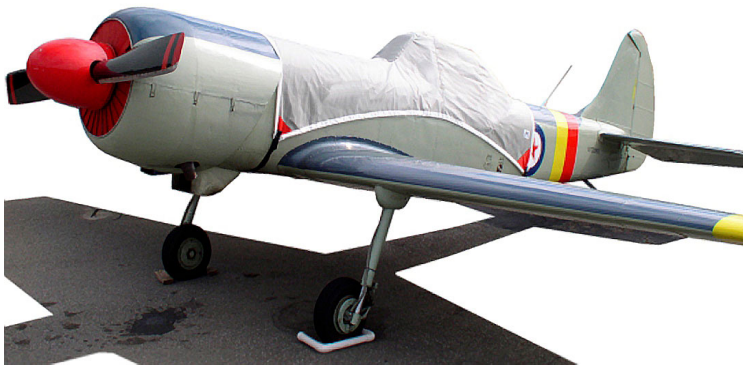
Yak 50 Canopy Cover