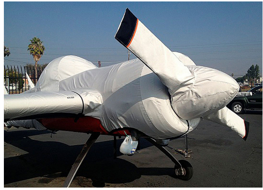
Yak 55 Full Fuselage Cover w/ Detachable Wing Covers & Propellor/Spinner Cover