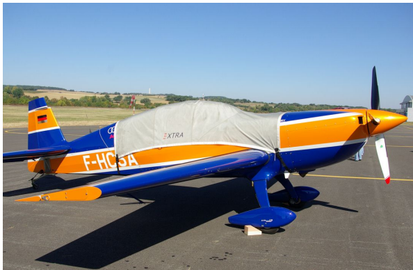
Extra 300L Canopy Cover

This cover type is made from Silver Acrylic Sunbrella canvas and is 100% lined with a soft and smooth microfiber. Bruce's Custom Covers developed this material combination especially for aircraft protection. The outer material is medium weight and treated for water resistance, UV resistance and anti-static buildup. The inner lining is a very soft and smooth microfiber to prevent scratching. The material is very reflective, and tests show that the cabin interior temperature can be reduced to near-ambient temperature on the hottest of days. It is water, ice and snow repellent, yet breathable to allow moisture to escape from between the cover and the aircraft surface.