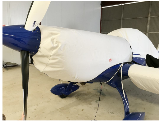
Extra 300, 330SC & 200/230 Models Engine Cover