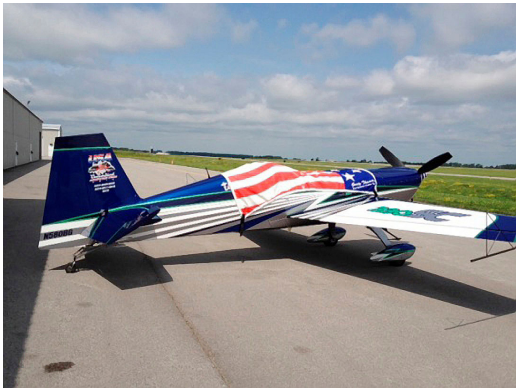
Extra 300SC Canopy Cover with custom artwork