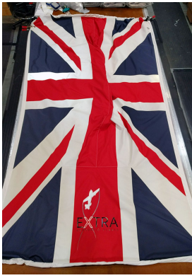
Custom Full-Cover Artwork