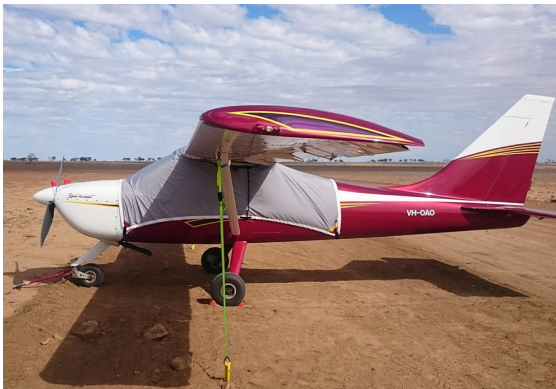
Glastar Sportsman Light Weight Travel Cover