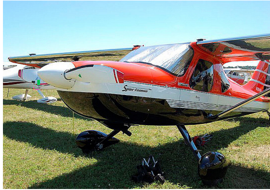
Glastar Sportsman Windshield HeatShield

more effective and practical for long-term protection.