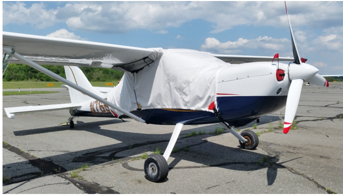
Glastar Over-Top Canopy Cover, Engine Plugs

plugs have warning flags that are visible from the cockpit or 'remove before flight' streamers sewn onto the face of the plugs. Most plugs are imprinted with the aircraft registration number in black for an extra charge. Storage bag NOT included. Engine plugs may be inserted after flight when the engine is still warm. Engine Inlet Plugs are commonly referred to as Cowl Plugs, Intake Plugs, Cowl Blocks, Engine Blocks, and Engine Bungs.