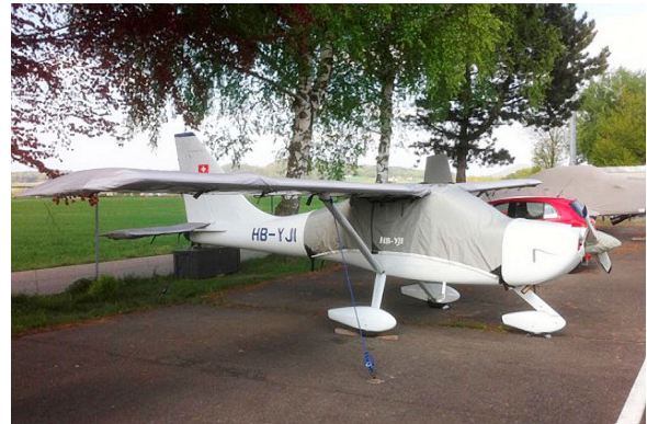
Glasair Aviation Glastar, Sportsman 2+2 Insulated Engine Cover OMF Symphony Canopy, Wings, Horiz. Stab, and Prop Covers