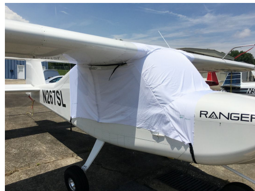
Vashon Ranger VR-7 Canopy Cover, test fit cover