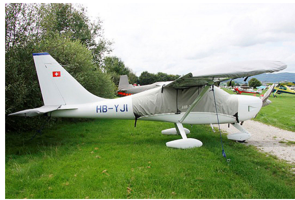
Glastar Canopy, Wings, Horizontal Stab. & Prop Covers