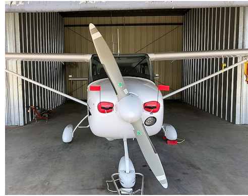
2006 OMF Symphony SA160