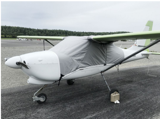
Glasair Aviation Glastar, Sportsman 2+2 Travel Cover, Light Weight Travel Canopy Cover

Travel Covers are made with Silver Solution-Dyed Polyester fabric and only lined over the windshield to save weight. The material is lightweight and more compact for easy stowage in the aircraft. The polyester material is water resistant, but only intended for occasional use outside. We also have an ultra lightweight material available for fitted hangar dust covers. For daily outdoor use, the non-travel Sunbrella Cover is the best choice.