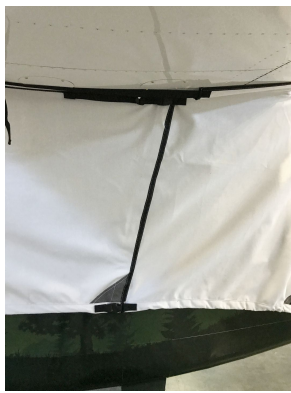
Vashon Ranger R7 Canopy Cover

This cover type is made from Silver Acrylic Sunbrella canvas and is 100% lined with a soft and smooth microfiber. Bruce's Custom Covers developed this material combination especially for aircraft protection. The outer material is medium weight and treated for water resistance, UV resistance and anti-static buildup. The inner lining is a very soft and smooth microfiber to prevent scratching. The material is very reflective, and tests show that the cabin interior temperature can be reduced to near-ambient temperature on the hottest of days. It is water, ice and snow repellent, yet breathable to allow moisture to escape from between the cover and the aircraft surface.