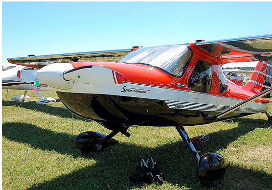
Glastar Sportsman Windshield HeatShield

more effective and practical for long-term protection.