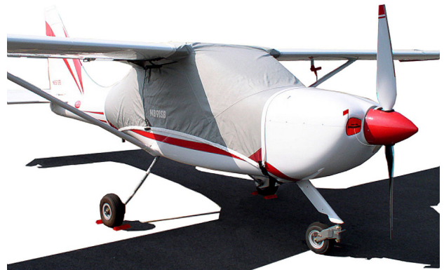
Glastar Over-Top Canopy Cover