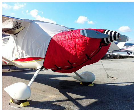
Glastar Insulated Engine Cover