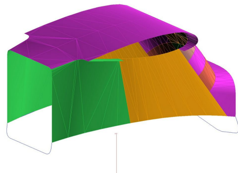
Vashon R-7 Ranger Canopy Cover, 3D model