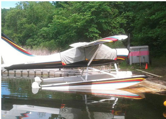
Glastar Sportsman Canopy Cover