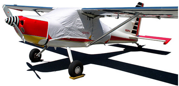
Glastar Over-Top Canopy Cover