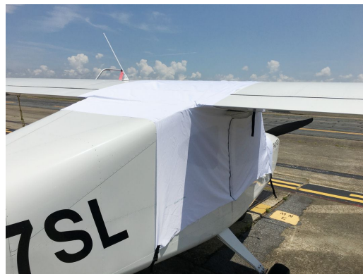
Vashon Ranger VR-7 Canopy Cover, test fit cover