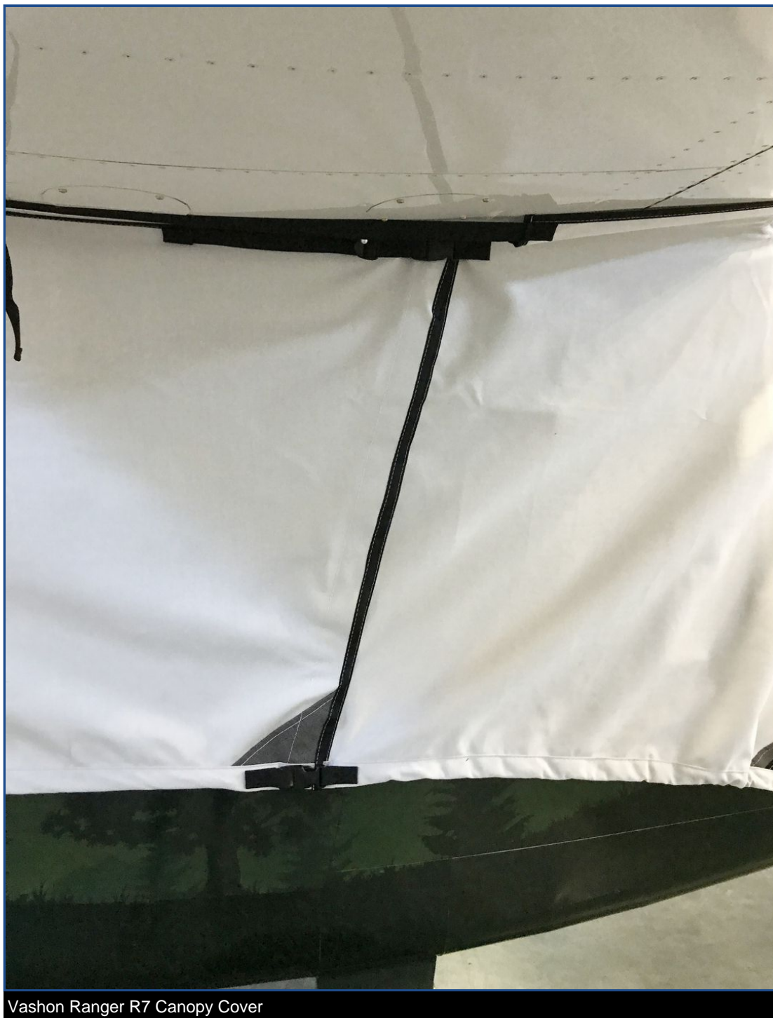
Vashon Ranger R7 Canopy Cover