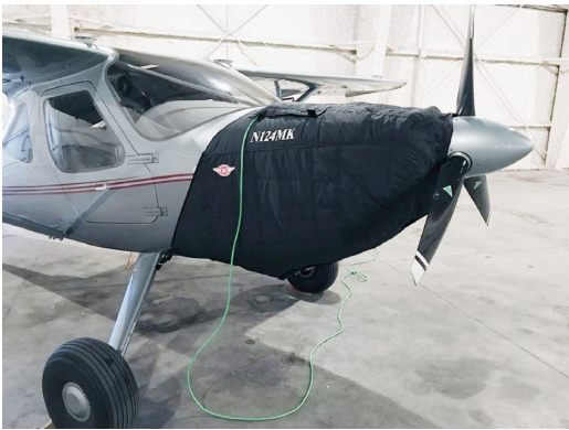
Glasair Aviation Glastar, Sportsman 2+2 Insulated Engine Cover