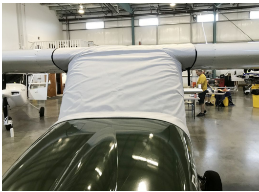
Vashon Ranger R7 Canopy Cover

This cover type is made from Silver Acrylic Sunbrella canvas and is 100% lined with a soft and smooth microfiber. Bruce's Custom Covers developed this material combination especially for aircraft protection. The outer material is medium weight and treated for water resistance, UV resistance and anti-static buildup. The inner lining is a very soft and smooth microfiber to prevent scratching. The material is very reflective, and tests show that the cabin interior temperature can be reduced to near-ambient temperature on the hottest of days. It is water, ice and snow repellent, yet breathable to allow moisture to escape from between the cover and the aircraft surface.