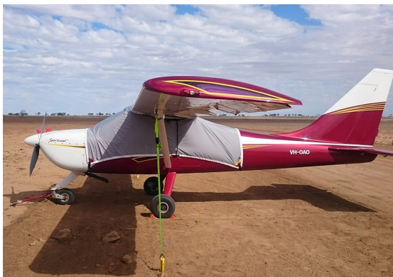
Glstar Sportsman Light Weight Travel Cover

This cover type is made from Silver Acrylic Sunbrella canvas and is 100% lined with a soft and smooth microfiber. Bruce's Custom Covers developed this material combination especially for aircraft protection. The outer material is medium weight and treated for water resistance, UV resistance and anti-static buildup. The inner lining is a very soft and smooth microfiber to prevent scratching. The material is very reflective, and tests show that the cabin interior temperature can be reduced to near-ambient temperature on the hottest of days. It is water, ice and snow repellent, yet breathable to allow moisture to escape from between the cover and the aircraft surface.