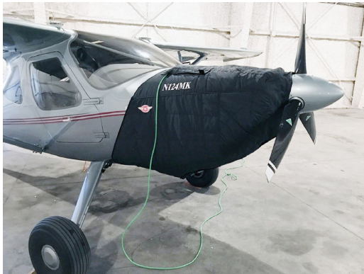
Glasair Aviation Glastar, Sportsman 2+2 Insulated Engine Cover

This cover type is made from Silver Acrylic Sunbrella canvas and is 100% lined with a soft and smooth microfiber. Bruce's Custom Covers developed this material combination especially for aircraft protection. The outer material is medium weight and treated for water resistance, UV resistance and anti-static buildup. The inner lining is a very soft and smooth microfiber to prevent scratching. The material is very reflective, and tests show that the cabin interior temperature can be reduced to near-ambient temperature on the hottest of days. It is water, ice and snow repellent, yet breathable to allow moisture to escape from between the cover and the aircraft surface.