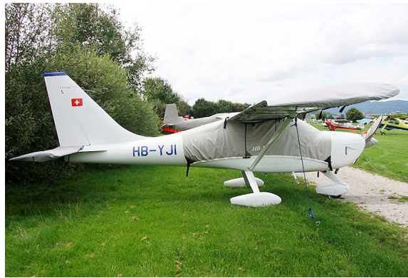
Glstar Canopy, Wings, Horizontal Stab. & Prop Covers

WINTER USE MATERIAL - Made with Solution-Dyed Polyester fabric, this option is intended for seasonal use to aid in deicing, rain mitigation, or for occasional travel. The material is lighter and more compact, but more susceptible to UV damage and may have a shorter useful life if used continuously outside than the all-year use material.