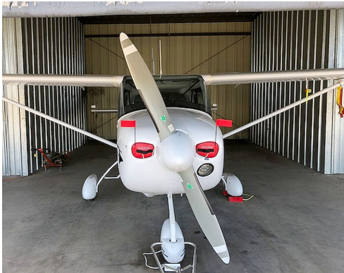
2006 OMF Symphony SA160