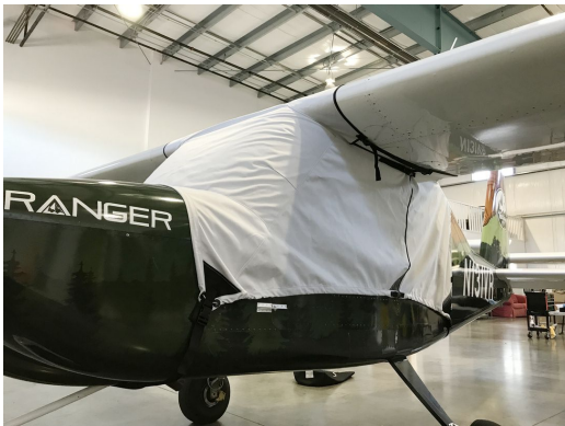
Vashon Ranger R7 Canopy Cover

This cover type is made from Silver Acrylic Sunbrella canvas and is 100% lined with a soft and smooth microfiber. Bruce's Custom Covers developed this material combination especially for aircraft protection. The outer material is medium weight and treated for water resistance, UV resistance and anti-static buildup. The inner lining is a very soft and smooth microfiber to prevent scratching. The material is very reflective, and tests show that the cabin interior temperature can be reduced to near-ambient temperature on the hottest of days. It is water, ice and snow repellent, yet breathable to allow moisture to escape from between the cover and the aircraft surface.