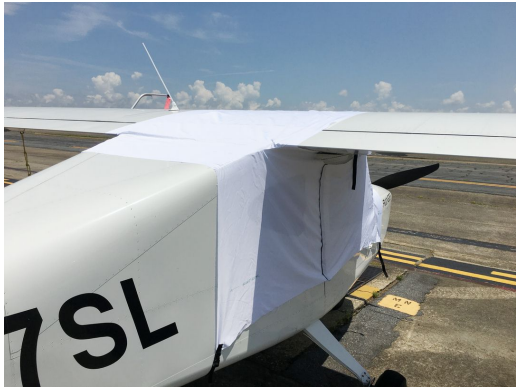
Vashon Ranger VR-7 Canopy Cover, test fit cover

Travel Covers are made with Silver Solution-Dyed Polyester fabric and only lined over the windshield to save weight. The material is lightweight and more compact for easy stowage in the aircraft. The polyester material is water resistant, but only intended for occasional use outside. We also have an ultra lightweight material available for fitted hangar dust covers. For daily outdoor use, the non-travel Sunbrella Cover is the best choice.