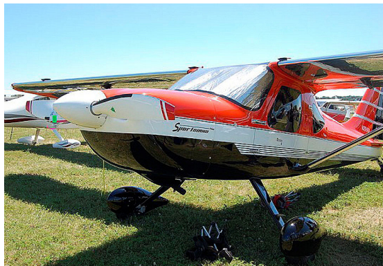
Glastar Sportsman Windshield HeatShield

more effective and practical for long-term protection.