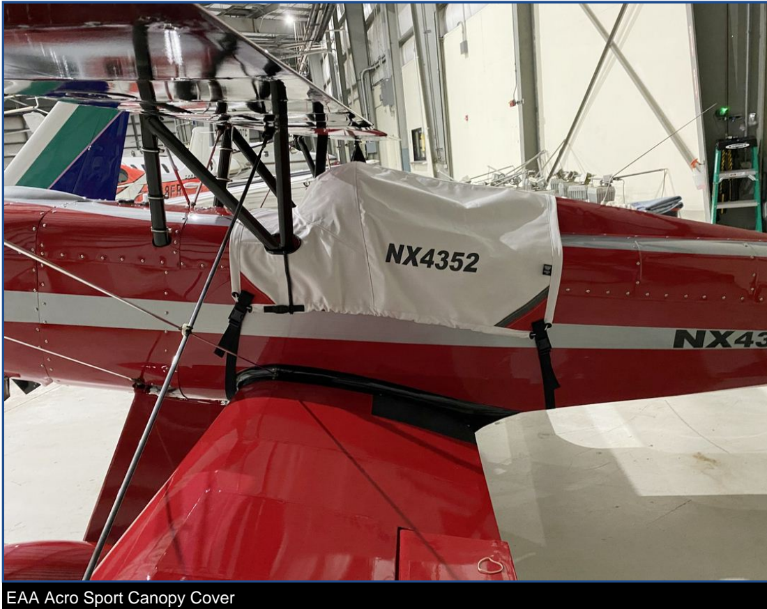
EAA Acro Sport Canopy Cover