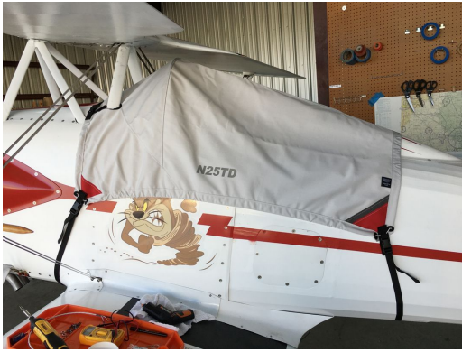
Lil Toot Canopy Cover

the hottest of days. It is water, ice and snow repellent, yet breathable to allow moisture to escape from between the cover and the aircraft surface.