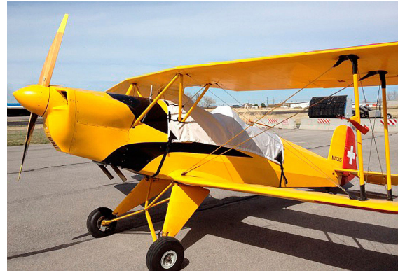
Bucker Jungmann Canopy Cover