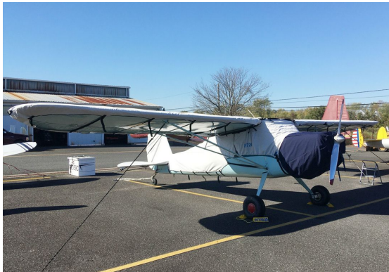
Cessna 140 Canopy, Engine, Wing & Empennage Covers

WINTER USE MATERIAL - Made with Solution-Dyed Polyester fabric, this option is intended for seasonal use to aid in deicing, rain mitigation, or for occasional travel. The material is lighter and more compact, but more susceptible to UV damage and may have a shorter useful life if used continuously outside than the all-year use material.