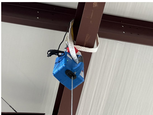
Stearman PT-13 Full Body Dust Cover, Remote Control Winch

Some high value aircraft end up logging lots of hangar time, and become dust magnets in the process. A high quality, well fitting dust cover provides easy assurance that the aircraft's surfaces remain clean and free of grit and grime. Available in a large variety of colors, each dust cover is custom made according to aircraft details and customer preferences. Fire retardant fabrics are also available.