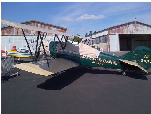
Travelair 4000 Canopy and Engine Cover