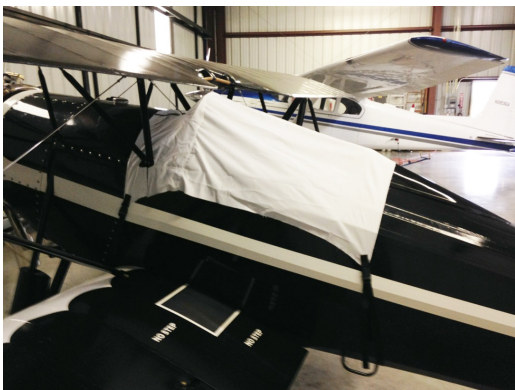
Rose Parrakeet Canopy Cover (test fit cover)