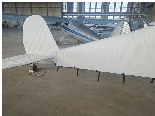
Cessna 140 Empennage Cover

WINTER USE MATERIAL - Made with Solution-Dyed Polyester fabric, this option is intended for seasonal use to aid in deicing, rain mitigation, or for occasional travel. The material is lighter and more compact, but more susceptible to UV damage and may have a shorter useful life if used continuously outside than the all-year use material.