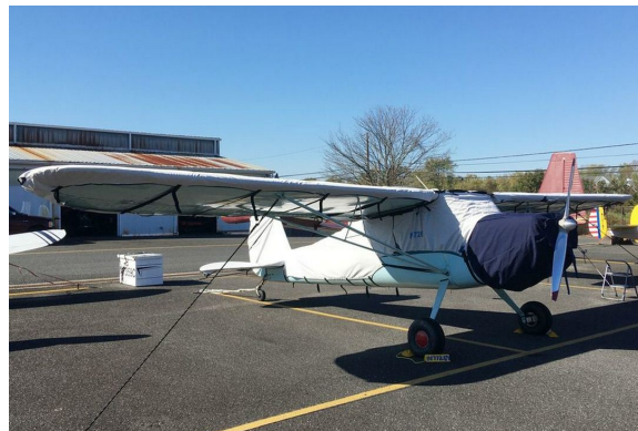
Cessna 140 Insulated Engine, Canopy, Empennage & Wing Covers