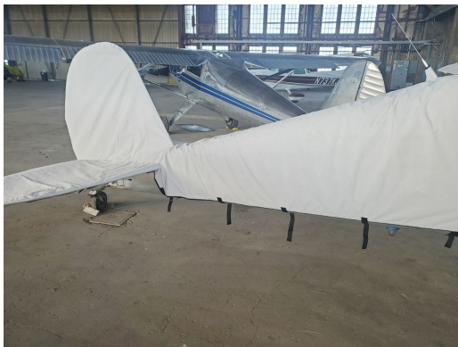
Cessna 140 Empennage Cover

WINTER USE MATERIAL - Made with Solution-Dyed Polyester fabric, this option is intended for seasonal use to aid in deicing, rain mitigation, or for occasional travel. The material is lighter and more compact, but more susceptible to UV damage and may have a shorter useful life if used continuously outside than the all-year use material.