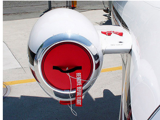
Engine Inlet Plugs set (set of 10, 5 per side)