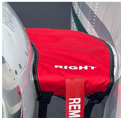
Eclipse EA500, TE500, 550 Pylon Covers

The Eclipse EA500, TE500, 550 Bikini Style Engine Covers are a single-piece design using a soft and smooth stretchy fabric. The cover stretches tightly over both the intake and exhaust, installing quickly and easily. These covers are designed to be used as hangar dust covers and have a useful life of approximately one year.