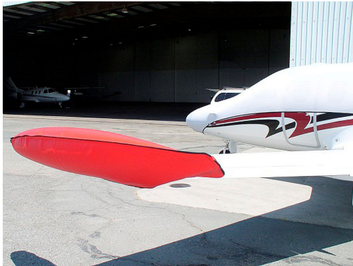
Eclipse Tip Tank Cover

Designed to prevent damage to the aircraft extremities in crowded hangars, these products are made of bright red Naugahyde and thickly padded with a sandwich of closed cell foam. Nowadays they are also made using bright red Neoprene padded laminated (think: wetsuit material).