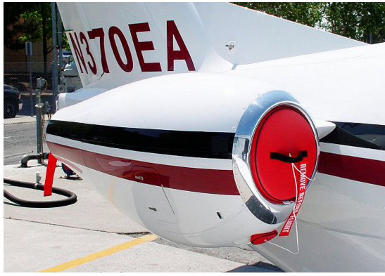
Eclipse Engine Inlet Plugs set