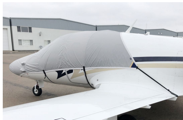
EA500 Travel Cover, Light Weight Travel Cockpit Cover Customized to end before main antenna, with easy to use flat-hook straps.