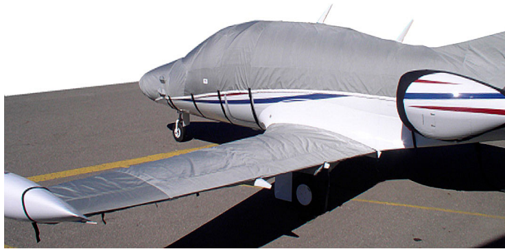
Fuselage Cover & Wing Covers with hail protection on all upper surfaces

WINTER USE MATERIAL - Made with Solution-Dyed Polyester fabric, this option is intended for seasonal use to aid in deicing, rain mitigation, or for occasional travel. The material is lighter and more compact, but more susceptible to UV damage and may have a shorter useful life if used continuously outside than the all-year use material.