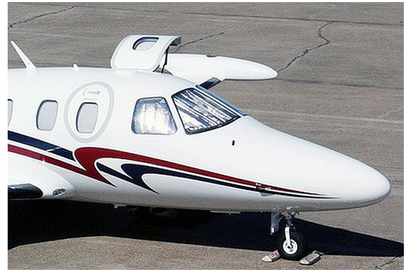
Eclipse Cockpit Heatshields