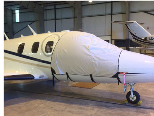
Eclipse Cockpit Door Cover, with Pitot Tube Covers