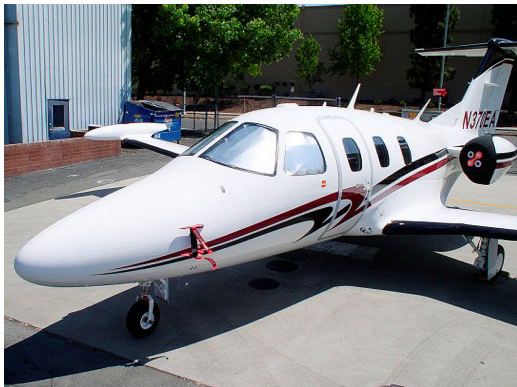
Eclipse Pitot Cover & Bikini Type Engine Covers