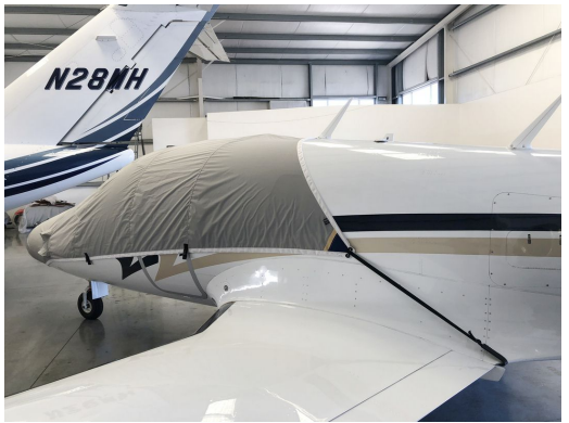
Customized to end before main antenna, with easy to use flat-hook straps. Eclipse EA500 Travel Weight Canopy/Nose Cover