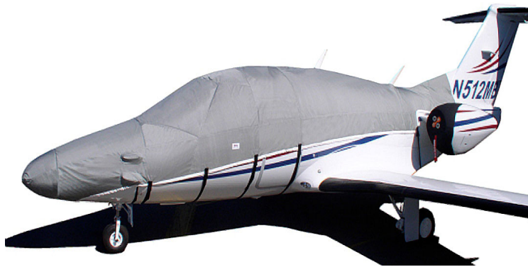
Fuselage Cover, hail protection on all upper surfaces

This cover type is made from Silver Acrylic Sunbrella canvas and is 100% lined with a soft and smooth microfiber. Bruce's Custom Covers developed this material combination especially for aircraft protection. The outer material is medium weight and treated for water resistance, UV resistance and anti-static buildup. The inner lining is a very soft and smooth microfiber to prevent scratching. The material is very reflective, and tests show that the cabin interior temperature can be reduced to near-ambient temperature on the hottest of days. It is water, ice and snow repellent, yet breathable to allow moisture to escape from between the cover and the aircraft surface.