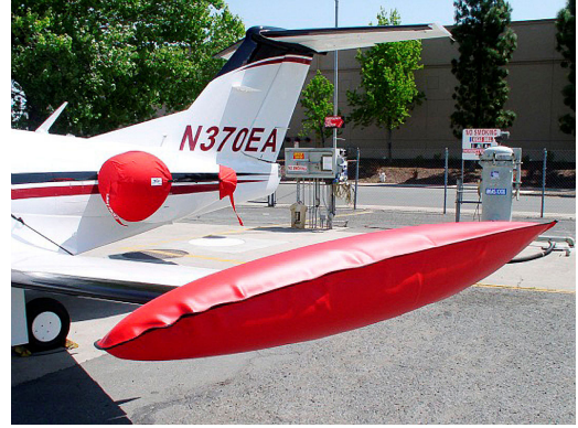
Eclipse Tip Tank & Engine Covers