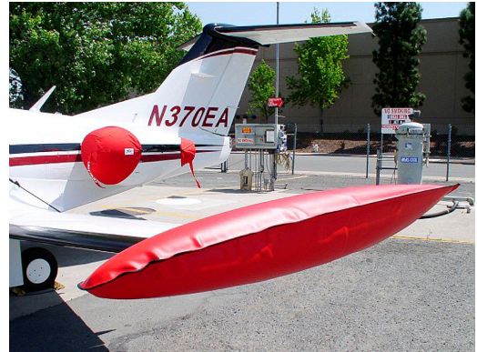
Eclipse Tip Tank & Engine Covers