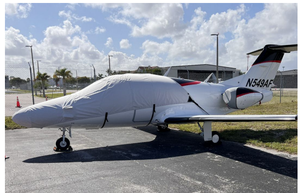
Eclipse EA500 Canopy/Nose Cover