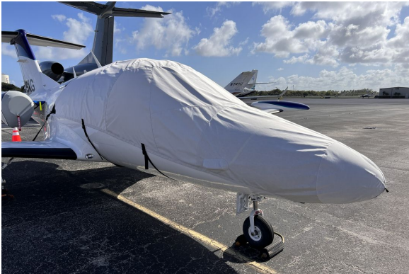
Eclipse EA500 Canopy/Nose Cover

This cover type is made from Silver Acrylic Sunbrella canvas and is 100% lined with a soft and smooth microfiber. Bruce's Custom Covers developed this material combination especially for aircraft protection. The outer material is medium weight and treated for water resistance, UV resistance and anti-static buildup. The inner lining is a very soft and smooth microfiber to prevent scratching. The material is very reflective, and tests show that the cabin interior temperature can be reduced to near-ambient temperature on the hottest of days. It is water, ice and snow repellent, yet breathable to allow moisture to escape from between the cover and the aircraft surface.