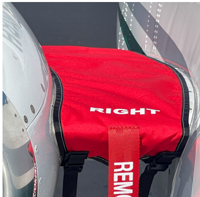
Eclipse EA500, TE500, 550 Pylon Covers

The Eclipse EA500, TE500, 550 Bikini Style Engine Covers are a single-piece design using a soft and smooth stretchy and fabric. The cover stretches tightly over both the intake and exhaust, installing quickly and easily. These covers are designed to be used as hangar dust covers and have a useful life of approximately one year.