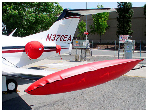
Eclipse Tip Tank & Engine Covers