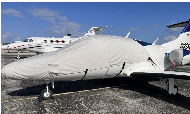
Eclipse EA500 Canopy/Nose Cover

This cover type is made from Silver Acrylic Sunbrella canvas and is 100% lined with a soft and smooth microfiber. Bruce's Custom Covers developed this material combination especially for aircraft protection. The outer material is medium weight and treated for water resistance, UV resistance and anti-static buildup. The inner lining is a very soft and smooth microfiber to prevent scratching. The material is very reflective, and tests show that the cabin interior temperature can be reduced to near-ambient temperature on the hottest of days. It is water, ice and snow repellent, yet breathable to allow moisture to escape from between the cover and the aircraft surface.