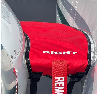
Eclipse EA500, TE500, 550 Pylon Covers