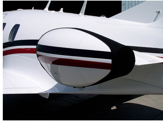
Bikini style Engine Covers