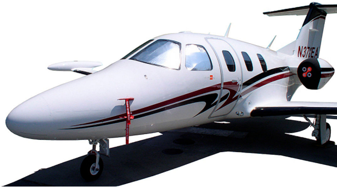
Cockpit HeatShields, Pitot Covers & "Bikini" style Engine Covers