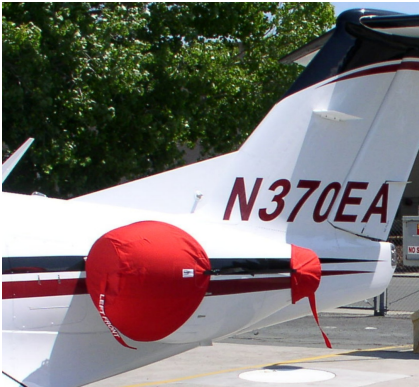
Eclipse Engine Covers, Bruce's design

The Eclipse EA500, TE500, 550 Bikini Style Engine Covers are a single-piece design using a soft and smooth stretchy and fabric. The cover stretches tightly over both the intake and exhaust, installing quickly and easily. These covers are designed to be used as hangar dust covers and have a useful life of approximately one year.