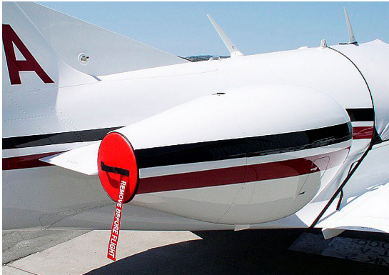
Eclipse Engine Exhaust Plugs set

necessary. Engine plugs have 'remove before flight' streamers sewn onto the face of the plugs. Most plugs are imprinted with the aircraft registration number in black for an extra charge. Storage bag NOT included. Engine plugs may be inserted after flight when the engine is still warm. Engine Inlet Plugs are commonly referred to as Cowl Plugs, Intake Plugs, Cowl Blocks, Engine Blocks, and Engine Bung.