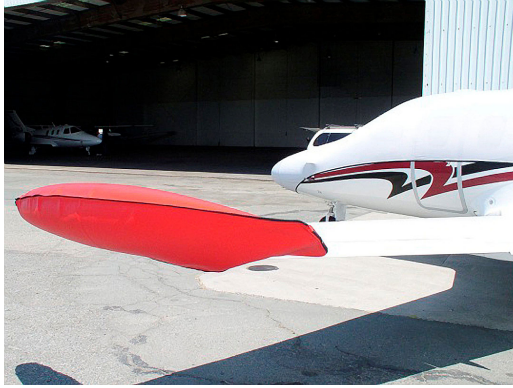
Eclipse Tip Tank Cover

Designed to prevent damage to the aircraft extremities in crowded hangars, these products are made of bright red Naugahyde and thickly padded with a sandwich of closed cell foam.