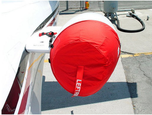
Eclipse Intake Cover & Pylon Wedge Plugs

The Eclipse EA500, TE500, 550 Bikini Style Engine Covers are a single-piece design using a soft and smooth stretchy fabric. The cover stretches tightly over both the intake and exhaust, installing quickly and easily. These covers are designed to be used as hangar dust covers and have a useful life of approximately one year.