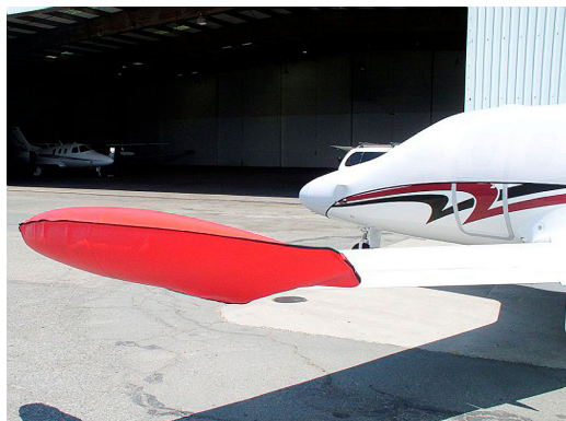
Eclipse Tip Tank Cover

Designed to prevent damage to the aircraft extremities in crowded hangars, these products are made of bright red Naugahyde and thickly padded with a sandwich of closed cell foam.