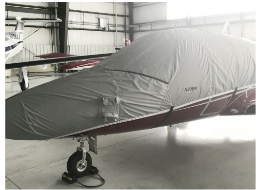
Eclipse EA550 Travel Canopy/Nose Cover