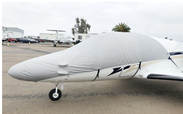
Hangar Dust, Canopy/Nose Cover, Engine Plugs & Tip Tank Pad

Customized to end before main antenna, with easy to use flat-hook straps.