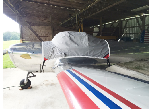
Ercoupe Light Weight Travel Cover