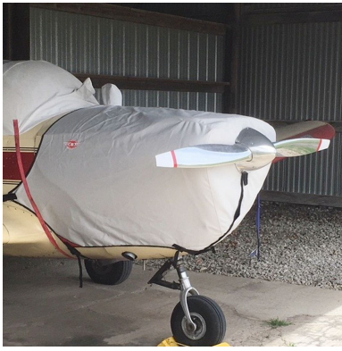
Ercoupe Engine Cover