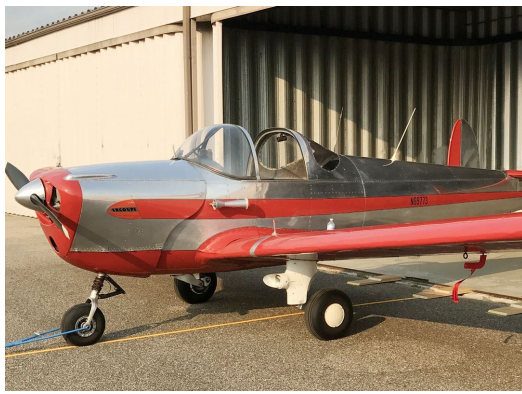
Ercoupe Pitot Cover