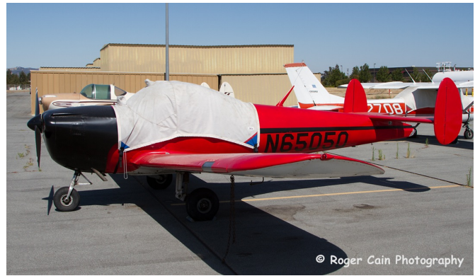
Ercoupe Canopy Cover