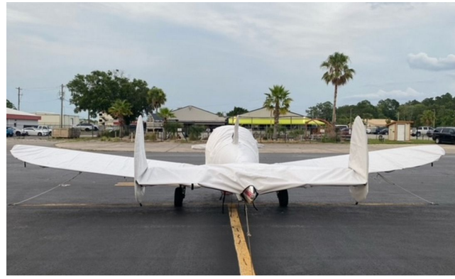
Ercoupe Complete Cover Set