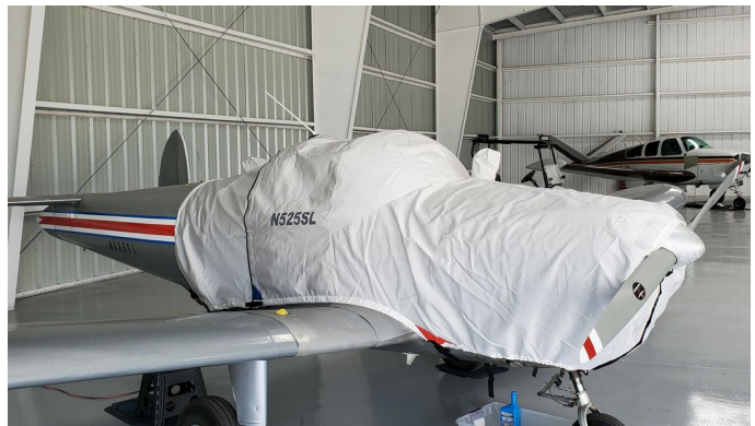
Ercoupe 415-C Extended Canopy/Engine Cover