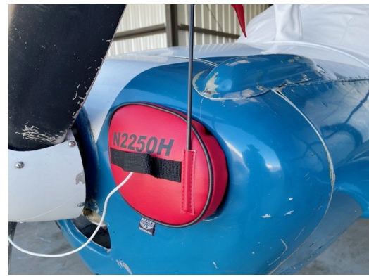
Ercoupe Engine Plugs