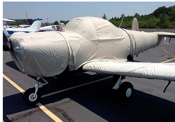
Ercoupe full cover set: Extended Canopy, Engine, Wing & Empennage covers