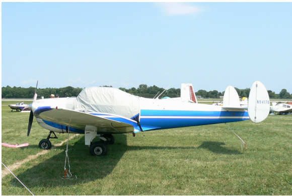
Ercoupe Canopy Cover, flat windshield model

Travel Covers are made with Silver Solution-Dyed Polyester fabric and only lined over the windshield to save weight. The material is lightweight and more compact for easy stowage in the aircraft. The polyester material is water resistant, but only intended for occasional use outside. We also have an ultra lightweight material available for fitted hangar dust covers. For daily outdoor use, the non-travel Sunbrella Cover is the best choice.