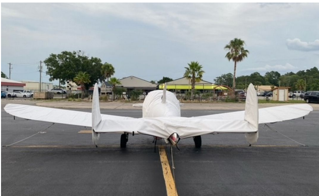
Ercoupe Complete Cover Set

WINTER USE MATERIAL - Made with Solution-Dyed Polyester fabric, this option is intended for seasonal use to aid in deicing, rain mitigation, or for occasional travel. The material is lighter and more compact, but more susceptible to UV damage and may have a shorter useful life if used continuously outside than the all-year use material.