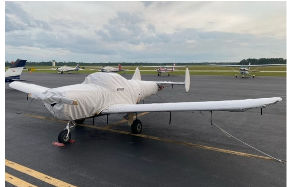
Ercoupe Complete Cover Set