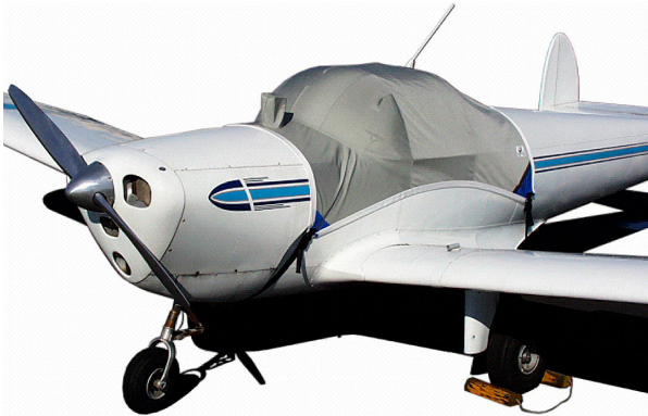
Ercoupe Canopy Cover, bubble windshield model

Travel Covers are made with Silver Solution-Dyed Polyester fabric and only lined over the windshield to save weight. The material is lightweight and more compact for easy stowage in the aircraft. The polyester material is water resistant, but only intended for occasional use outside. We also have an ultra lightweight material available for fitted hangar dust covers. For daily outdoor use, the non-travel Sunbrella Cover is the best choice.