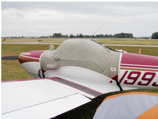
Ercoupe Canopy Cover, bubble windshield model

This cover type is made from Silver Acrylic Sunbrella canvas and is 100% lined with a soft and smooth microfiber. Bruce's Custom Covers developed this material combination especially for aircraft protection. The outer material is medium weight and treated for water resistance, UV resistance and anti-static buildup. The inner lining is a very soft and smooth microfiber to prevent scratching. The material is very reflective, and tests show that the cabin interior temperature can be reduced to near-ambient temperature on the hottest of days. It is water, ice and snow repellent, yet breathable to allow moisture to escape from between the cover and the aircraft surface.