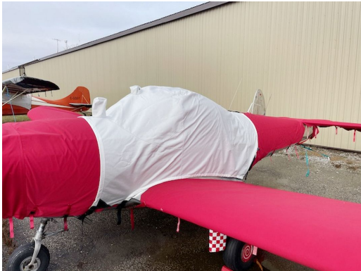
Ercoupe Extended Canopy Cover

This cover type is made from Silver Acrylic Sunbrella canvas and is 100% lined with a soft and smooth microfiber. Bruce's Custom Covers developed this material combination especially for aircraft protection. The outer material is medium weight and treated for water resistance, UV resistance and anti-static buildup. The inner lining is a very soft and smooth microfiber to prevent scratching. The material is very reflective, and tests show that the cabin interior temperature can be reduced to near-ambient temperature on the hottest of days. It is water, ice and snow repellent, yet breathable to allow moisture to escape from between the cover and the aircraft surface.